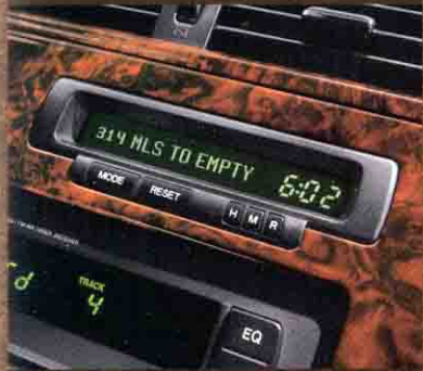
A multi-function trip computer keeps you informed of distance traveled, average speed, elapsed time and approximate miles to empty.