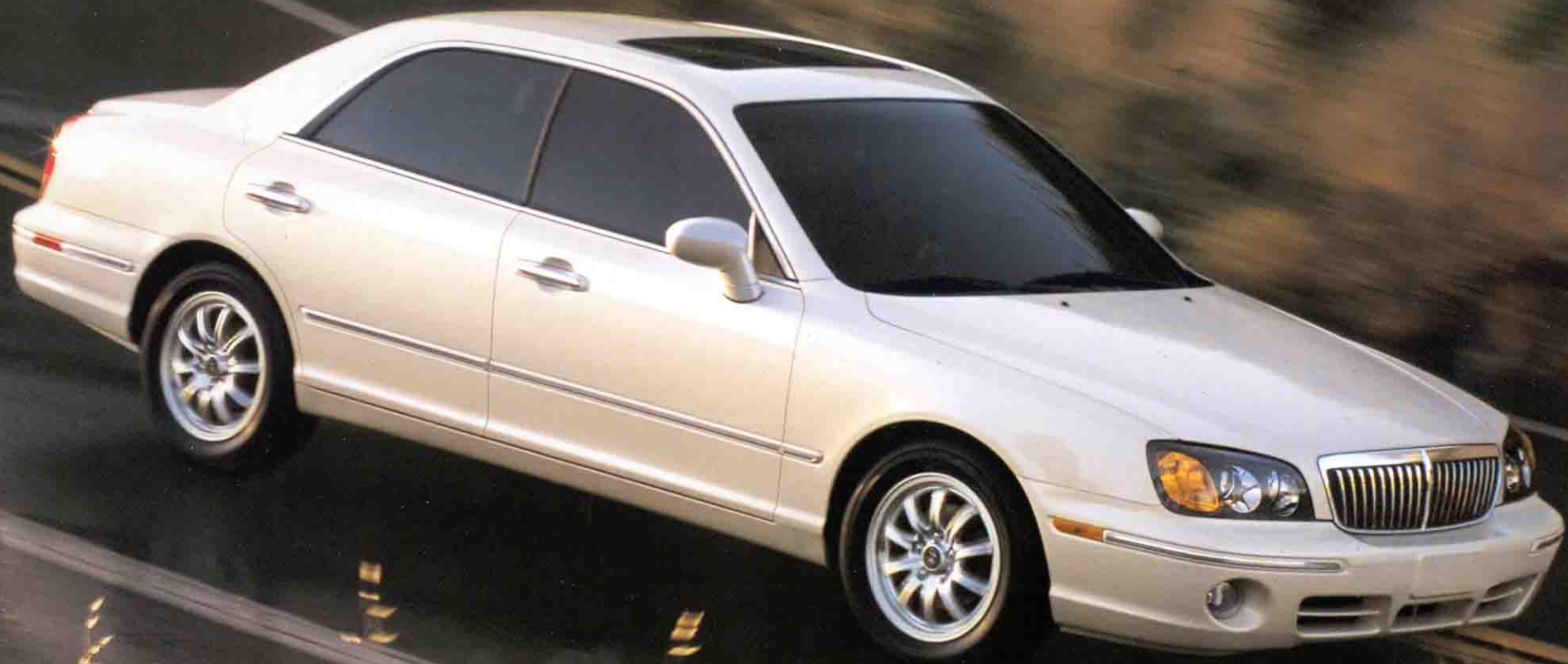
XG350L in Ivory Pearl