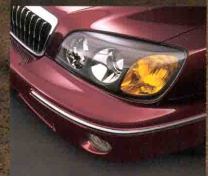
For safer night driving, clear lens, projector-type headlights illuminate the road with bright halogen beams.