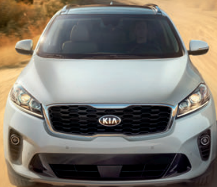
EX W/TOURING PACKAGE SHOWN

Start here to explore the key features and options of Sorento's first three trim choices. Or turn the page to head straight for the higher trim levels.