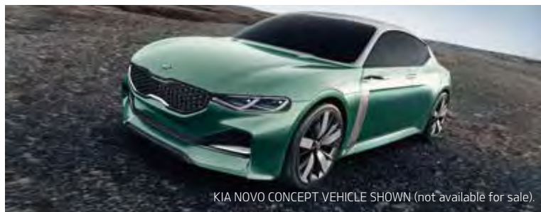
KIA NOVO CONCEPT VEHICLE SHOWN (not available for sale).