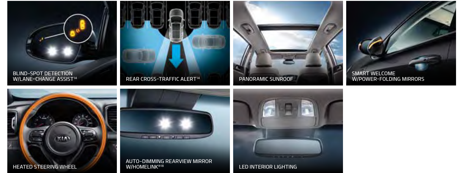
BLIND-SPOT DETECTION W/LANE-CHANGE ASSIST 14