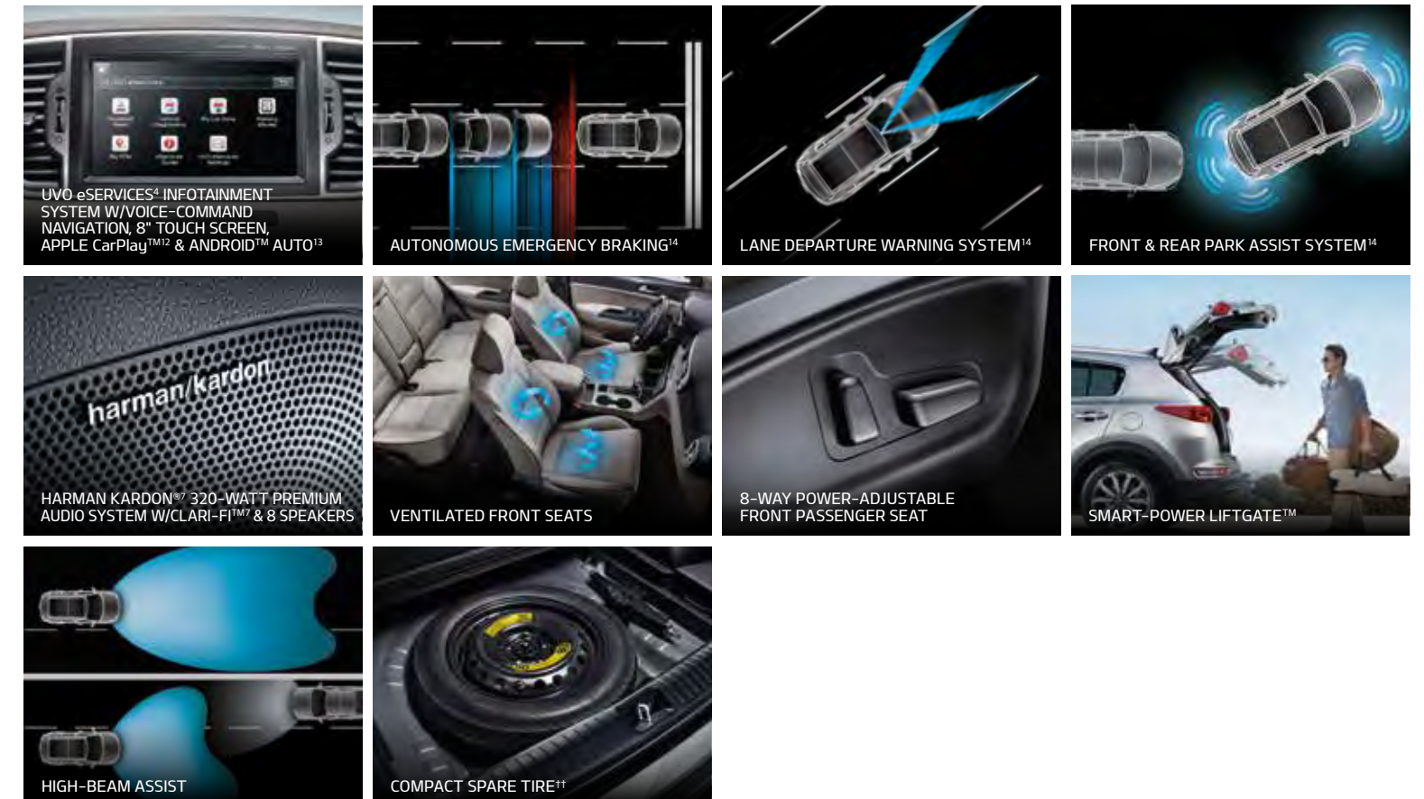
UVO eSERVICES 4 INFOTAINMENT SYSTEM W/VOICE-COMMAND NAVIGATION, 8" TOUCH SCREEN, APPLE CarPlay ™12 & ANDROID ™ AUTO 13