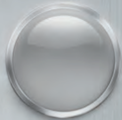
SILKY SILVER A STREAK, A GLIMMER, ENDLESS EXCITEMENT