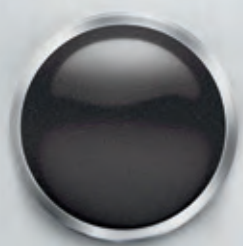
PANTHERA METAL LIMITLESS FORTITUDE, BRAVERY TEMPERED BY WISDOM