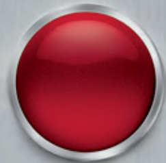
HICHROMA RED INTREPID PASSION, FERVOR, THE PULSE QUICKENING