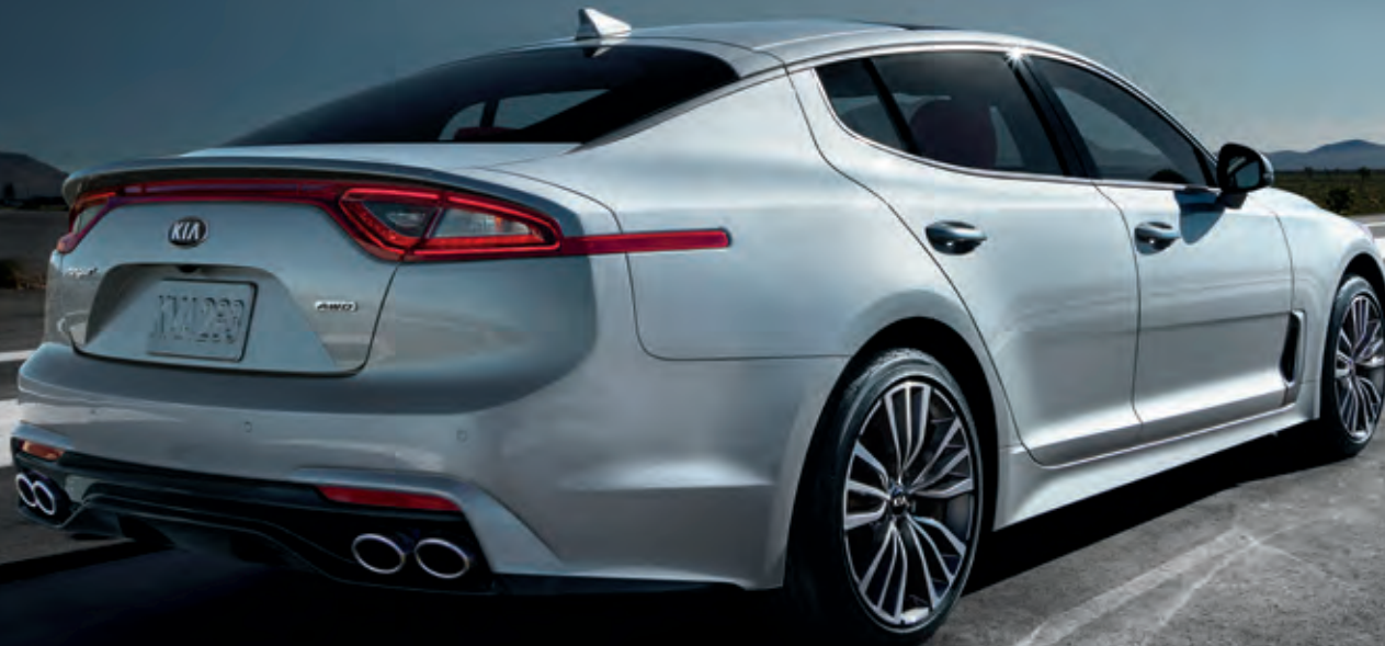
PREMIUM AWD SHOWN

Stinger's powerful 2.0L Twin Scroll turbocharged Gasoline Direct Injection (GDI) engine comes in two trim levels. These key features will help you compare.