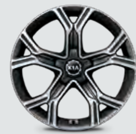
225/40R19 (front) 225/35R19 (rear) 225/45R18 all-season tires (optional on AWD)