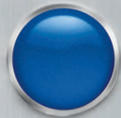
MICRO BLUE HIDDEN DEPTHS, CLEAR-EYED DISCOVERY