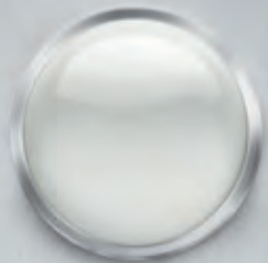
SNOW WHITE A CLEAN SLATE, IN SEARCH OF THE NEXT AMAZING STORY