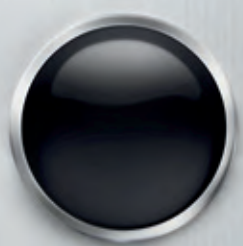
AURORA BLACK NIGHT, MYSTERY, A SPIRIT OF FEARLESS ADVENTURE