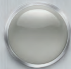
CERAMIC SILVER THE GLINT OF CUTLERY CHIMING A GLASS BEFORE A TOAST