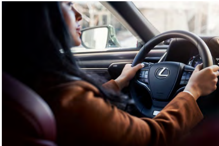
ES Hybrid shown with Apple CarPlay integration, Palomino semi-aniline leather and Open-Pore Brown Walnut interior trim

Featuring Lexus Interface 6 and innovations including wireless Apple CarPlay ®7 integration and an available Mark Levinson ®4 PurePlay audio system, the ES helps keep you connected.