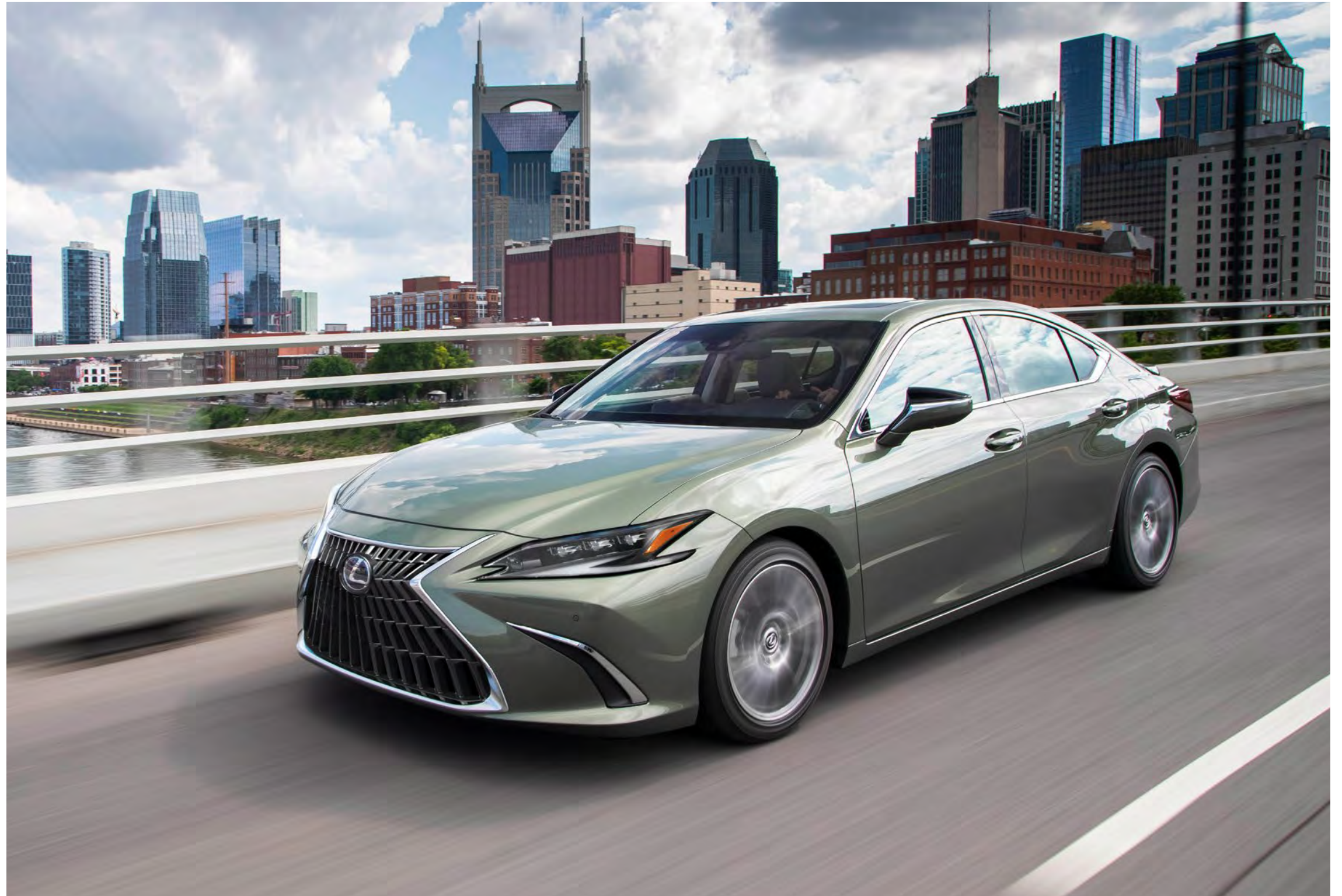
ES Hybrid shown in Sunlit Green

Combining next-generation hybrid technology and a highly potent 2.5-liter engine, this is the best of everything the ES has to offer. Its battery is not only remarkably small and lightweight but also strategically placed as close to the middle of the vehicle as possible for optimized front/rear weight distribution and a lower center of gravity. And with paddle shifters that deliver driving dynamics similar to the ES 250 AWD and ES 350, the ES Hybrid and ES Hybrid F SPORT models bring you even more of the amazing performance you've come to expect. Pairing powerful performance with a manufacturer-estimated 44 MPG combined, 2 it isn't just the most fuel-efficient Lexus sedan—it's the most fuel-efficient among all non-plug-in luxury sedans, 1 period.