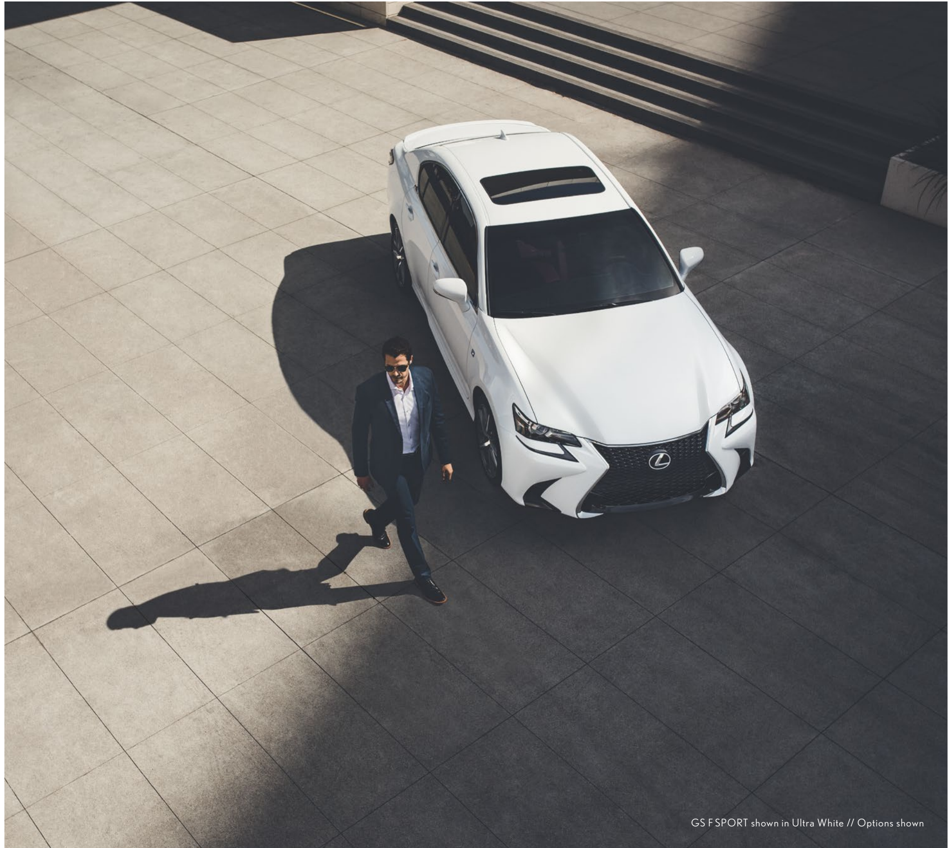
GS F SPORT shown in Ultra White // Options shown