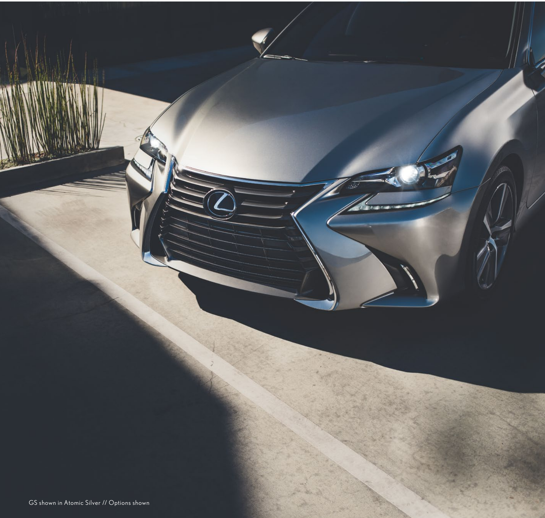
GS shown in Atomic Silver // Options shown