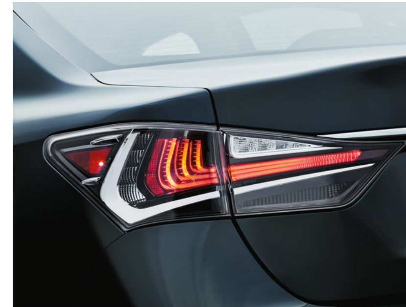
GS shown in Matador Red Mica

— Muscular styling makes an aggressive statement. With an exclamation point.