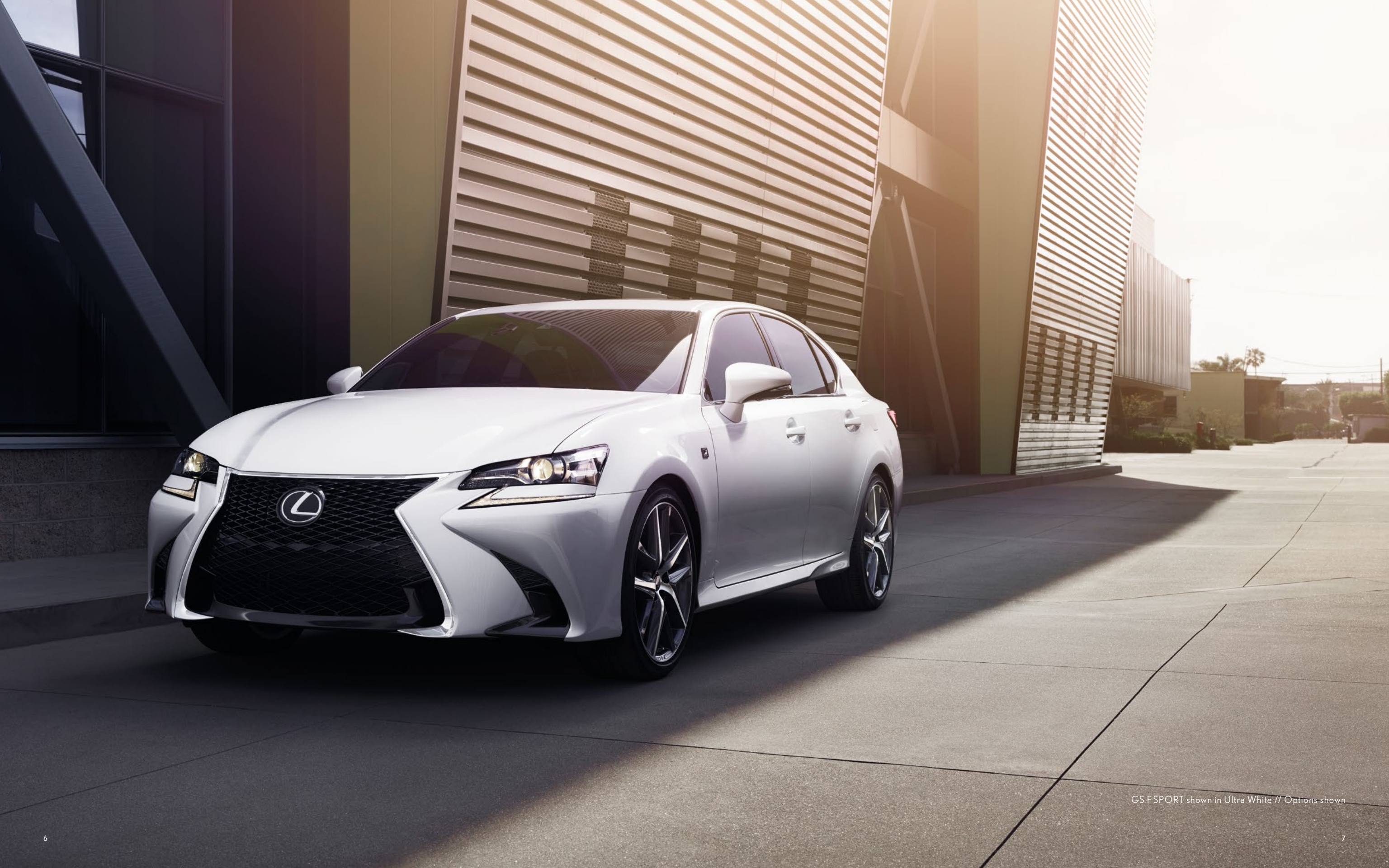
GS F SPORT shown in Ultra White // Options shown