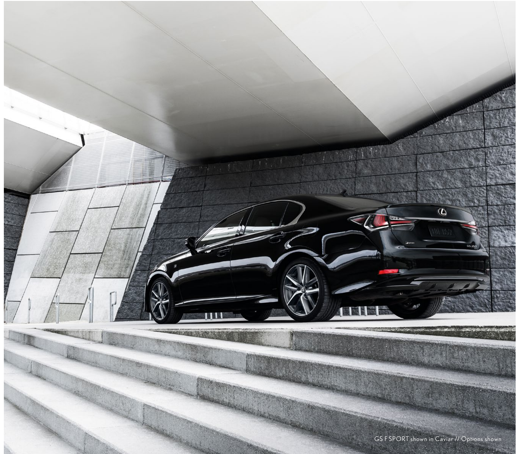
GS F SPORT shown in Caviar // Options shown

F SPORT split-nine-spoke forged alloy wheels 3,36 AVAILABLE GS F SPORT