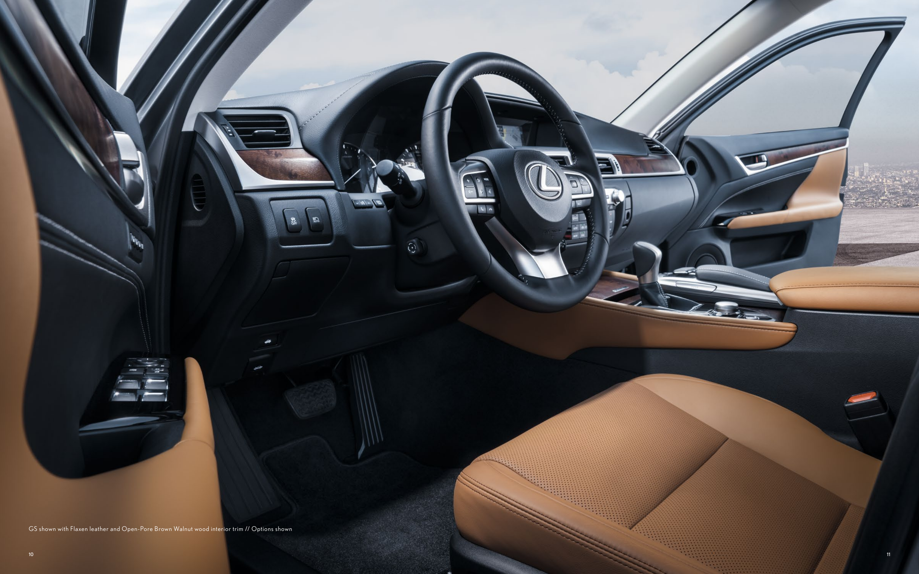
GS shown with Flaxen leather and Open-Pore Brown Walnut wood interior trim // Options shown