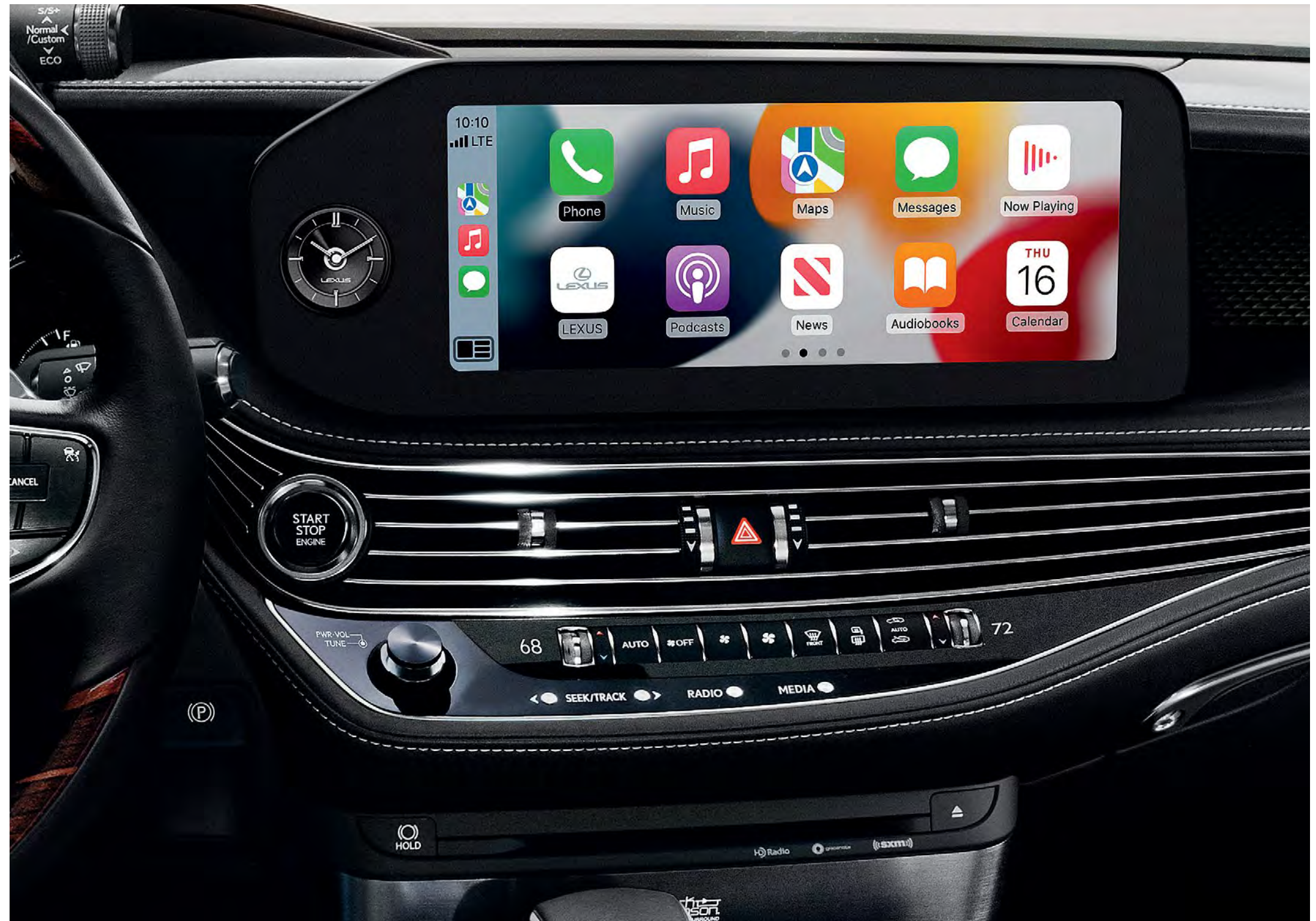
LS shown with Apple CarPlay integration and Black leather and Artwood Organic Gloss interior trim

To help you get the most out of these and other features in your new Lexus, a Vehicle Delivery Specialist will walk you through nearly every setting and function you desire. And to answer questions that arise after delivery, a Vehicle Technology Specialist can offer expert guidance in person or without you ever leaving the driveway via camera-enabled apps like FaceTime. ® Learn more about these complimentary services at lexus.com/specialists .