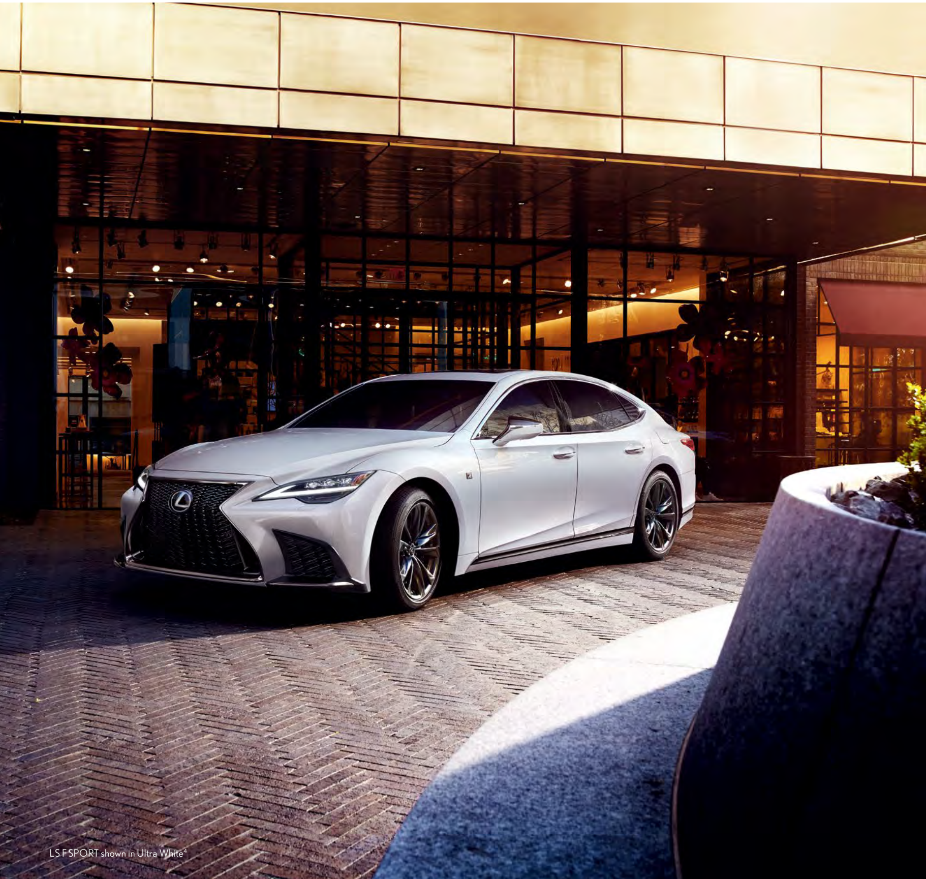
LS F SPORT shown in Ultra White 4