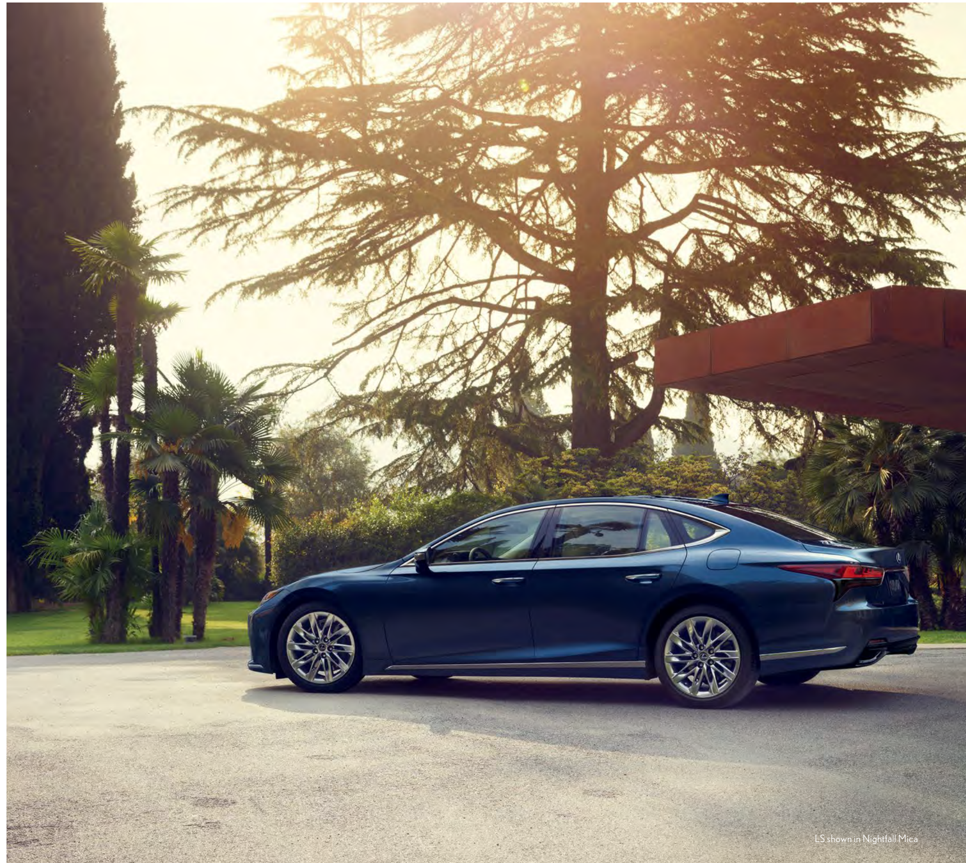
LS shown in Nightfall Mica

Split-five-spoke alloy wheels with Dark Vapor Chrome finish STANDARD LSFSPORT