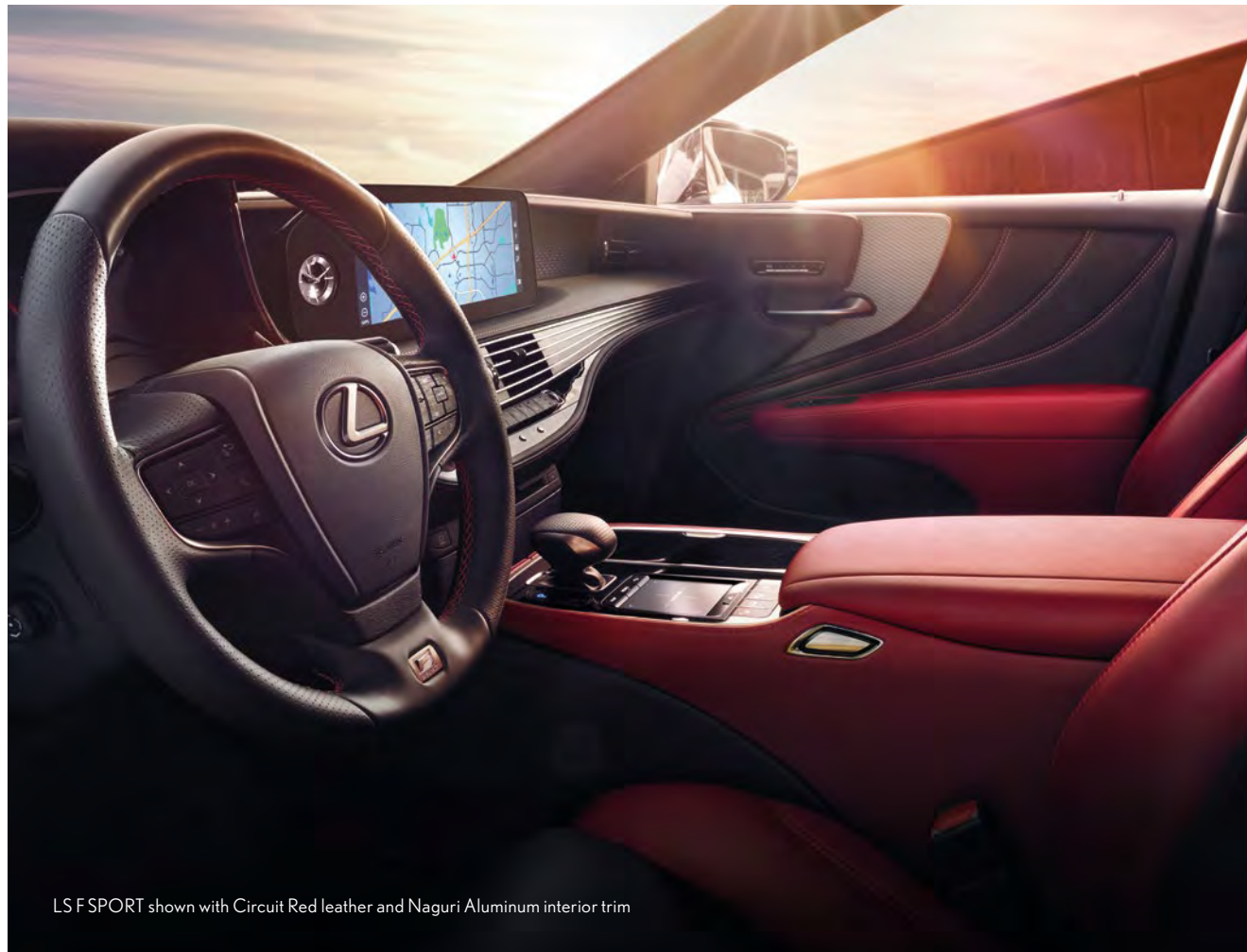
LSF SPORT shown with Circuit Red leather and Naguri Aluminum interior trim