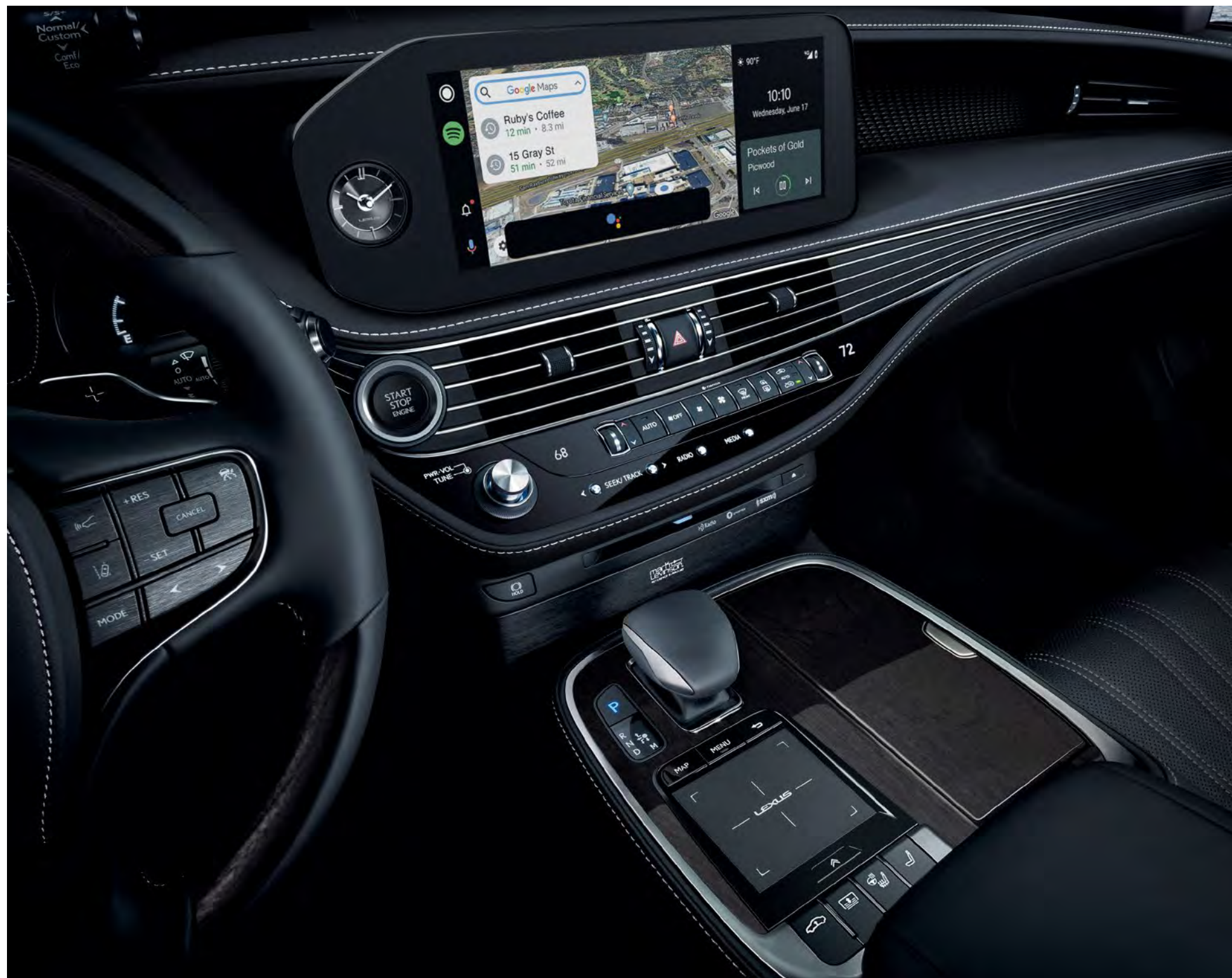
LS shown with Black leather, Gray Sapele wood, and Kiriko Glass interior trim