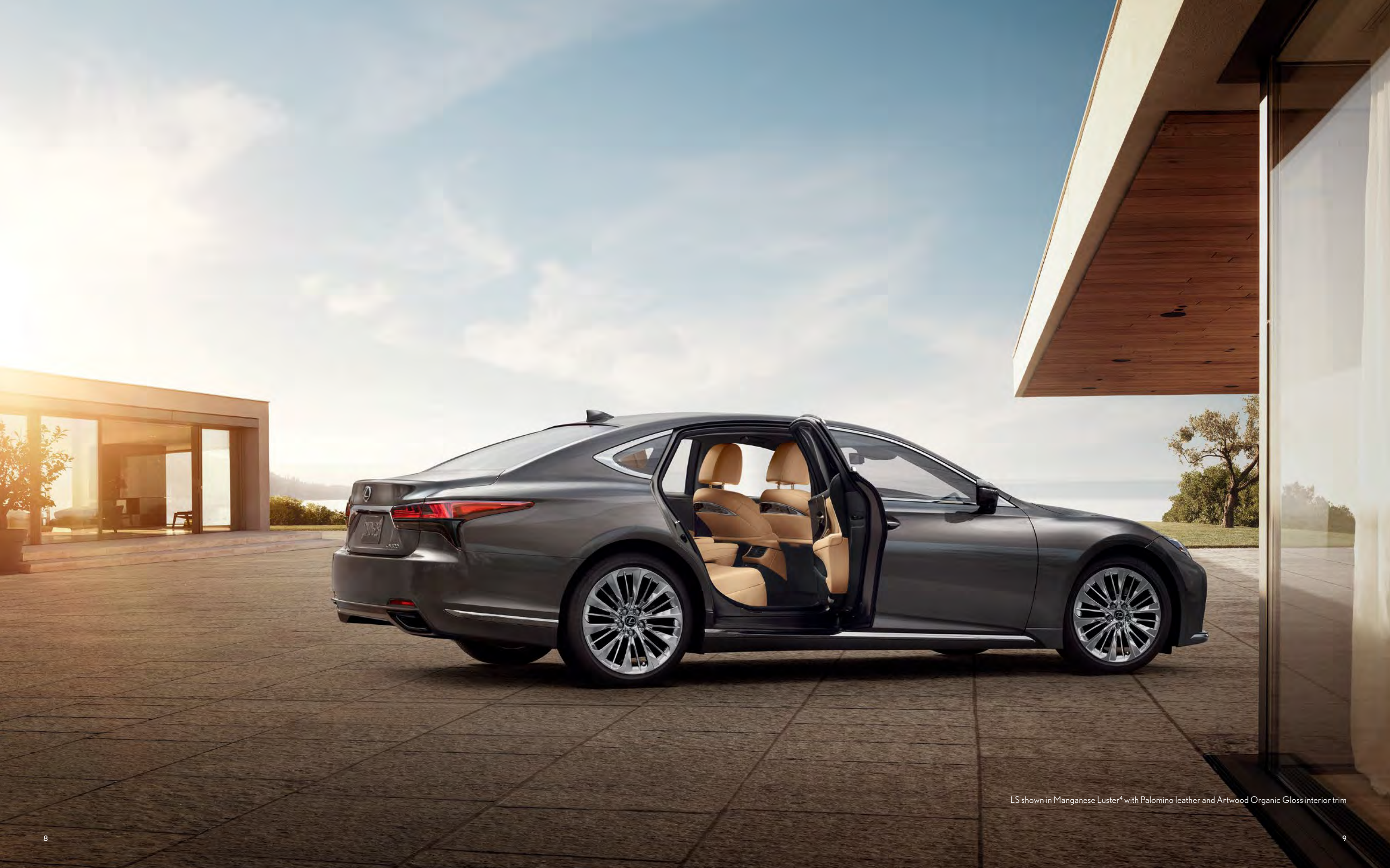
LS shown in Manganese Luster* with Palomino leather and Artwood Organic Gloss interior trim