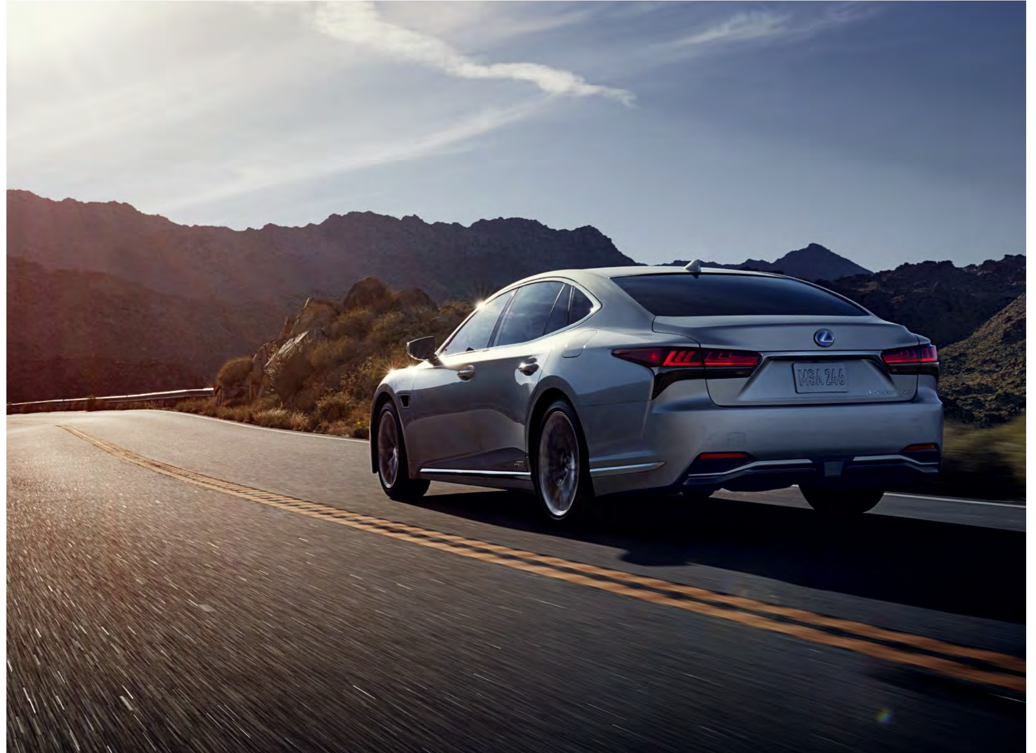
LSh shown in Atomic Silver

The LS 500h AWD is the first multistage hybrid prestige luxury sedan, and, with the instinctive feel of a 10-speed automatic transmission, the most responsive and fastest LS Hybrid we've ever created. Built on an advanced powertrain, it boasts a combined 354-hp 1 24-valve gas engine, powerful yet compact electric motors, and our lightest, most compact lithium-ion battery. With these impressive performance metrics, all-wheel drive capability, and new next-generation driver-assistance technology, the LS 500h AWD with Lexus Teammate 2,3 is the breakthrough that recasts the entire concept of excellence in the category.