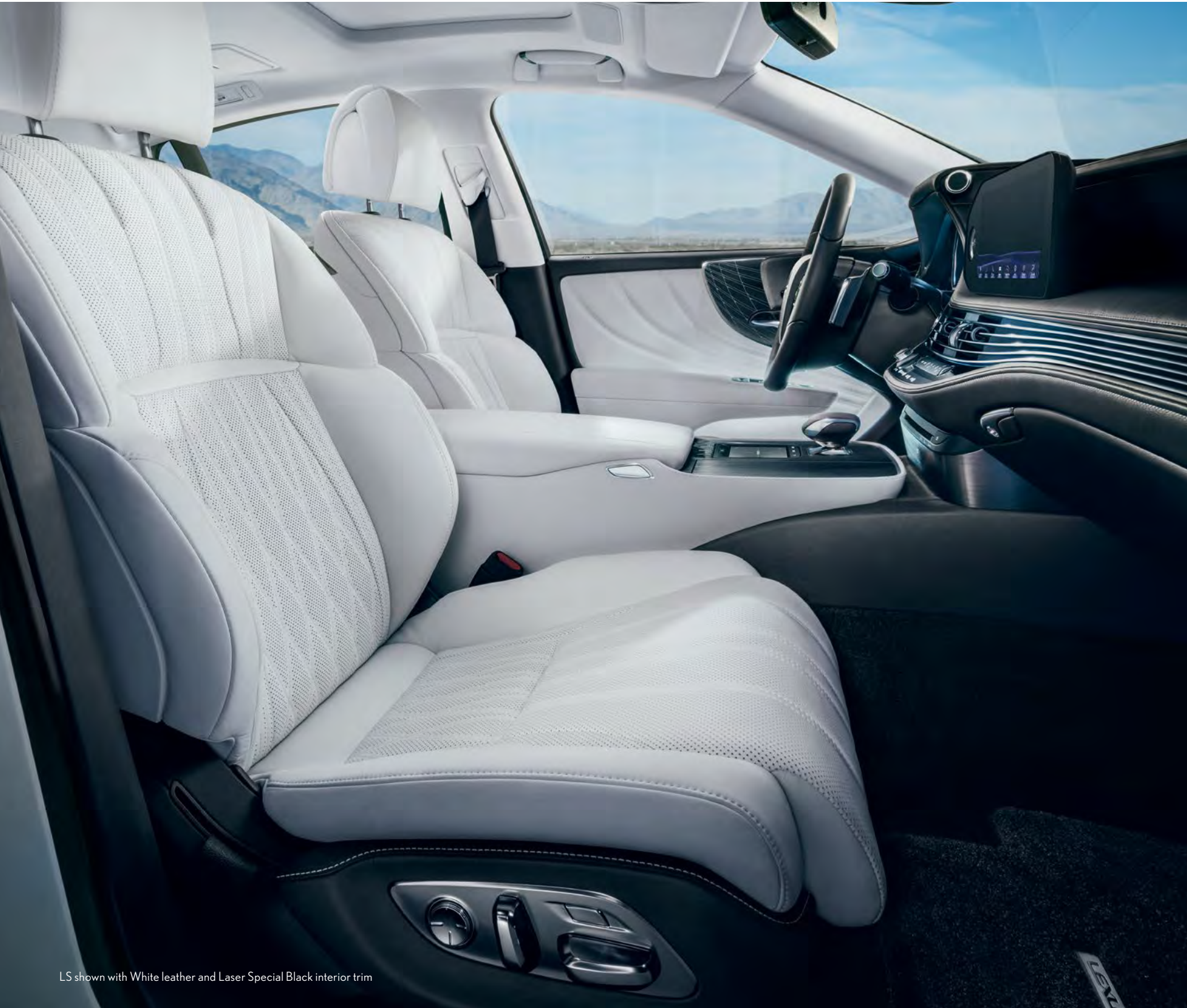
LS shown with White leather and Laser Special Black interior trim