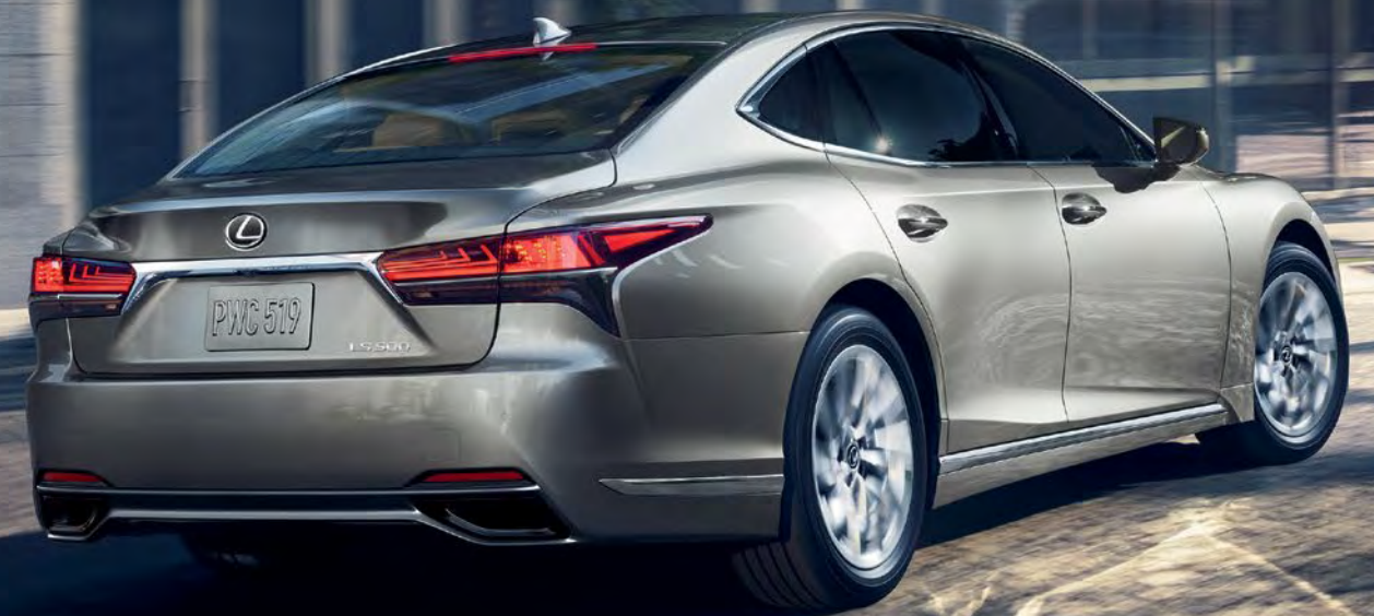
LS shown in Atomic Silver

Honed on one of the most complex highway systems in the world, the Tokyo Metropolitan Expressway, Lexus Safety System+ A 25 is the most advanced safety system available on a Lexus. It features Intersection Support 6 to help you detect a pedestrian or vehicle when you're making a right or left turn. And includes innovative lane assistance technologies, 21,22 as well as a way for the LS to scan the road ahead and alert you if a pedestrian is on a trajectory to make an impact with the vehicle. 5 This highly intelligent system helps you manage your speed around curves to handle turns with added confidence. It can also help brake or steer away if it detects an impending collision, 26 while still remaining in its lane. And with Lane Change Assist, 27 the LS is even designed to help automatically change lanes for you when it's safe to do so. For added visibility, it offers an expansive 24-inch Head-Up Display that not only projects key information such as speed, current gear and rpm onto the windshield, it's also one of the first displays to warn you about the possibility of pedestrians 5 or cross traffic ahead. 6 This leading-edge technology brings us one step closer to realizing our vision of an accident-free world.