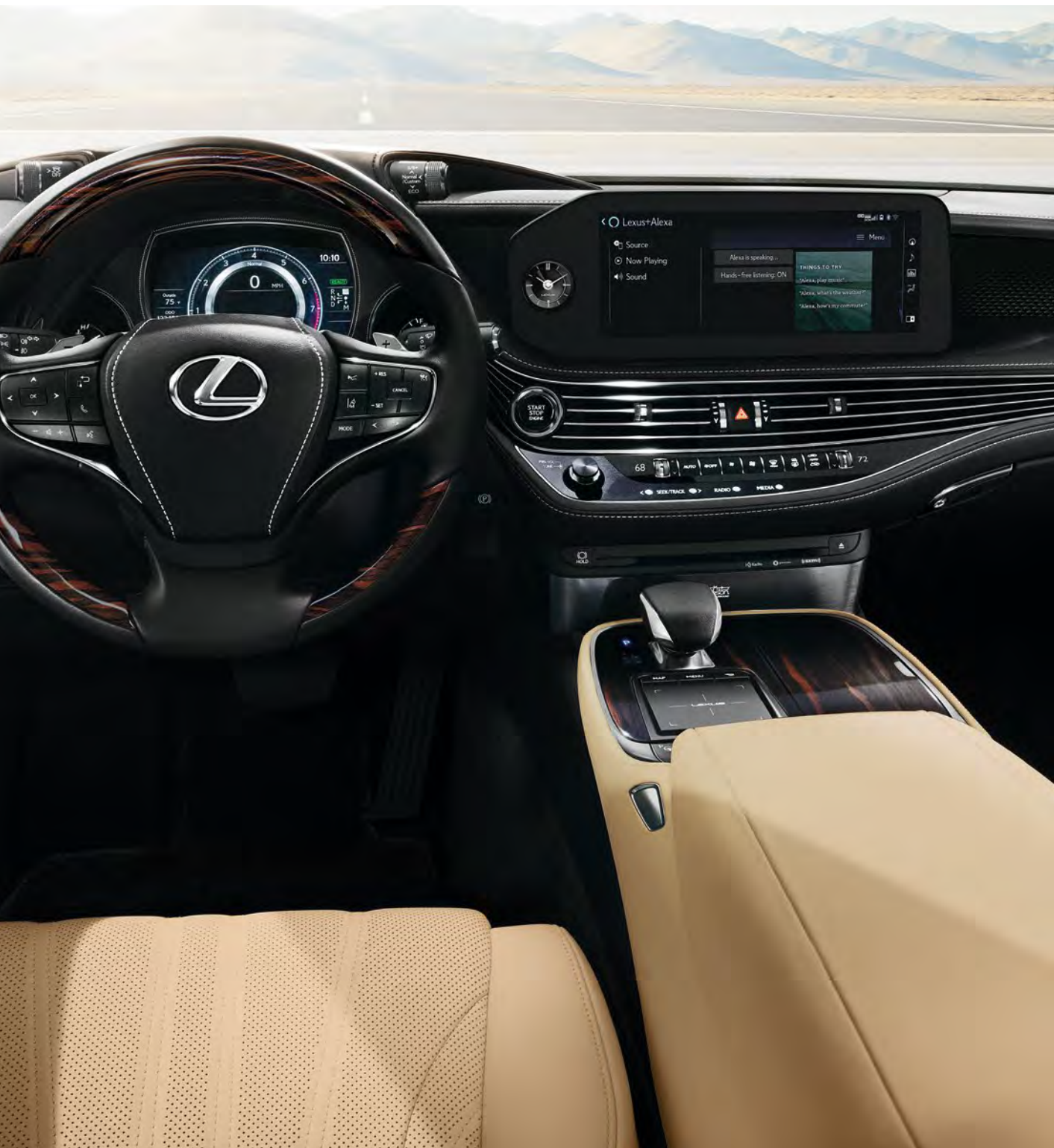
LS shown with Palomino leather and Artwood Organic Gloss interior trim