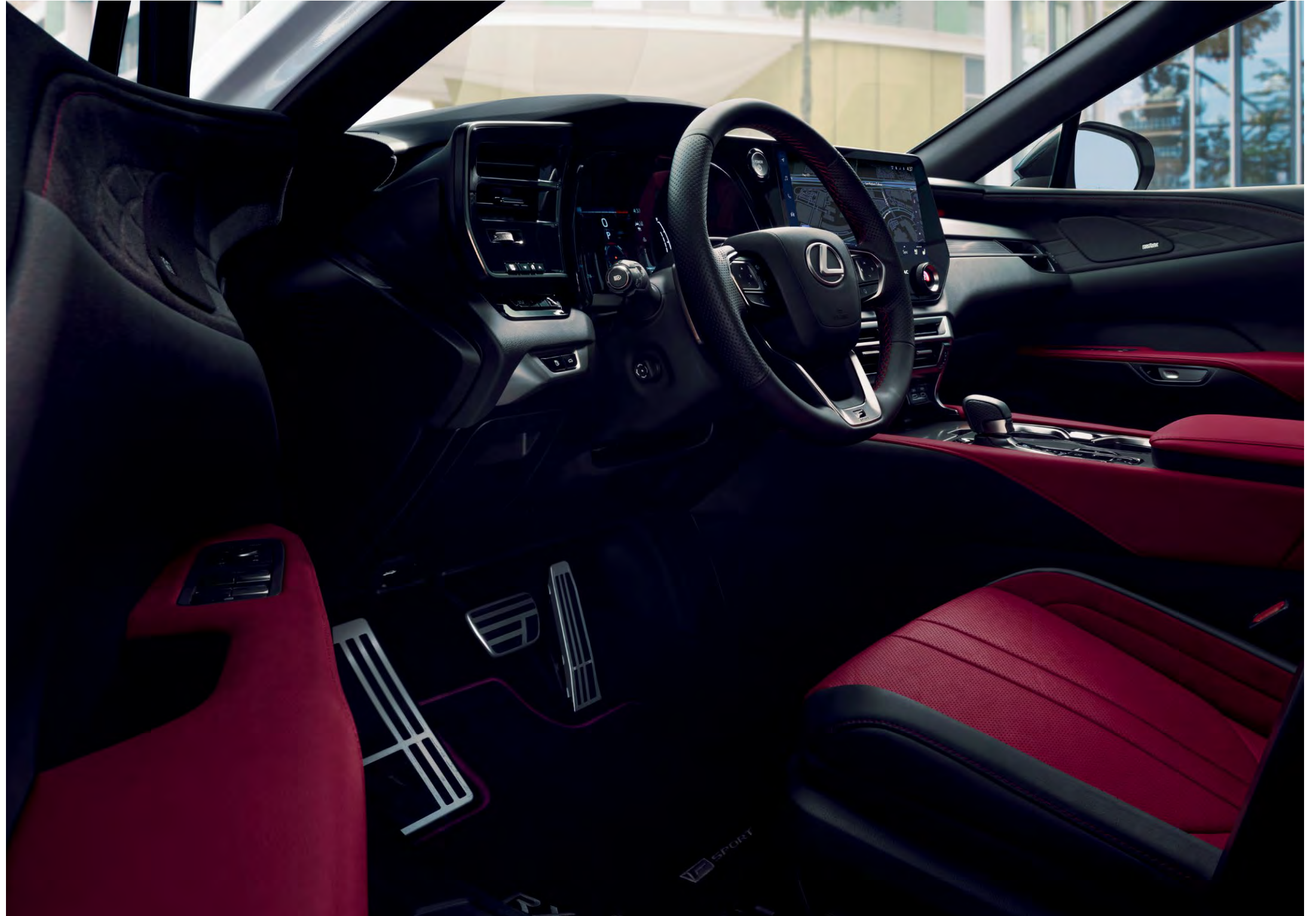
RX F SPORT Performance shown with Rioja Red leather and Dark Graphite Aluminum interior trim

Leave distractions behind. When crafting the interior of the RX, Lexus designers focused on creating a space that was open and inviting, with ready access to the things a driver needs most. Front seats offer an ideal blend of comfort and support, and for the driver, an ergonomically shaped steering wheel and intuitive controls fall easily to hand. Seating position and even the angle of the windshield have been optimized to enhance outward visibility. And an elegantly concealed console storage area and available wireless phone-charging tray 9 help provide easy access to all those important day-to-day items.