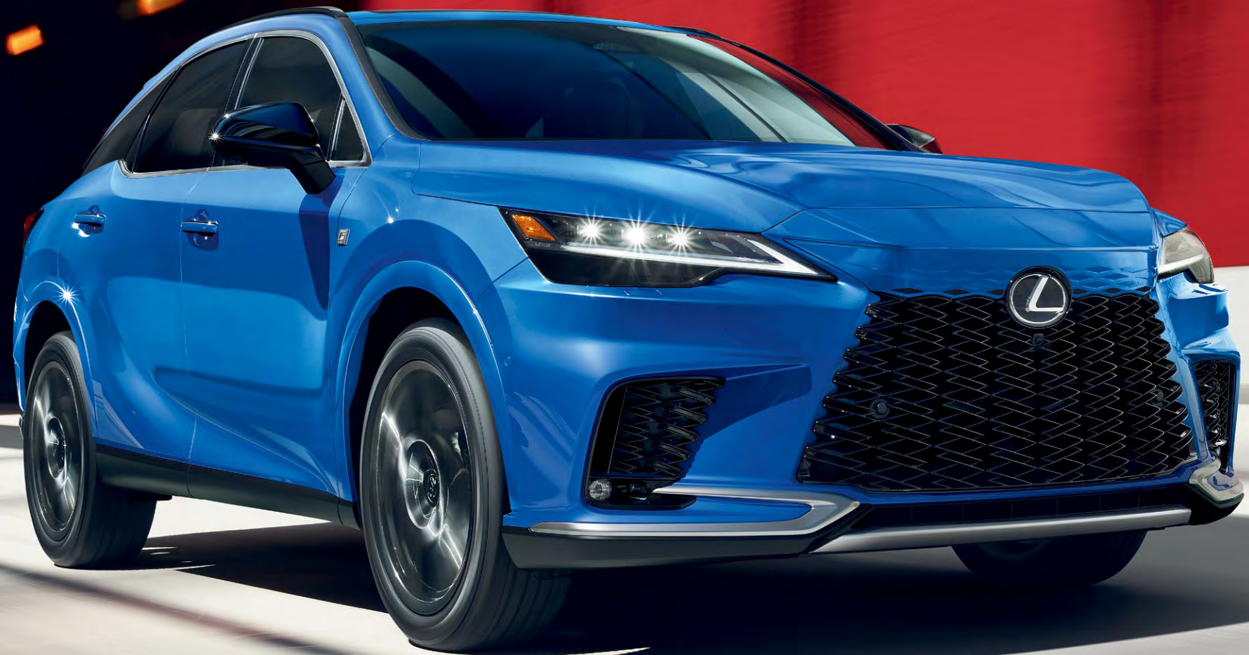
RX F SPORT Handling shown in Grecian Water