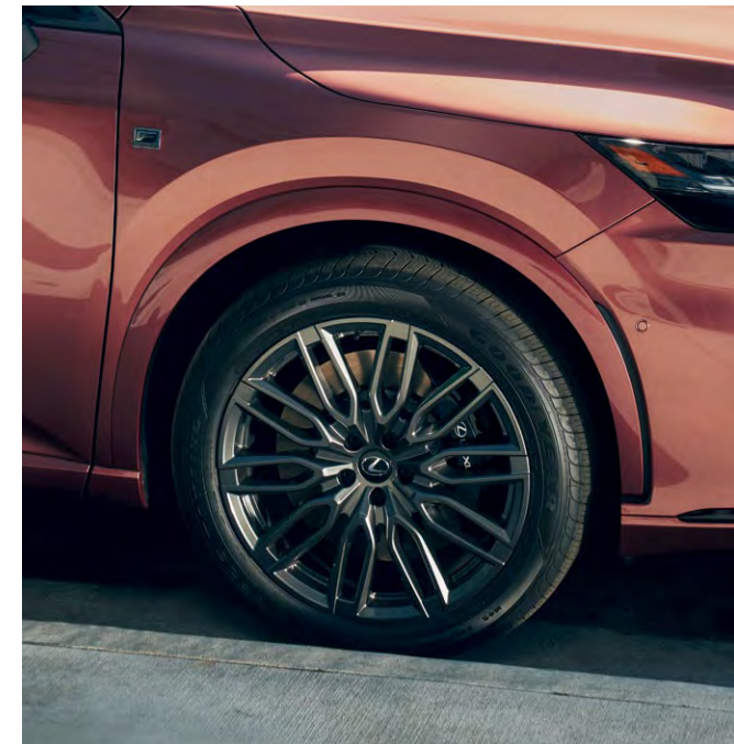
RX F SPORT Performance shown in Copper Crest®

For those who refuse to settle, this is the next generation of Lexus.