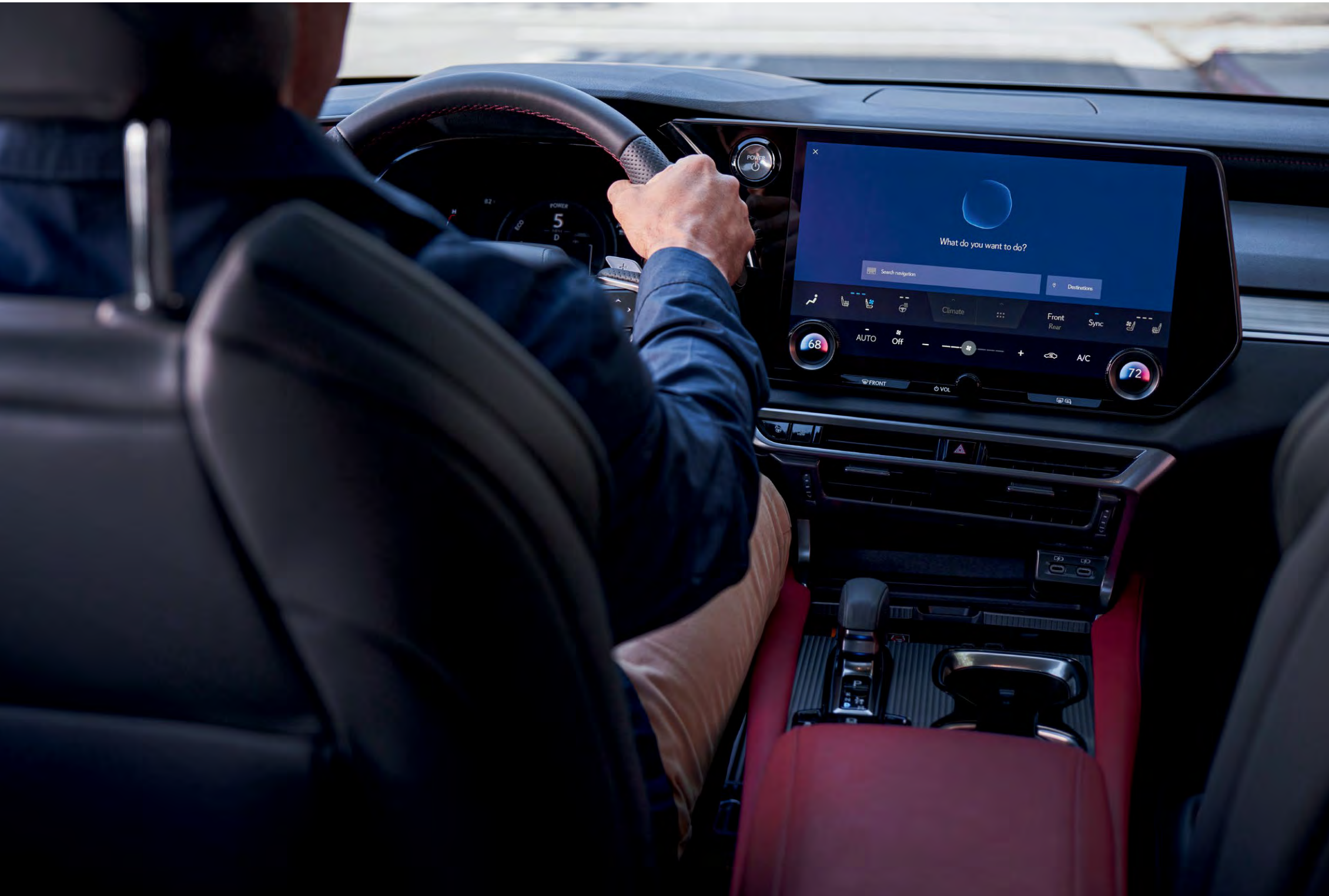
RX F SPORT Performance shown with 14-inch touchscreen display and Rioja Red leather and Dark Graphite Aluminum interior trim