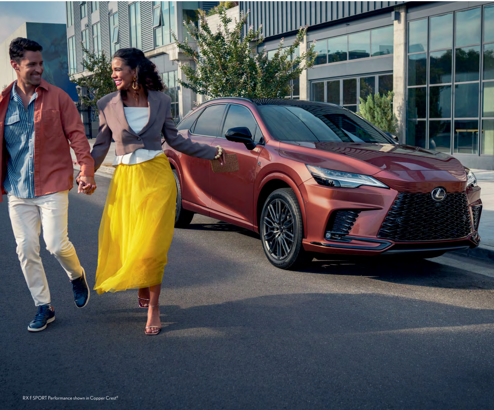
RX F SPORT Performance shown in Copper Crest®