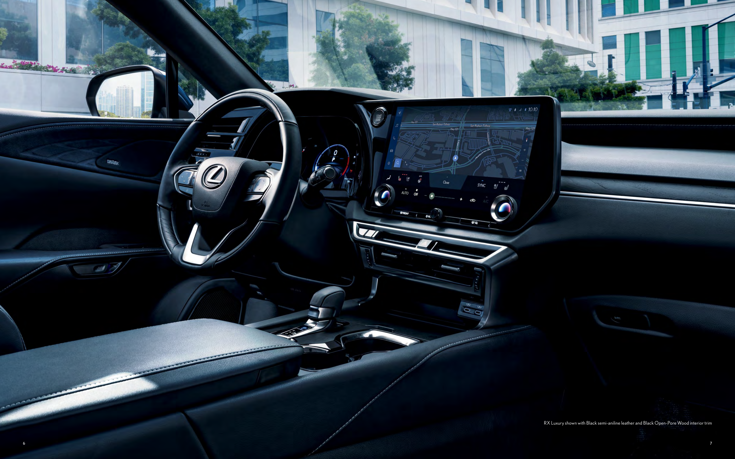
RX Luxury shown with Black semi-aniline leather and Black Open-Pore Wood interior trim