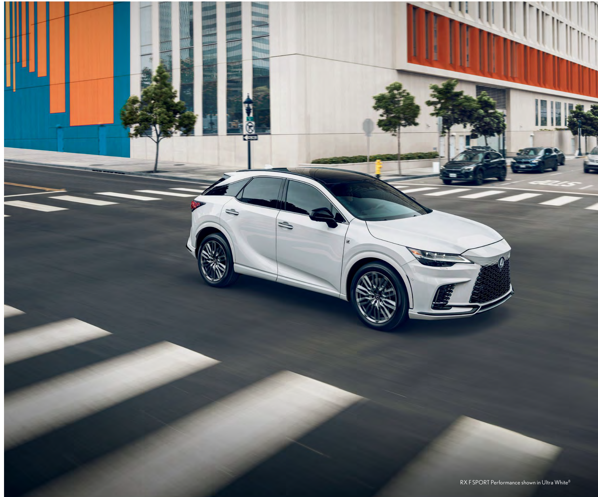
RX F SPORT Performance shown in Ultra White ®