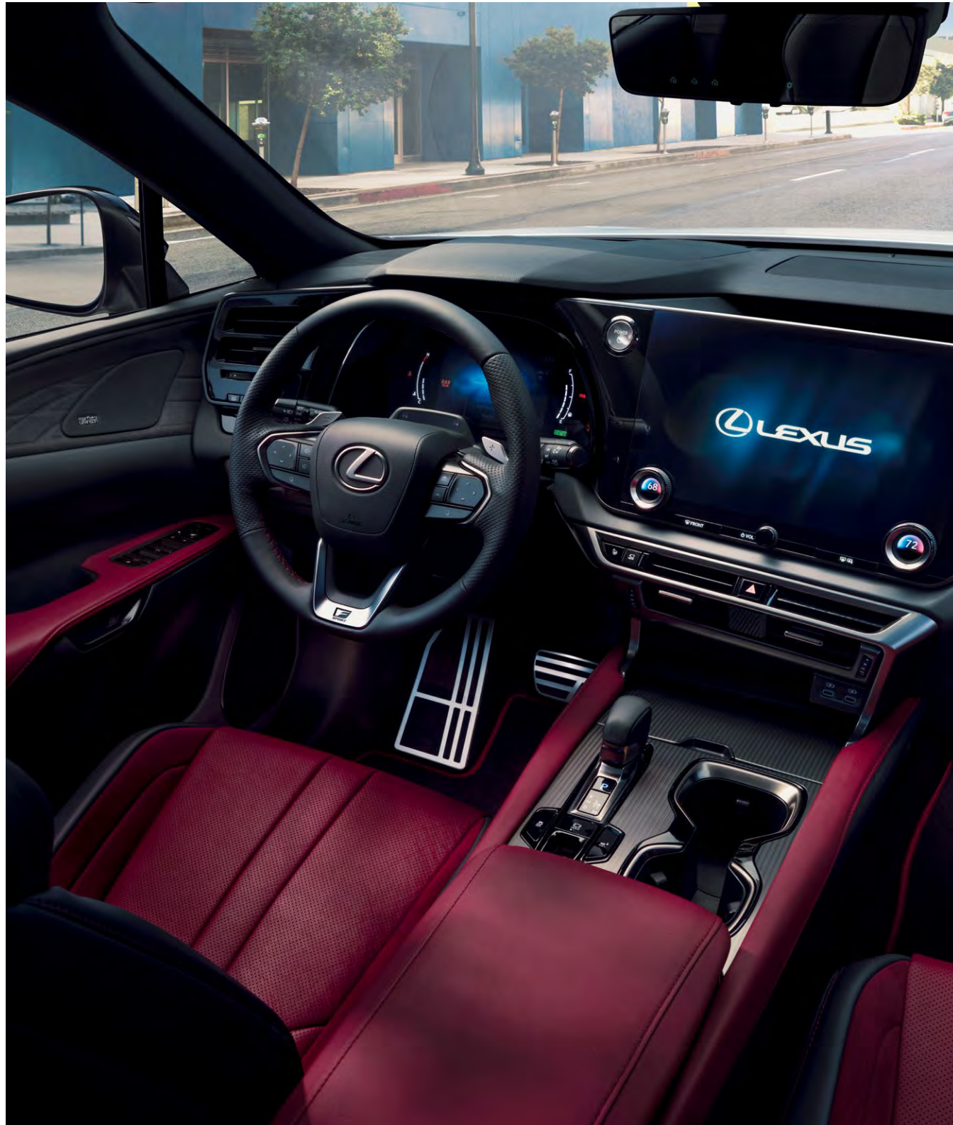
RX F SPORT Performance shown with Rioja Red leather and Dark Graphite Aluminum interior trim