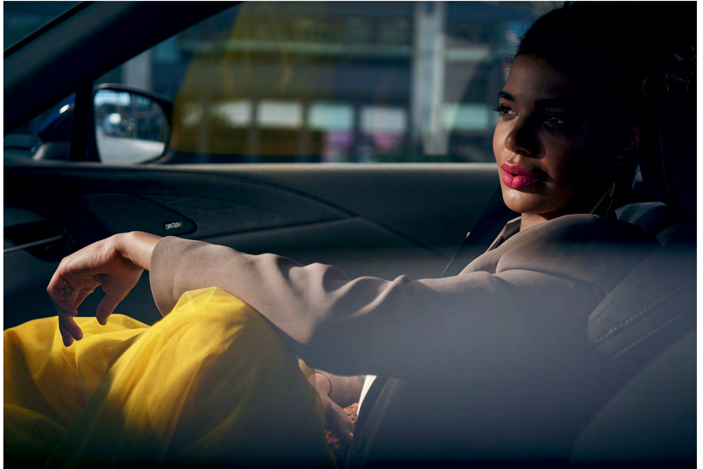
RX Luxury shown with Black semi-aniline leather and Black Open-Pore Wood interior trim