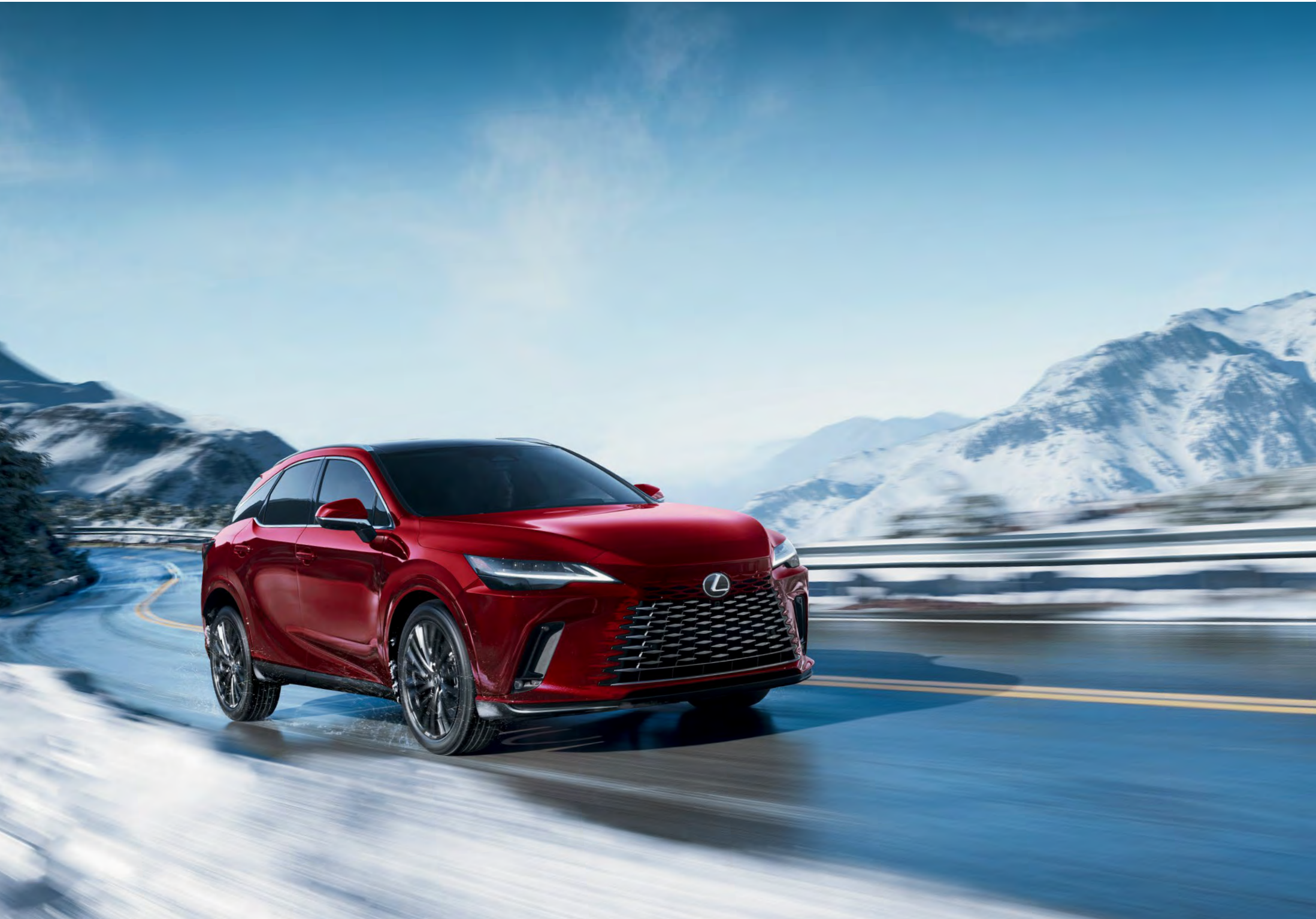
RX Luxury AWD shown in Matador Red Mica