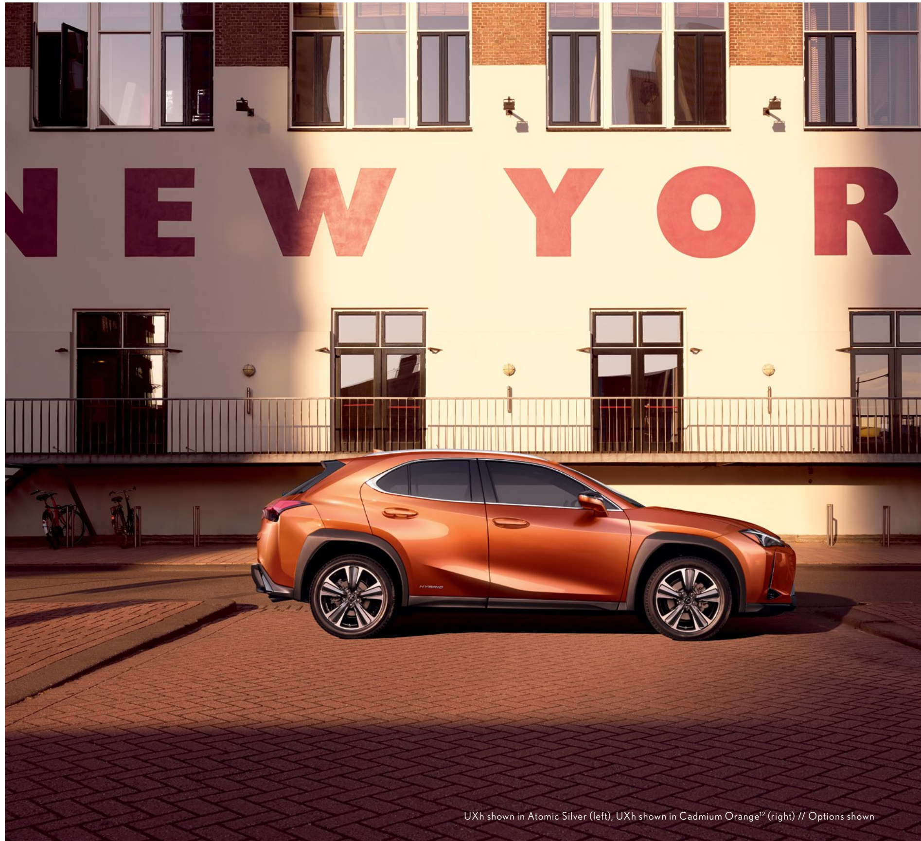
UXh shown in Atomic Silver (left), UXh shown in Cadmium Orange 12 (right) // Options shown