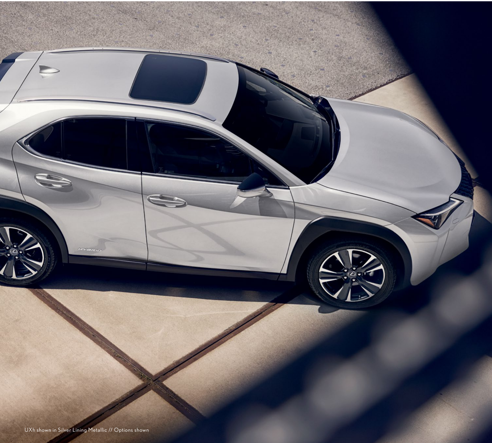
UXh shown in Silver Lining Metallic // Options shown