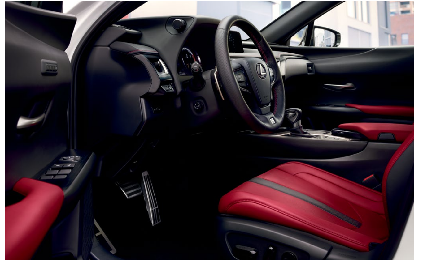
UX F SPORT shown with Circuit Red NuLuxe ®13 interior trim // Options shown