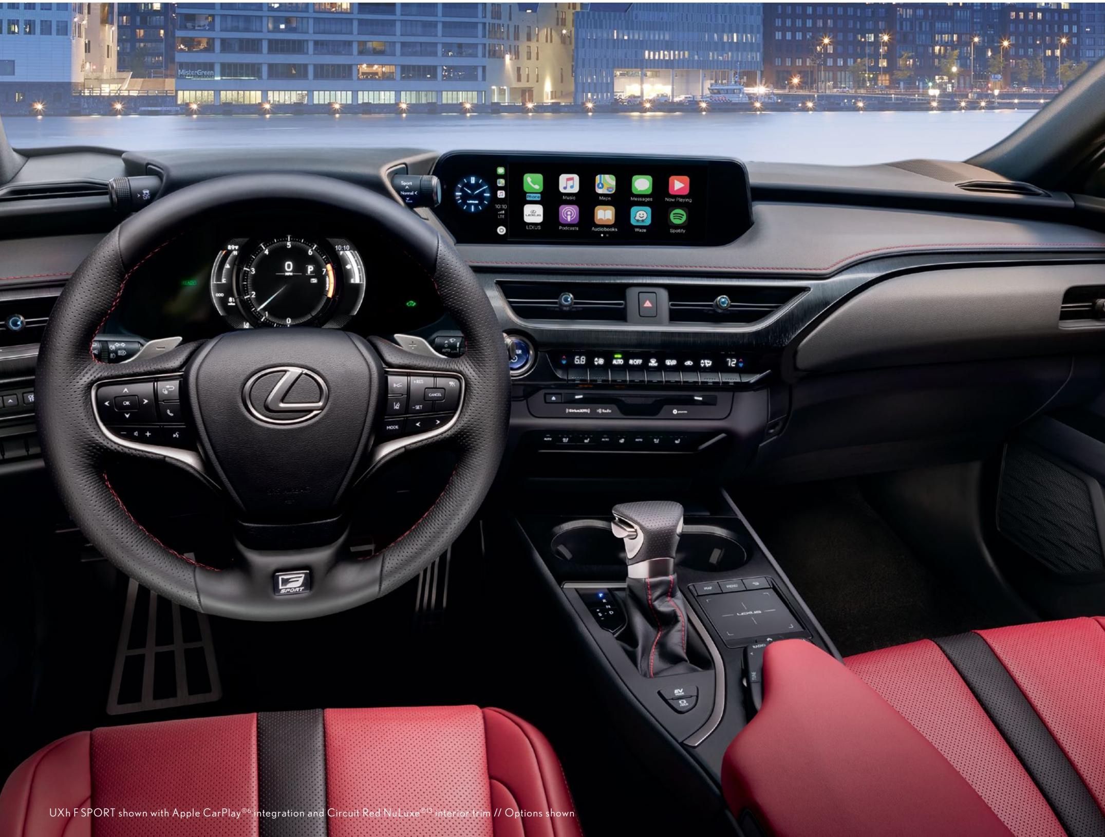
UXh F SPORT shown with Apple CarPlay ®6 integration and Circuit Red NuLuxe ®13 interior trim // Options shown