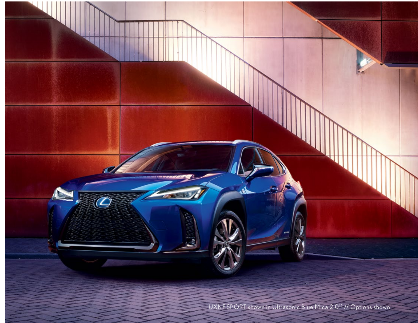
UX F SPORT shown in Ultrasonic Blue Mica 2.0 12 // Options shown

The all-new UX 200 boasts a dynamic 2.0-liter four-cylinder engine with a new 10-speed Direct-Shift Continuously Variable Transmission. This first-of-its-kind technology 2 delivers more responsive acceleration, on-demand torque and the feel of a gear-driven transmission—all while maximizing fuel efficiency.