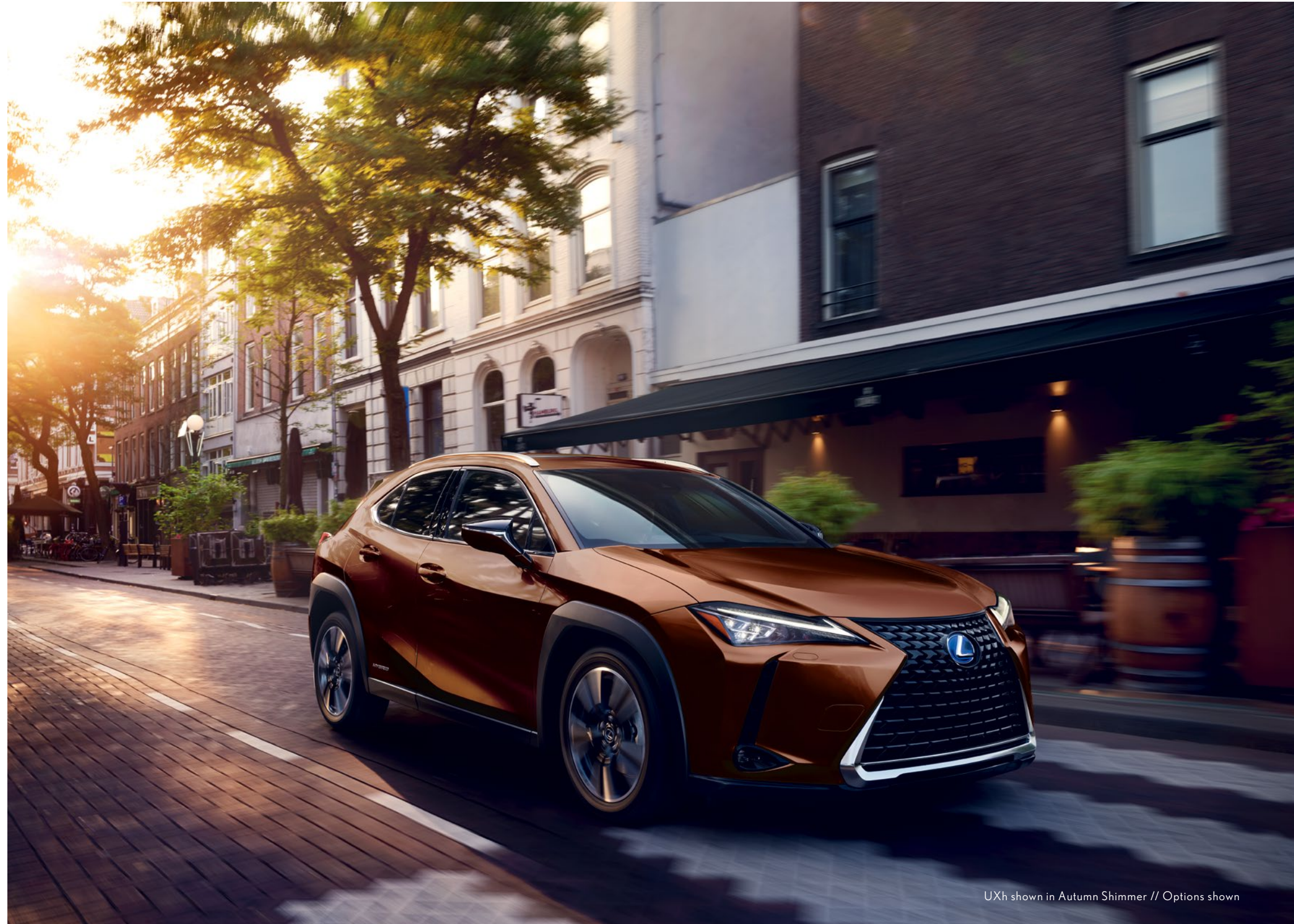
UXh shown in Autumn Shimmer // Options shown

can send up to 80% of the power to the rear wheels