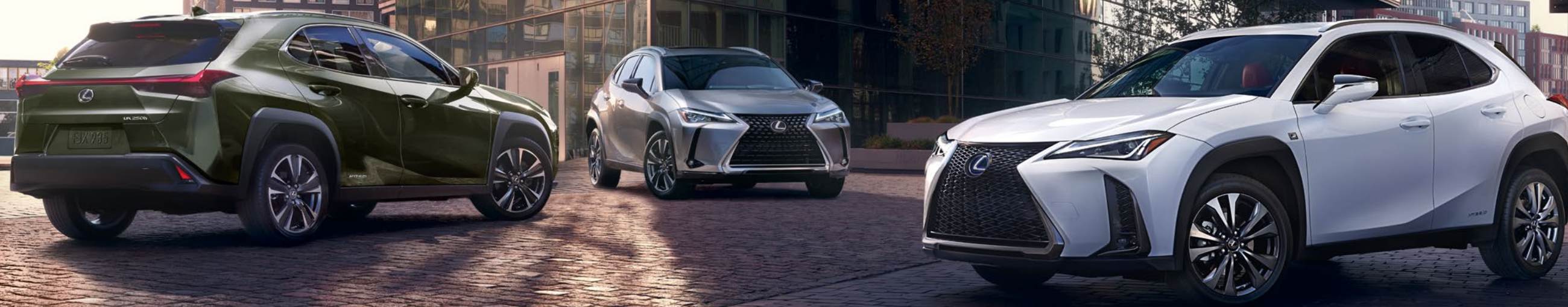
UXh shown in Nori Green Pearl (left), UX shown in Atomic Silver (middle), UXh F SPORT shown in Ultra White (right) // Options shown