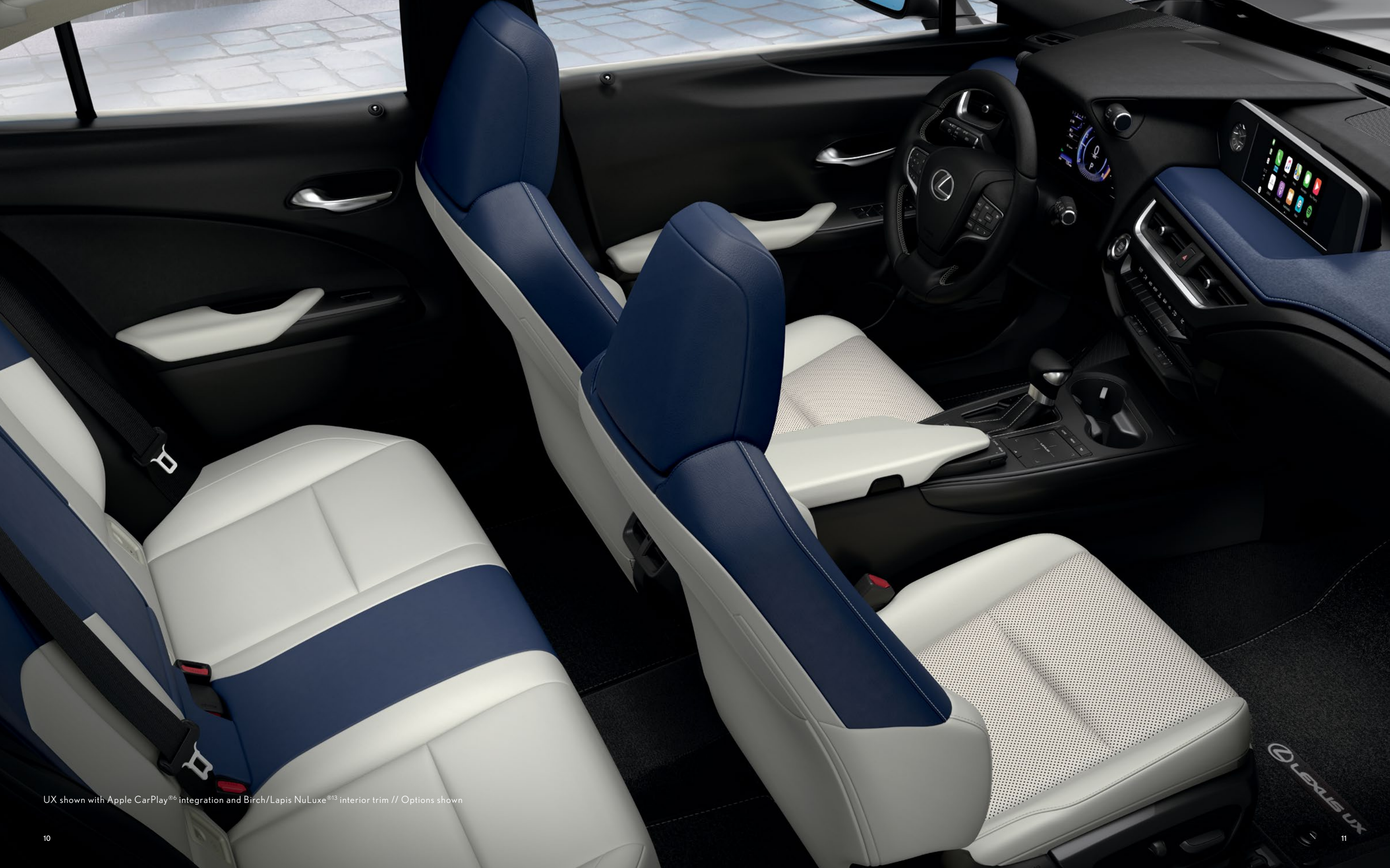
UX shown with Apple CarPlay ® integration and Birch/Lapis NuLuxe ® interior trim // Options shown