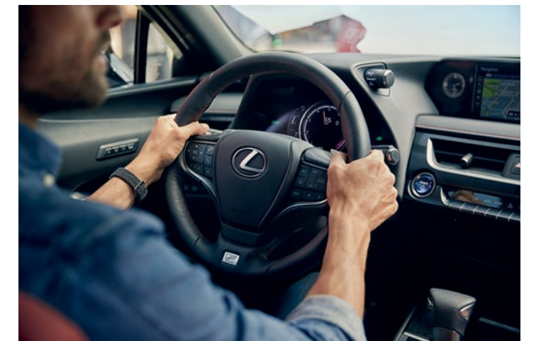
UXh F SPORT shown in Ultra White // Options shown