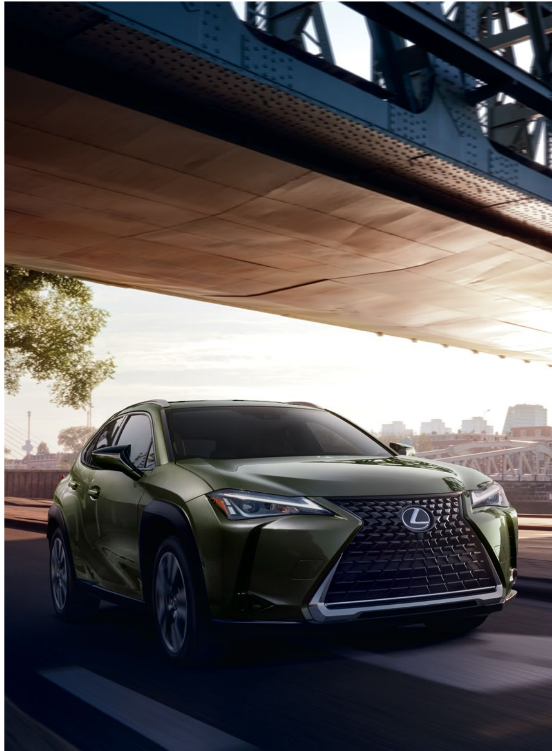
UX shown in Nori Green Pearl // Options shown

From the versatile UX 250h to the nimble F SPORT models, the UX offers numerous ways to get the most out of every mile.