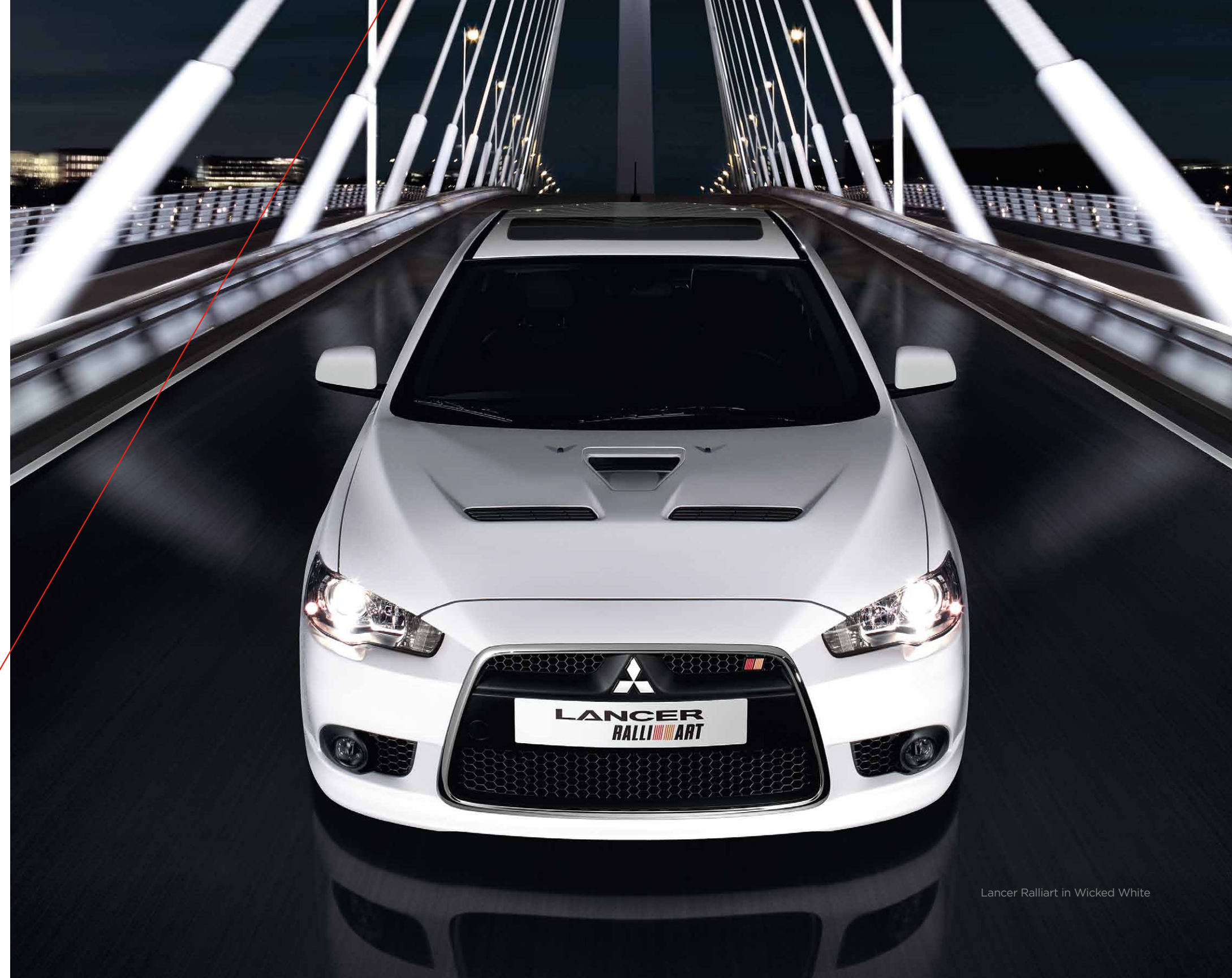
Lancer Ralliart in Wicked White

Taking action on traction. Combining an electronically-controlled 4WD system with our Active Stability and Traction Control system, All-Wheel Control regulates drive torque from front-to-rear with a network of dynamic handling technologies. The result: Enhanced driving performance and traction under a variety of road conditions.