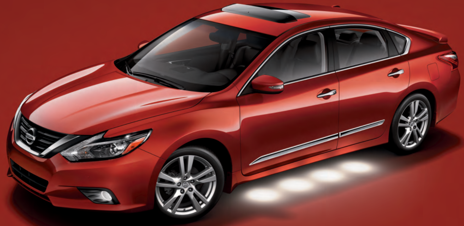
Nissan Altima® 3.5 SL shown in Cayenne Red with LED Fog Lights Upgrade Kit, Moonroof Wind Deflector, Splash Guards, Chrome Body Side Moldings, External Ground Lighting, and Rear Decklid Spoiler.

For more information and to shop online for Altima® Genuine Nissan Accessories, go to bit.ly/16altima-estore