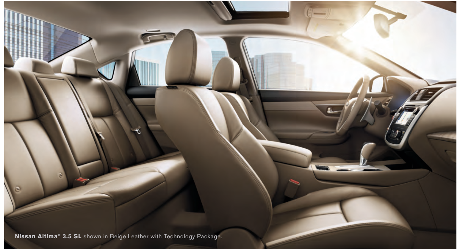
Nissan Altima® 3.5 SL shown in Beige Leather with Technology Package.