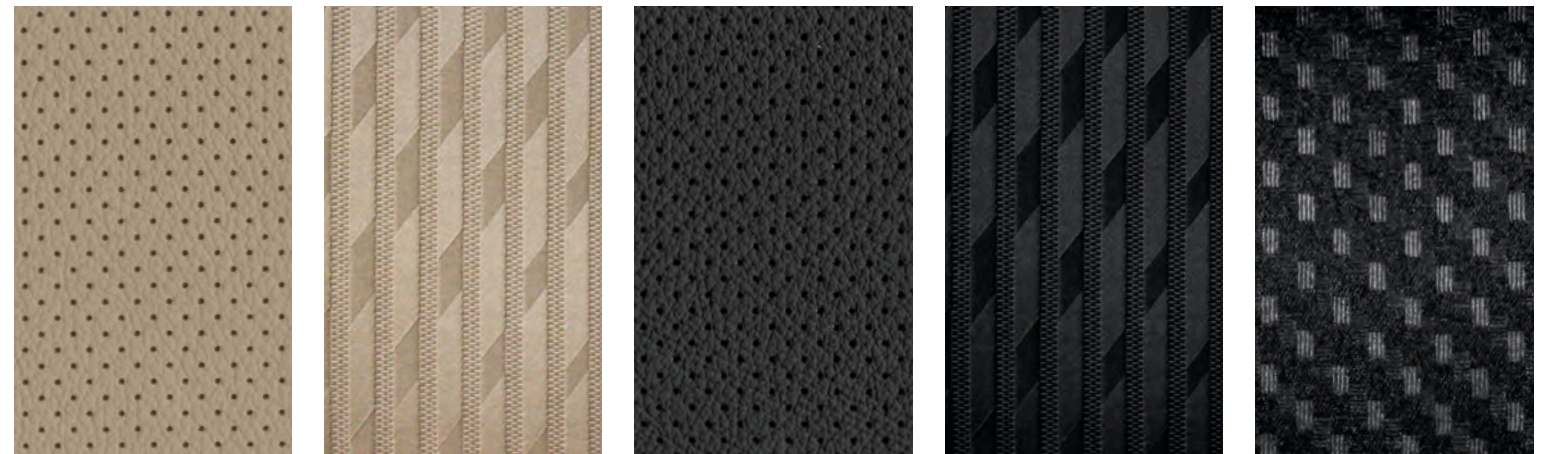
Beige Leather 2.5 SL | 3.5 SL Beige Cloth 2.5 | 2.5 S | 2.5 SV Charcoal Leather 2.5 SL | 3.5 SL Charcoal Cloth 2.5 | 2.5 S | 2.5 SV Charcoal Sport Cloth 2.5 SR | 3.5 SR