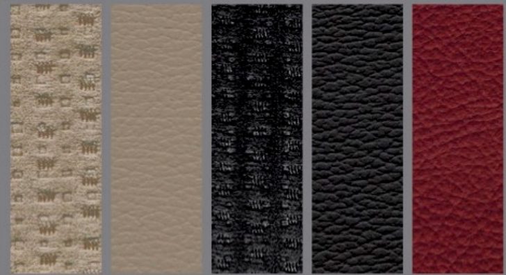
Blond Cloth Blond Leather Charcoal Cloth Charcoal Leather Red Leather