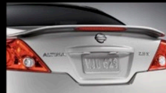
Rear Decklid Spoiler

For more information on the complete line of Genuine Nissan Accessories, go to NissanUSA.com/accessories . Or shop online at the Nissan eStore.