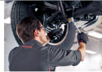
Extended Service Contract 27