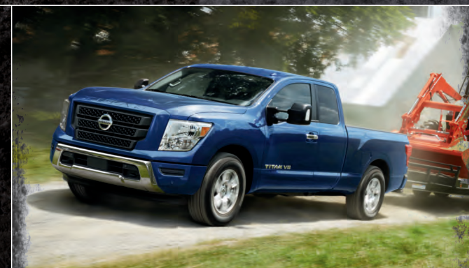
TITAN ® SV King Cab ® 4x4 shown. 11