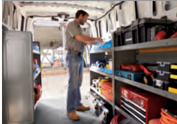
Upfit Packages 4