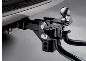
Genuine Nissan Accessories 26