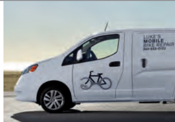
Vehicle Graphics 25