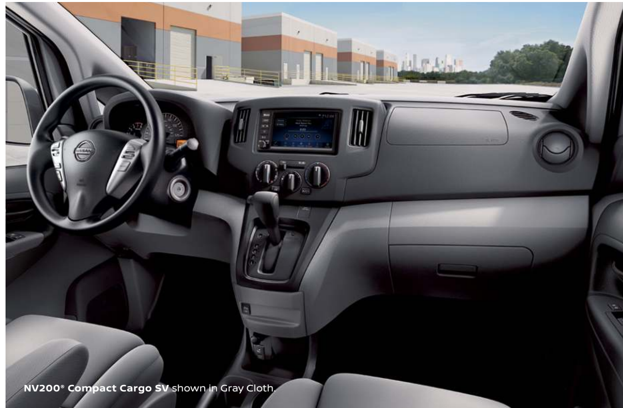
NV200® Compact Cargo SV shown in Gray Cloth.

Nissan has taken care to ensure that the digital color swatches presented here are the closest possible representation of actual vehicle colors. Swatches may vary slightly due to viewing light or screen quality. Please see the actual vehicle and colors at your dealer.