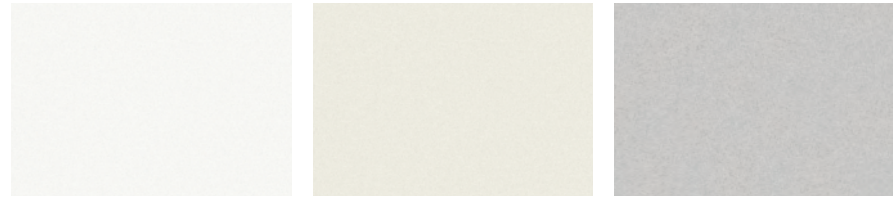
Glacier White QAK