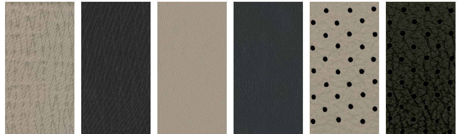
Almond Cloth S|SV