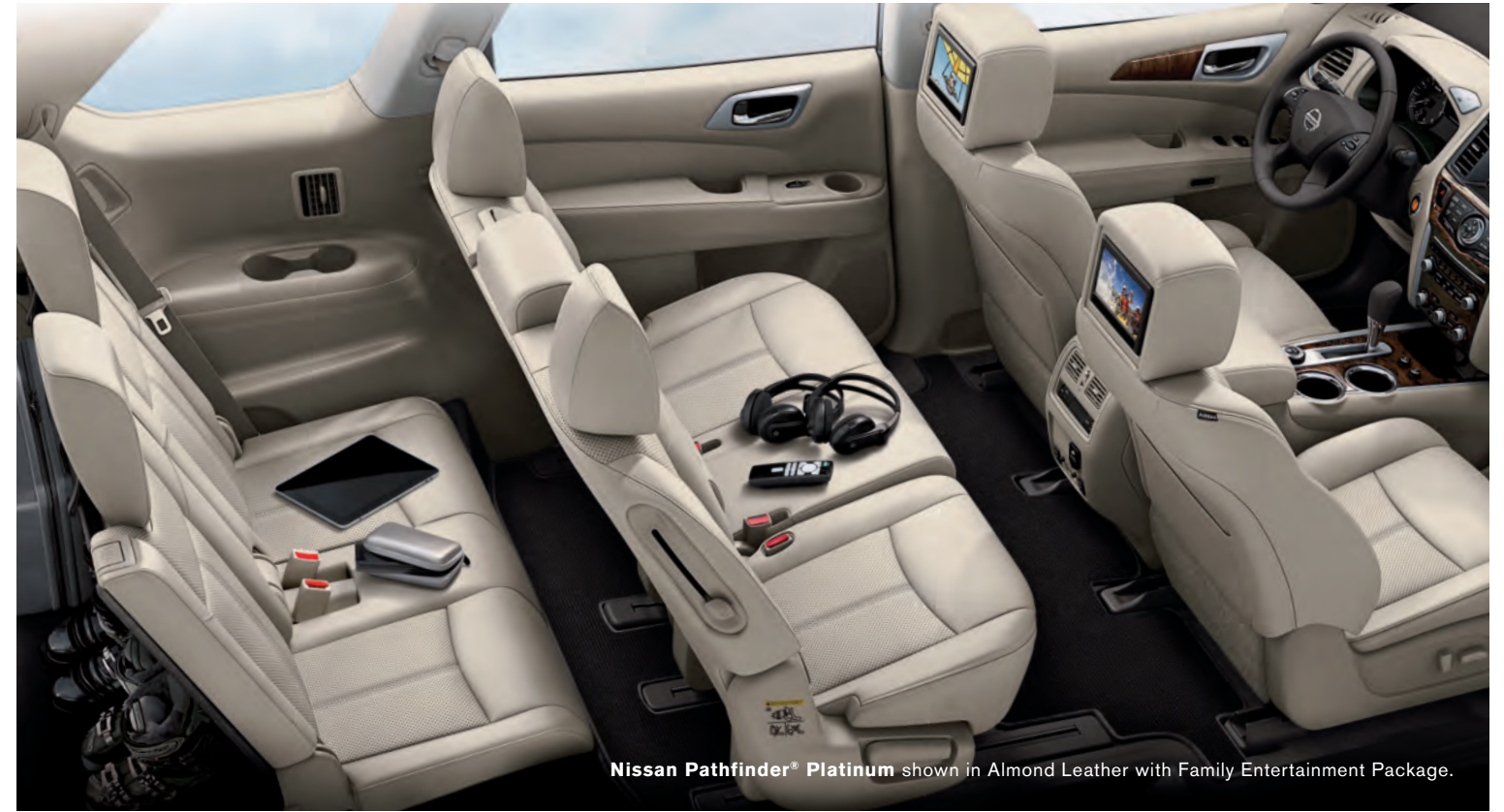
Nissan Pathfinder® Platinum shown in Almond Leather with Family Entertainment Package.