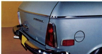
Independently suspended rear wheels keep baggage from bouncing around.

So you can load without a lot of lifting and shoving, the rear door is hinged at the top. A defroster clears the rear window in less than a minute. Plus your baggage has less chance of bouncing around because the independently suspended wheels are directly underneath. No overhang. It's a beautiful little bundle. The new Peugeot 304 Station Wagon.