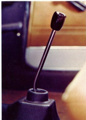
Four speed all synchromesh gearbox with floor mounted stick shift

A sudden stop? No panic. Peugeot's power-assisted front disc and rear drum brakes seize control and bring you to a halt evenly, quickly. Perhaps the greatest sport of owning a Peugeot 304 is front wheel drive. With the entire weight of the transverse engine over the drive wheels there's more traction in mud, ice and snow. And better traction means better stability in tight cornering situations and gusty side winds. Plus better, more precise steering. You climb mountain roads, pull out of snow banks and mud holes without a struggle.