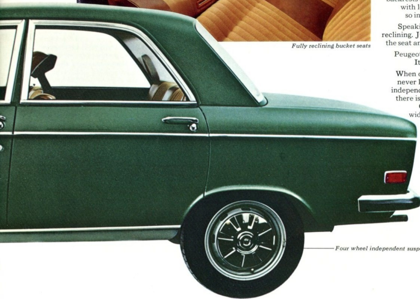
Four wheel independent suspension