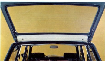
Door hinged at top for easy loading. Defroster clears rear window quickly.