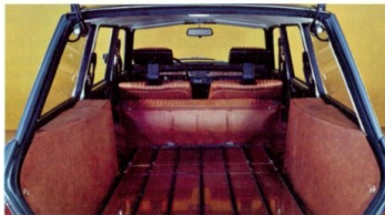
Total baggage area: 52 cubic feet.