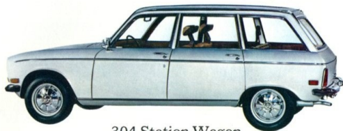
304 Station Wagon