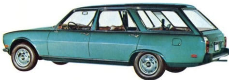
504 Station Wagon