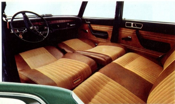
Fully reclining bucket seats

Combined with Peugeot's low center of gravity, wide stance and ideal weight distribution, you ride in total comfort under any driving condition.