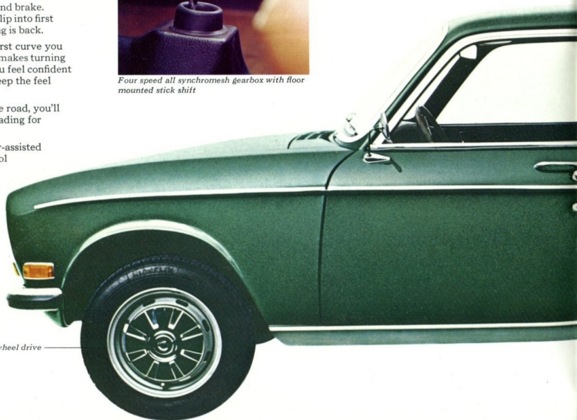
Front wheel drive