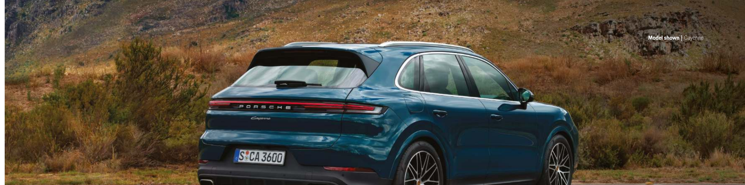
Model shown | Cayenne