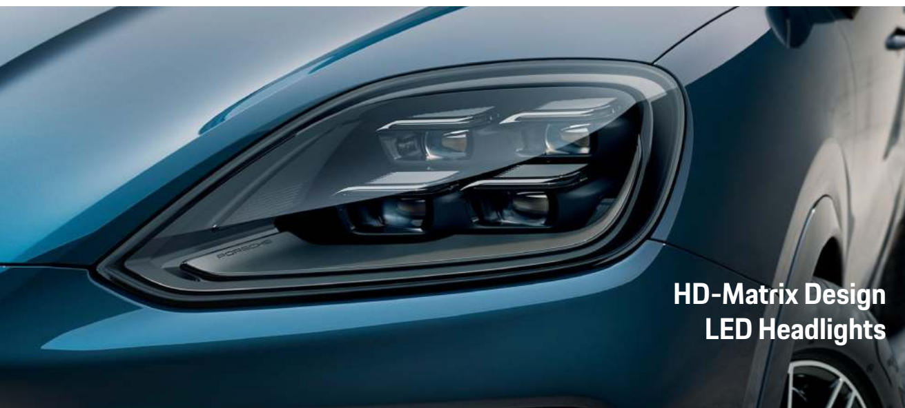
HD-Matrix Design LED Headlights