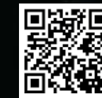
More on Cockpit