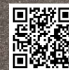
More on Exterior design

The new Cayenne models have a fundamentally reworked exterior design. It's more expressive, more prominent, and more modern. Our designers have drawn on their extensive experience and redesigned the body, with an emphasized width, raised fenders, clear lines, more pronounced air intakes, as well as headlights and lights with a modern technical look.