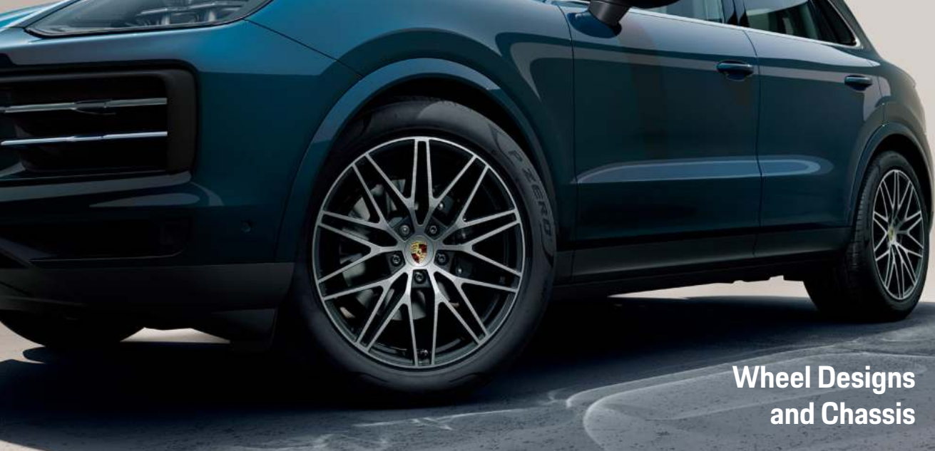
Wheel Designs and Chassis