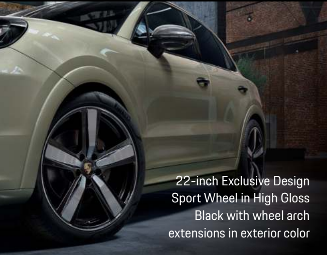
22-inch Exclusive Design Sport Wheel in High Gloss Black with wheel arch extensions in exterior color