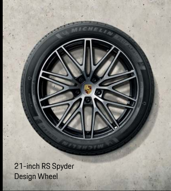
21-inch RS Spyder Design Wheel