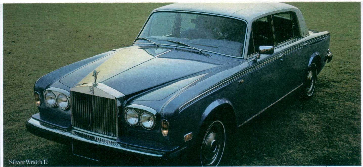
Silver Wraith II