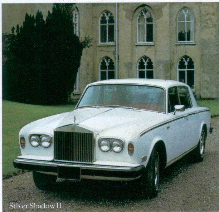
Silver Shadow II