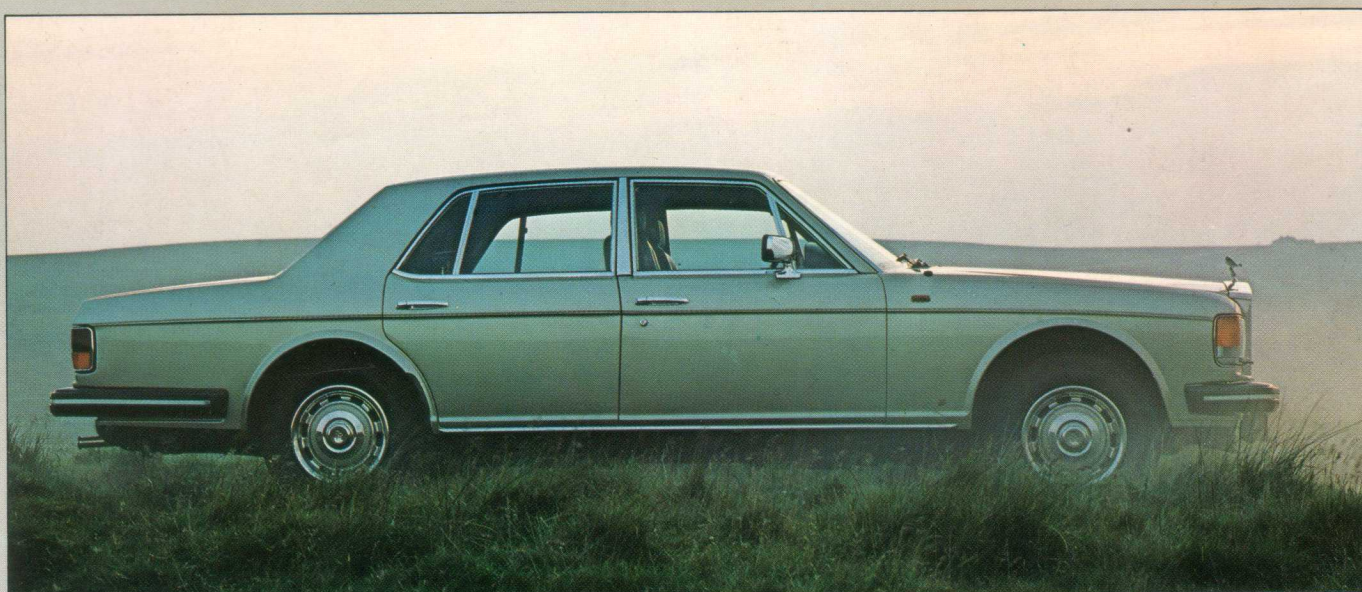
ROLLS-ROYCE SILVER SPIRIT — INHERITING ALL THE TRADITIONS OF THE BEST CAR IN THE WORLD