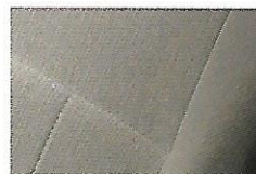
CE Fabric in Light Charcoal (shown) or Pebble Beige

like a 4-wheel Anti-lock Brake System (ABS), moonroof and even side-impact air bags! That's more than adjusting expectations — that's raising them.