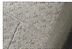
S Fabric in Black Sport Cloth