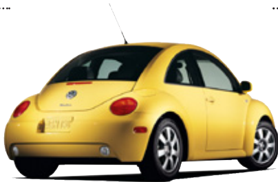
GLX M.S.R.P. $21,640 1