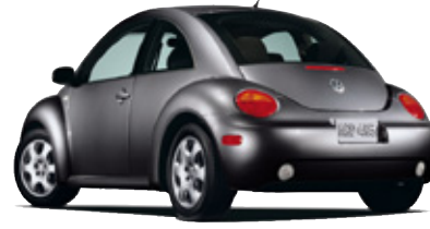
GLS M.S.R.P. $17,815 1