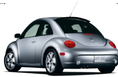
Turbo S M.S.R.P. $23,540 1