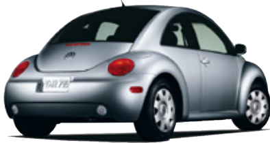
GL M.S.R.P. $15,950 1