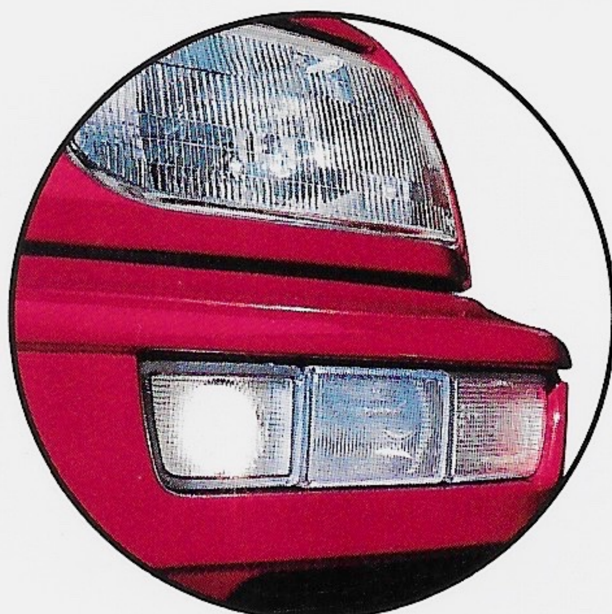
Fog lights and daytime running lights for anything that might come between you and your mountain.