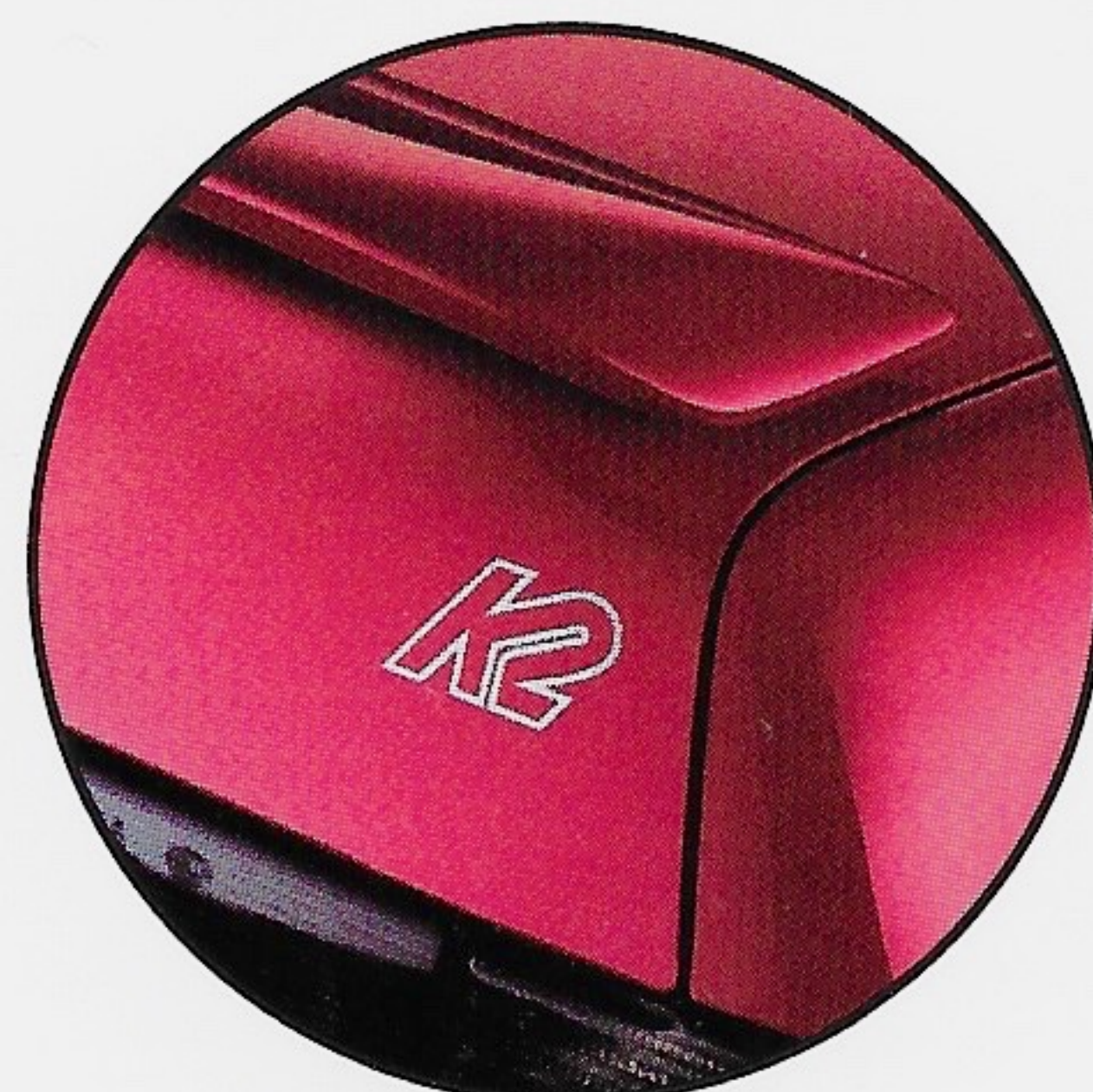
Really cool, super wintery badging.