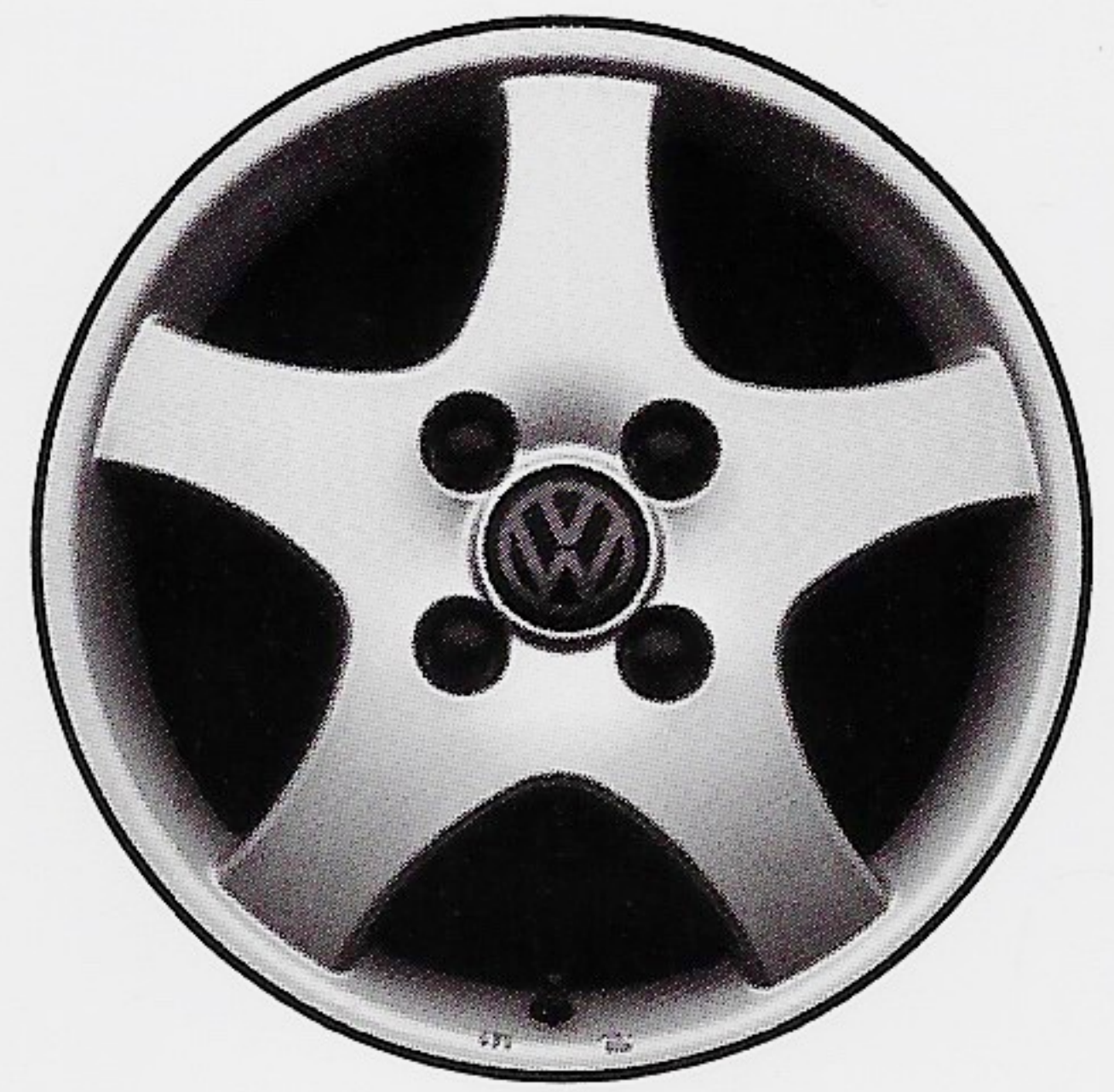
Alloy Wheels: lightweight and durable.