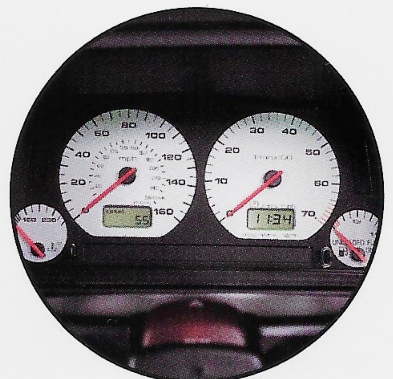
Easy-to-read instrumentation panel gauges outside temperature.