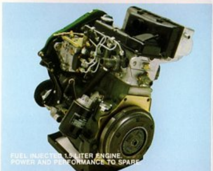
FUEL INJECTED 1.5 LITER ENGINE. POWER AND PERFORMANCE TO SPARE.