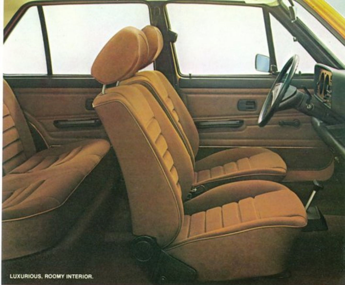
LUXURIOUS, ROOMY INTERIOR.