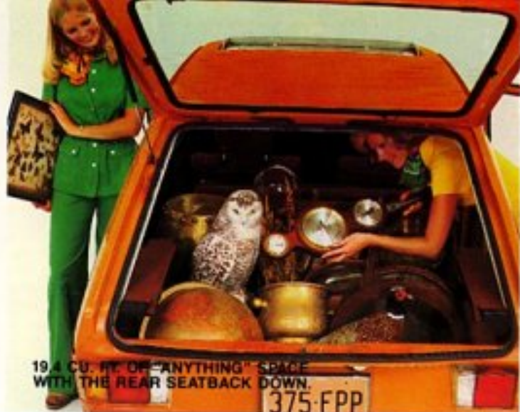
19.4 CU. FT. OF "ANYTHING" SPACE WITH THE REAR SEATBACK DOWN.