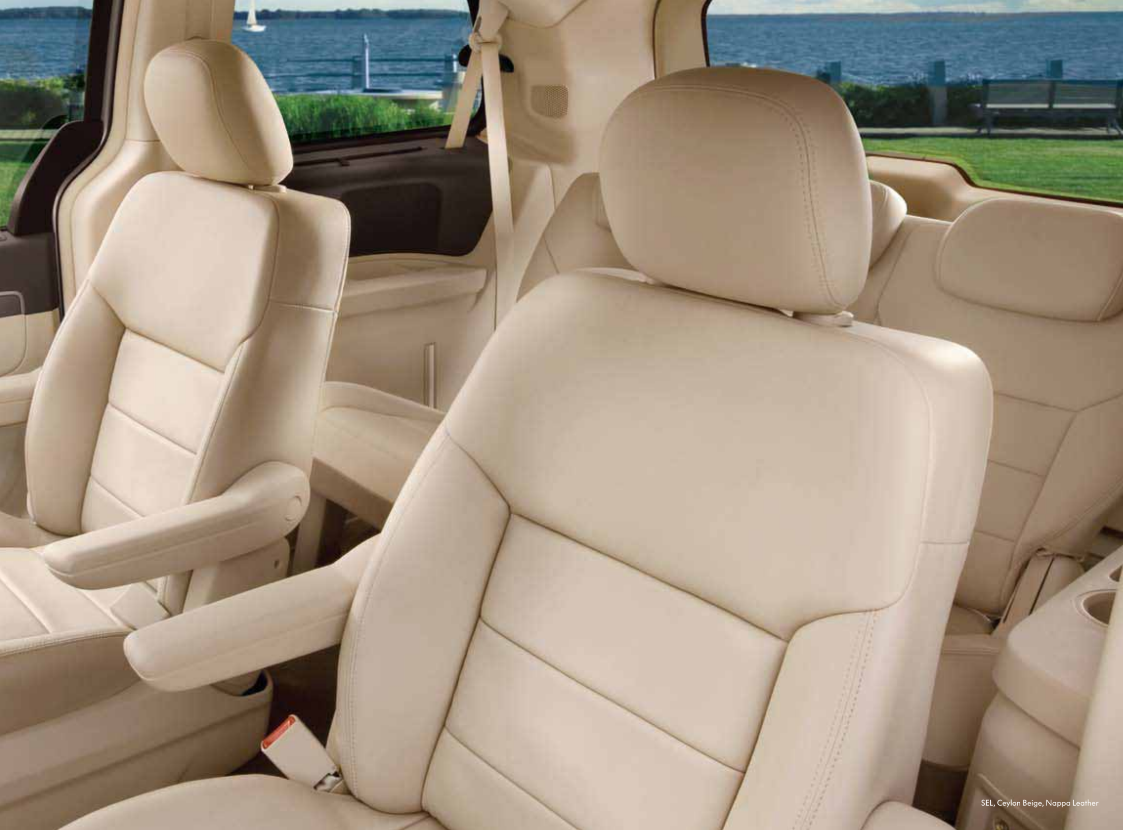
SEL, Ceylon Beige, Nappa Leather