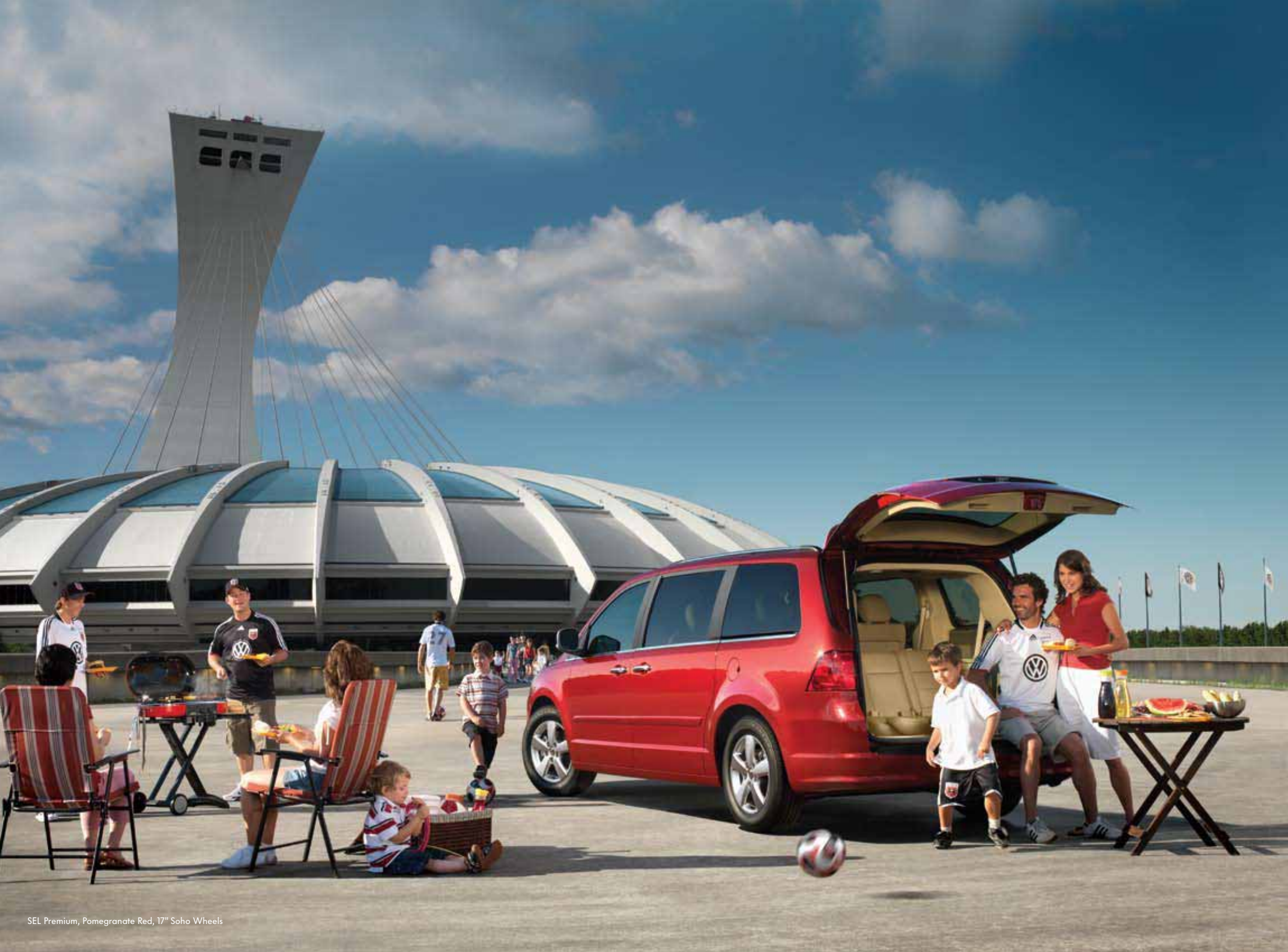
SEL Premium, Pomegranate Red, 17" Soho Wheels