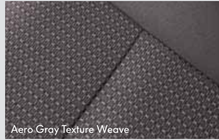
Aero Gray Texture Weave