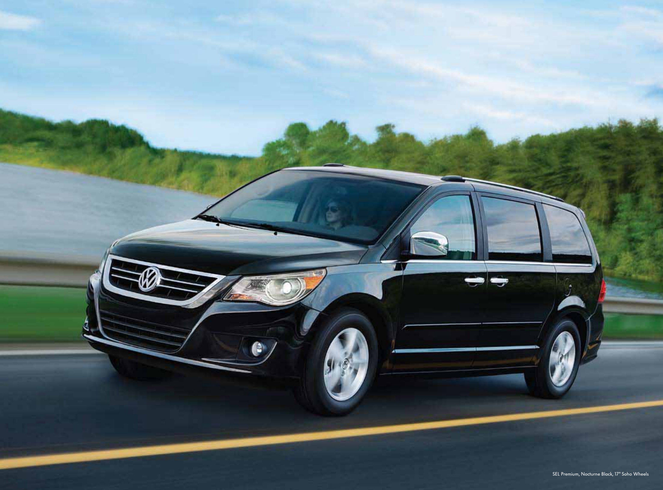
SEL Premium, Nocturne Black, 17" Soho Wheels