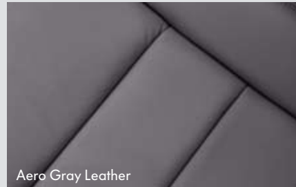
Aero Gray Leather