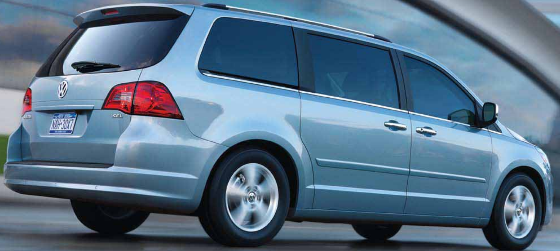
SEL Premium, Antigua Blue, 17" Soho Wheels