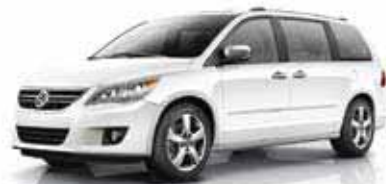
Calla Lilly White