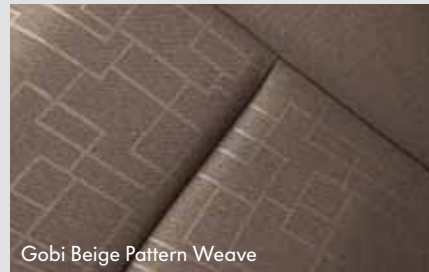
Gobi Beige Pattern Weave