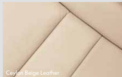
Ceylon Beige Leather