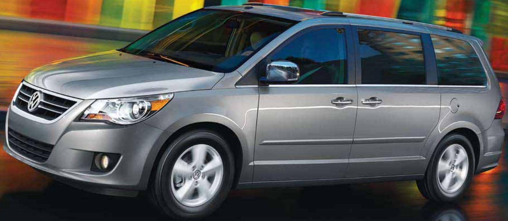
SEL Premium, Mercury Silver, 17" Soho Wheels