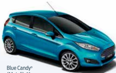
Blue Candy o (Metallic*)