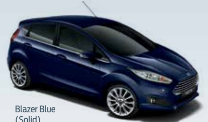
Blazer Blue (Solid)