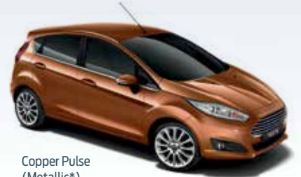
Copper Pulse (Metallic*)