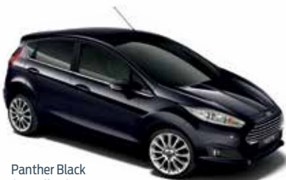
Panther Black (Metallic*)