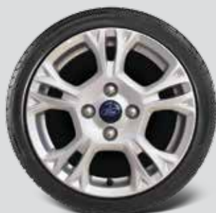
15" Alloy wheel Standard on Trend