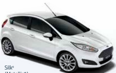
Silk o (Metallic*)