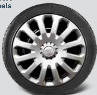
15" Steel wheel with styled cover Standard on Ambiente