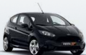
Panther Black (Metallic*)

*Metallic body colours are options at extra costs.