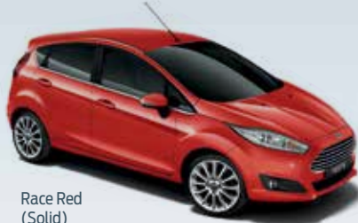
Race Red (Solid)