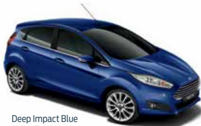
Deep Impact Blue (Metallic*)