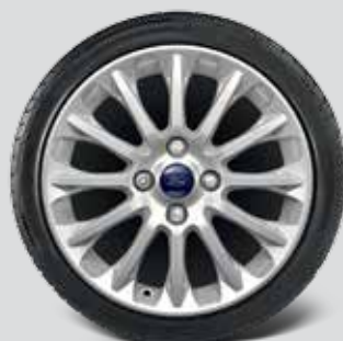
16" Alloy wheel Standard on Titanium