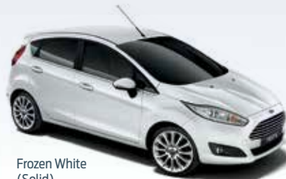
Frozen White (Solid)