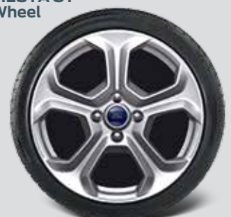
17" Alloy wheel 205/40/R17