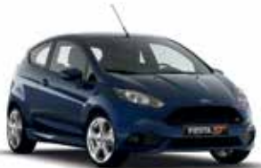
Spirit Blue (Metallic*)