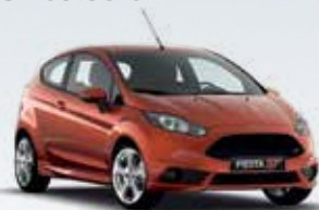
Molten Orange (Metallic*)