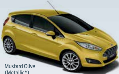
Mustard Olive (Metallic*)