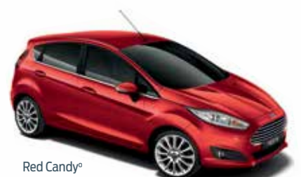
Red Candy o (Metallic*)