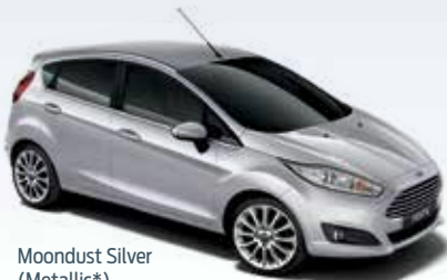
Moondust Silver (Metallic*)