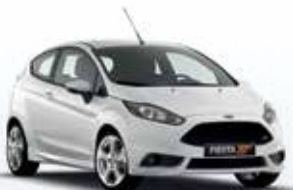
Frozen White (Solid)