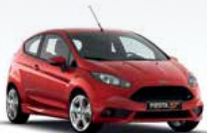
Race Red (Solid)