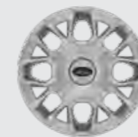
14" Steel wheel cover - 175/65 R14 Available on Ambiente models