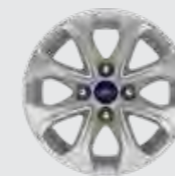
14" Alloy wheel - 175/65 R14 Available on Trend models