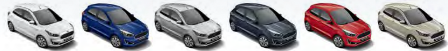
Oxford White (Solid)

Every aspect of the FIGO has been thoughtfully crafted. A bold exterior that turns heads and an interior aimed to give you a new perspective.