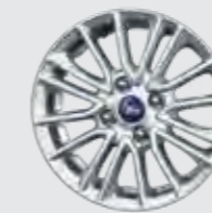
15" Alloy wheel - 175/65 R15 Available on Titanium models only