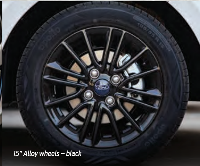
15" Alloy wheels – black