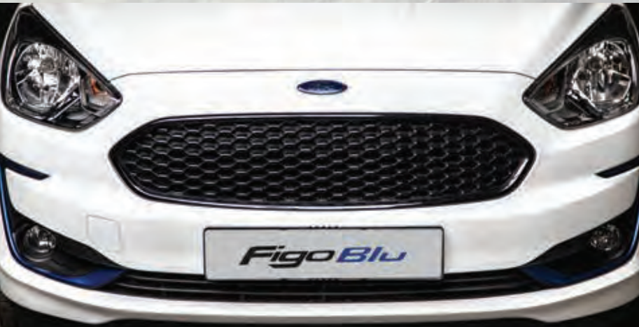
Black mesh grille