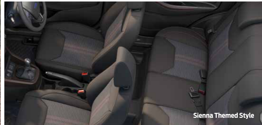
Sienna Themed Style