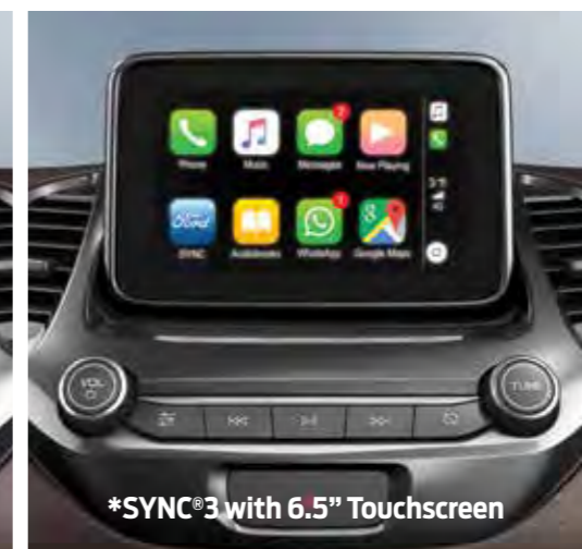
*SYNC®3 with 6.5" Touchscreen