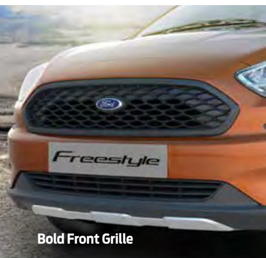
Bold Front Grille