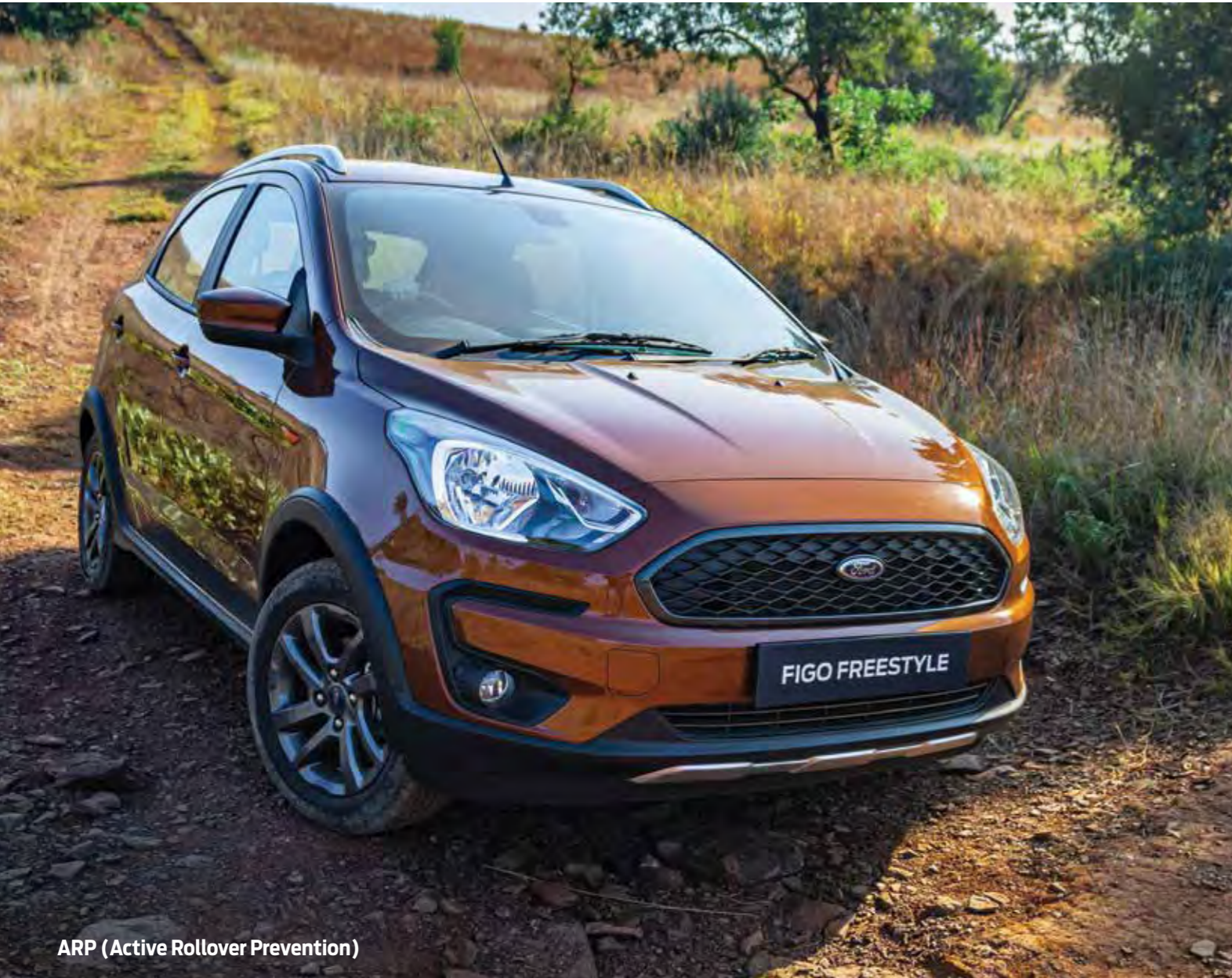
ARP (Active Rollover Prevention)

The New FIGO FREESTYLE lets you drive through rough terrain boldly without compromising on safety. Its safety features are always ready for your free spirit, making sure you lead a life free of any regret. Its smart technology and intuitive abilities are not just limited to what's outside the car but also what's on your mind, letting you navigate through life at your own free will in a car nested with a premium interior.