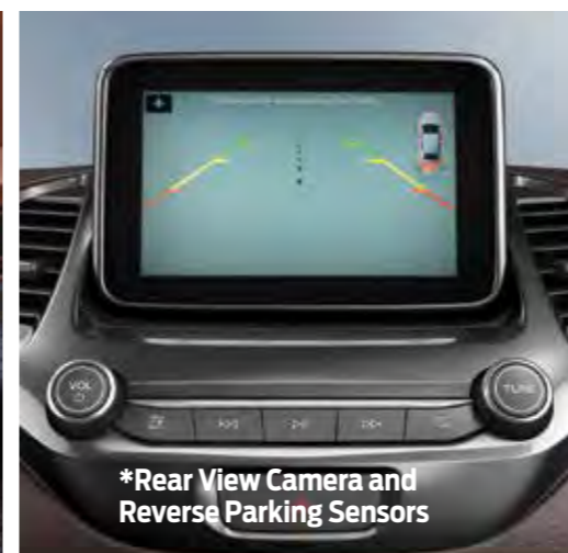
*Rear View Camera and Reverse Parking Sensors