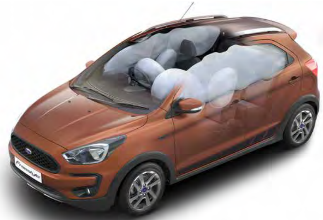
*6 Airbags *Driver, passenger, side and curtain airbags.