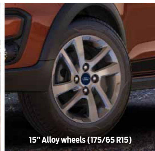
15" Alloy wheels (175/65 R15)