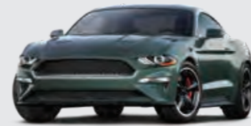
Dark Highland Green

10 minutes and 53 seconds. That's all it took for the New MUSTANG to drive into cinematic history and become an icon for generations to come. 50 years after what critics call one of the best car chase scenes of all time, the legend is back. In all its glory, power and prestige, the 50th anniversary edition MUSTANG BULLITT is here.