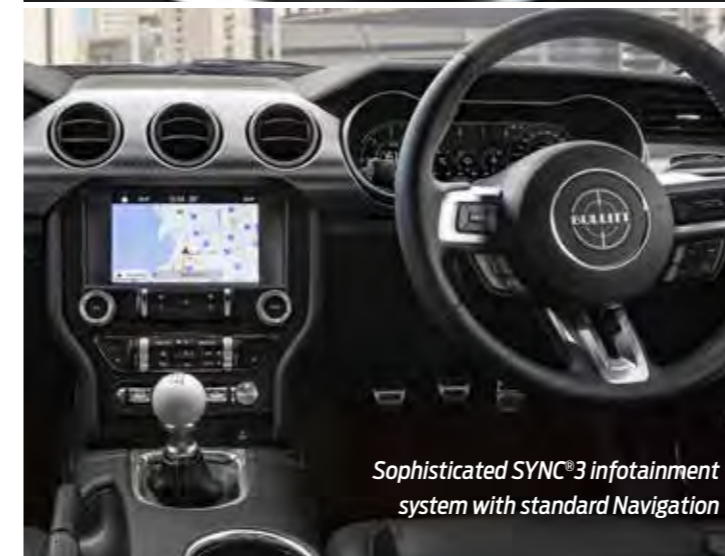
Sophisticated SYNC 3 infotainment system with standard Navigation