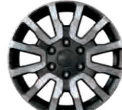
18" Alloy wheel (Available on Wildtrak derivatives only)