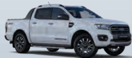
Frozen White (Solid)