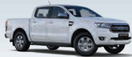
Frozen White (Solid)