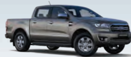
Diffused Silver (Metallic*)