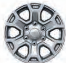
16" Alloy wheel (Standard on XLS derivatives) (Optional on XL derivatives, at an additional cost)