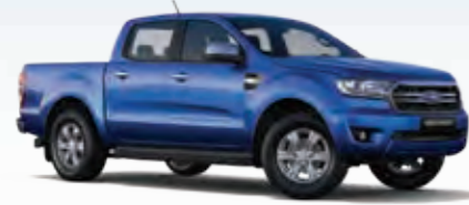
Blue Lightning (Metallic*)