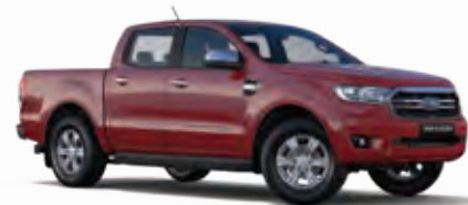
Colorado Red (Solid)