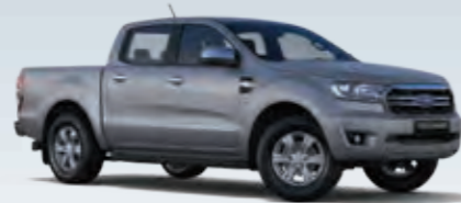
Moondust Silver (Metallic*)