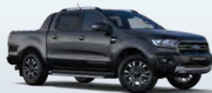
Sea Grey (Metallic*)