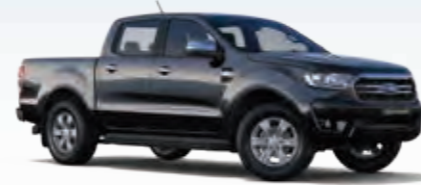
Absolute Black (Metallic*)