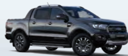
Absolute Black (Metallic*)