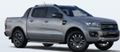
Moondust Silver (Metallic*)