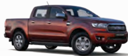
Copper Red (Metallic*)