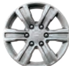
17" Silver Alloy wheel (Standard on XLT derivatives) (Optional on XLS derivatives) Available in black as an option at an additional cost for XLS, XLT, and XL (Super and Double Cab only)