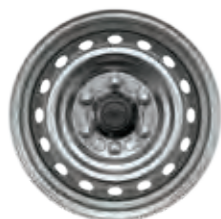
16" Steel wheel