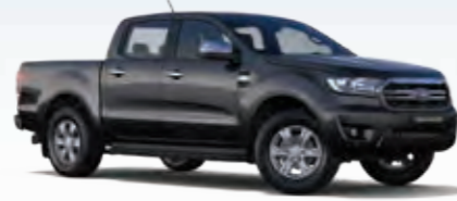
Sea Grey (Metallic*)