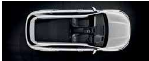
2 nd row folded fully flat

When your head says, "let's push boundaries", the Sorento says, "let's do it in style". That's why you'll find the ultimate in comfort, space, and flexibility wrapped inside its bold exterior design.