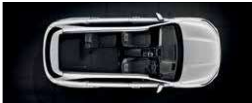
3 rd row folded fully flat and 2 nd row partially folded