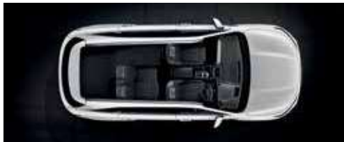
2 nd row partially folded