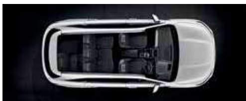
3 rd row partially folded