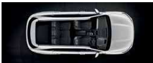
3 rd row folded fully flat