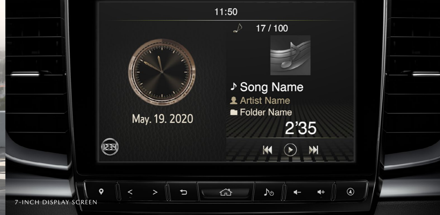
7-INCH DISPLAY SCREEN