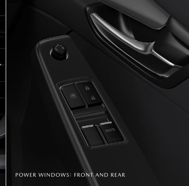
POWER WINDOWS: FRONT AND REAR