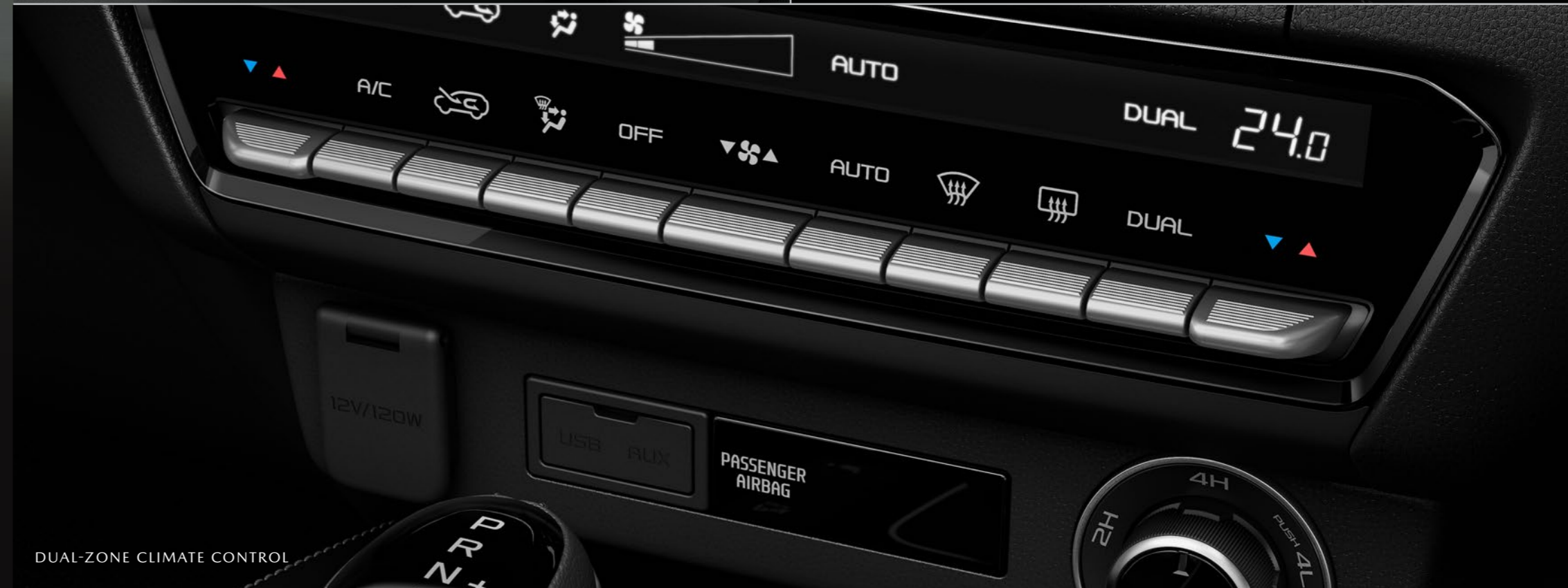
DUAL-ZONE CLIMATE CONTROL