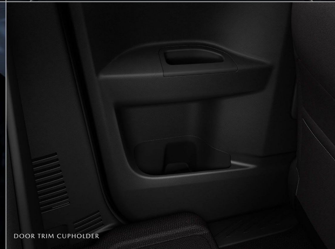
DOOR TRIM CUPHOLDER