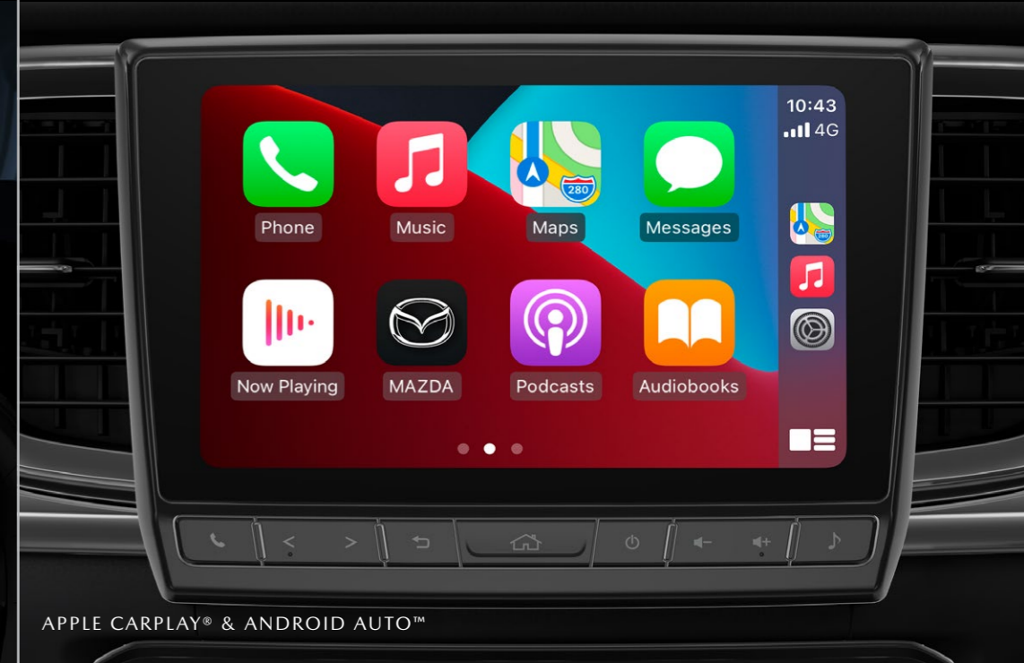
APPLE CARPLAY® & ANDROID AUTO™