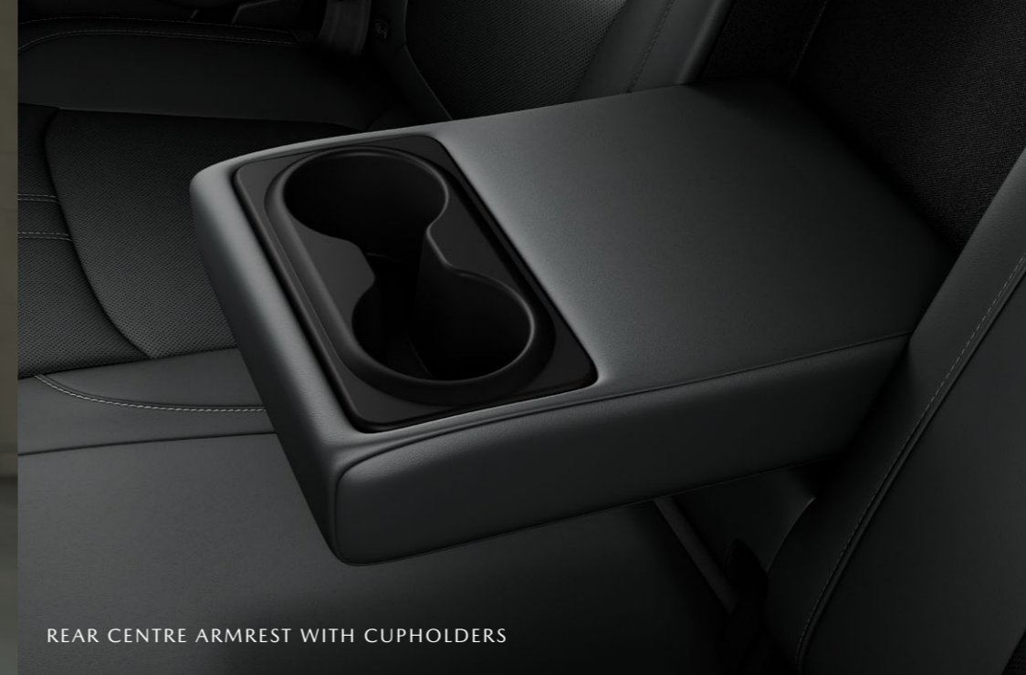
REAR CENTRE ARMREST WITH CUPHOLDERS