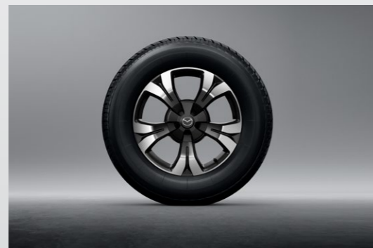
DYNAMIC & INDIVIDUAL MODELS 18" Alloy Wheels (Grey Metallic)