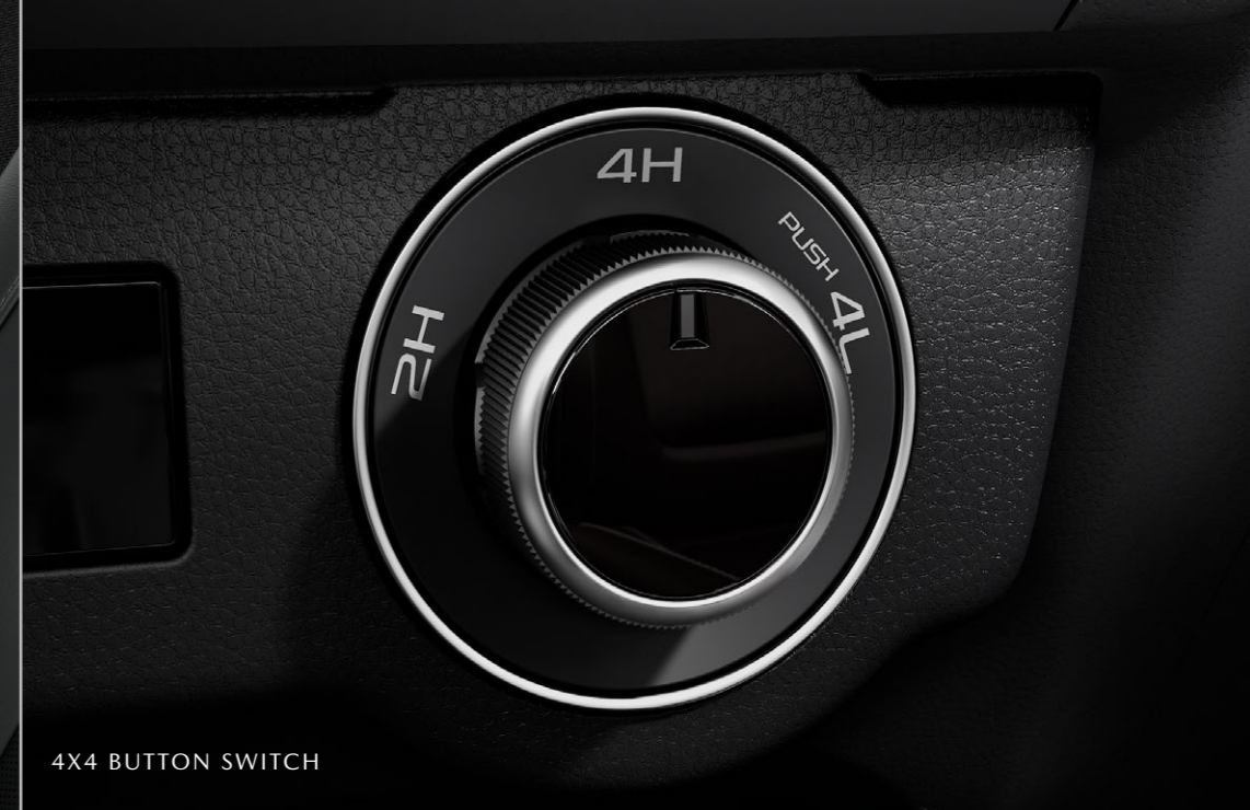
4X4 BUTTON SWITCH