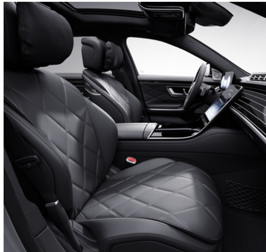
Maybach Exclusive nappa leather black (511A) (S 680)