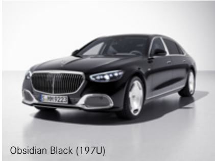
Obsidian Black (197U)