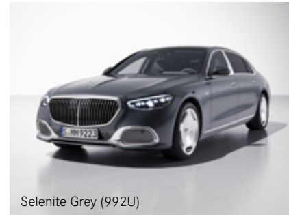
Selenite Grey (992U)