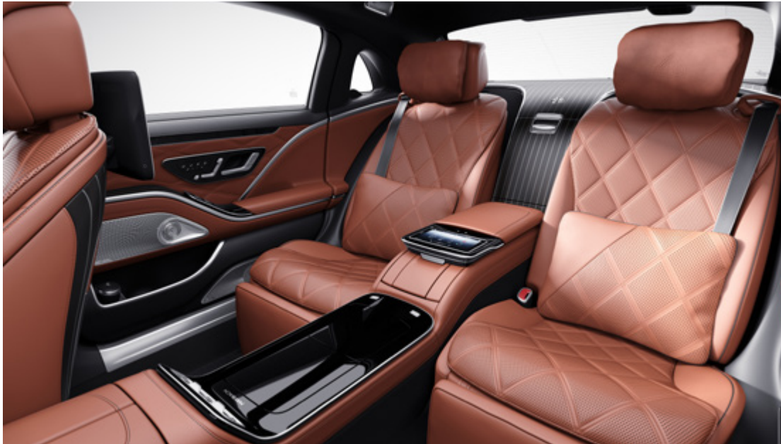
Maybach Exclusive nappa leather sienna brown/black (514A) | Exclusive package (P34) | Chauffeur package (P07) | First-Class rear compartment (224), Executive seats (453), MANUFAKTUR Leather Package (U61)