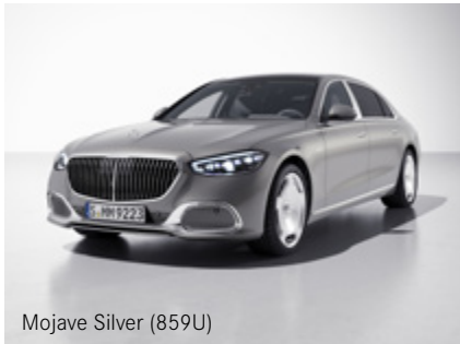
Mojave Silver (859U)