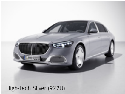
High-Tech Silver (922U)