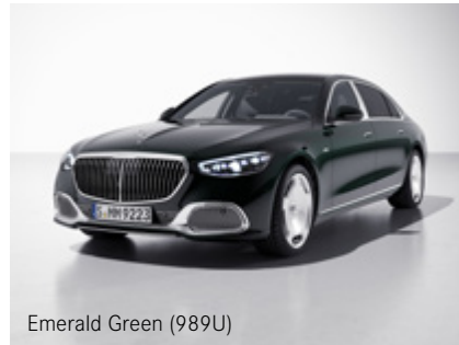
Emerald Green (989U)