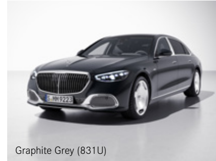
Graphite Grey (831U)