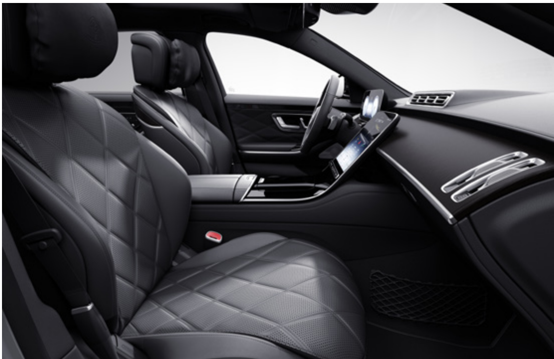
Maybach nappa leather black (811A) (S 580) | Anthracite open-pore poplar wood trim (H02)