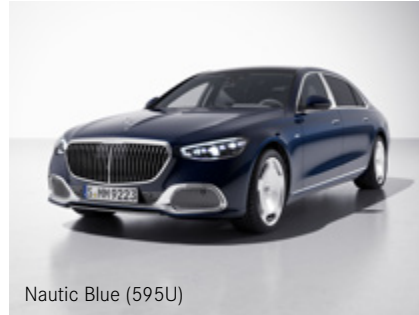
Nautic Blue (595U)