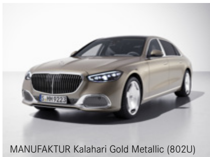
MANUFAKTUR Kalahari Gold Metallic (802U)