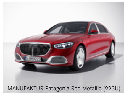
MANUFAKTUR Patagonia Red Metallic (993U)