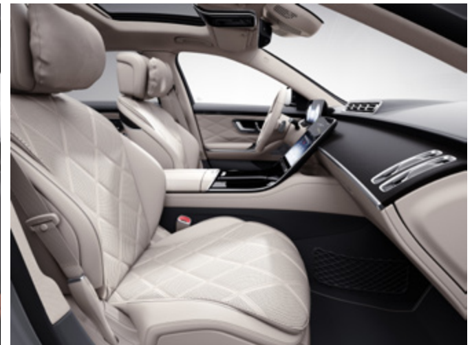
Maybach nappa leather - macchiato beige / magma grey (815A) Anthracite open-pore poplar wood trim (H02)