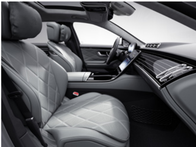
Maybach Exclusive nappa leather silver grey / black (518A) MANUFAKTUR black piano lacquer trim with flowing lines (H17)