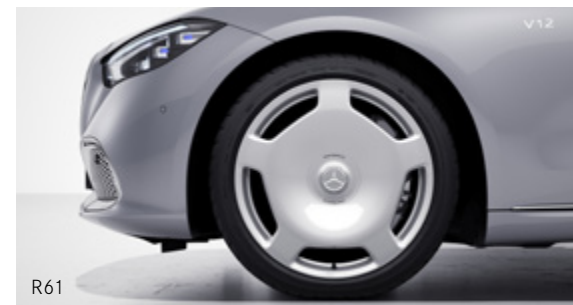
53.3 cm (21") Maybach multi-spoke forged wheels (NICW 216) R 115,000