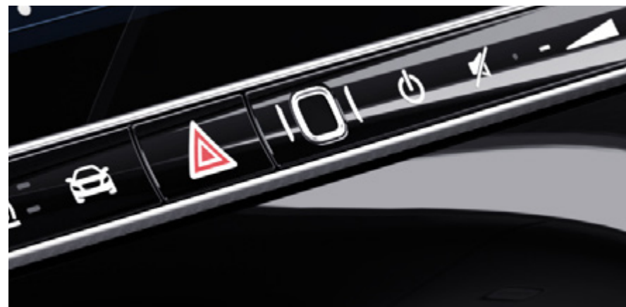
Fingerprint scanner (321)