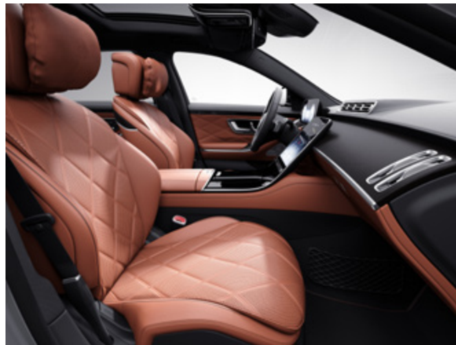
Maybach nappa leather sienna brown / black (814A) Anthracite open-pore poplar wood trim (H02)