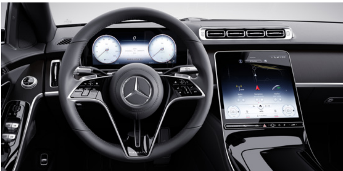
OLED central display (868) | Multifunction steering wheel in nappa leather (L2B)