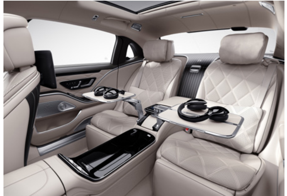
Maybach Exclusive nappa leather macchiato beige/bronze brown pearl (515A) | folding tables in the rear (449), 2 wireless head sets (U58)