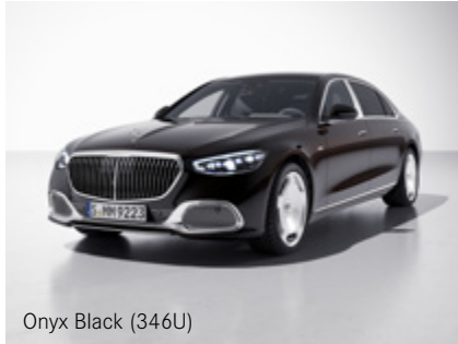
Onyx Black (346U)