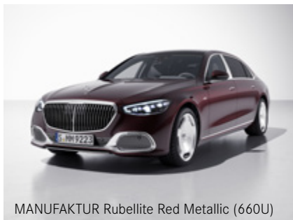
MANUFAKTUR Rubellite Red Metallic (660U)