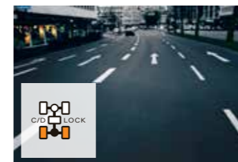
2H (2WD HIGH RANGE)

Mitsubishi's rally-proven Super Select 4WD lets you move from smooth 2H mode highway performance to rugged 4H mode traction without breaking stride. With shift-on-the-fly convenience at up to 100km/h, the right driving mode is always at your fingertips.