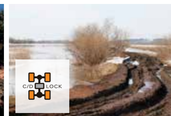
4LLC (4WD LOW RANGE WITH CENTRE DIFFERENTIAL LOCKED)*

With the centre differential locked to distribute equal torque to all four wheels, this mode is suitable for rough back roads or hazardous weather conditions.