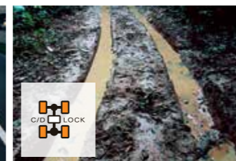
4H (4WD HIGH RANGE)

Only the rear wheels receive power. This mode is best suited for highways and normal driving conditions.