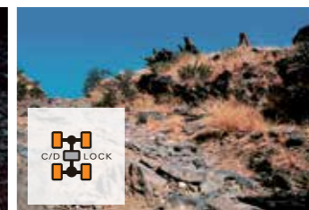
4HLC (4WD HIGH RANGE WITH CENTRE DIFFERENTIAL LOCKED)

4WD control gives ready traction on changing conditions or surfaces. It can react to traction loss by automatically redistributing power up to a 50:50 split.