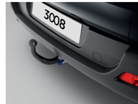
Manual removable tow bar * Requires tow electrics and adaptor Tow bar - Ref. No.: 9627QG Wiring loom - Ref. No.: 1608109580