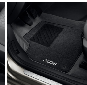
Set of front and rear needle-pile floor mats Ref. No.: 9663C8