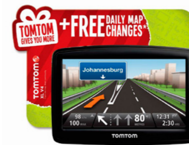
Tom Tom XL Classic Ref. No.: 99TMTMXLCL