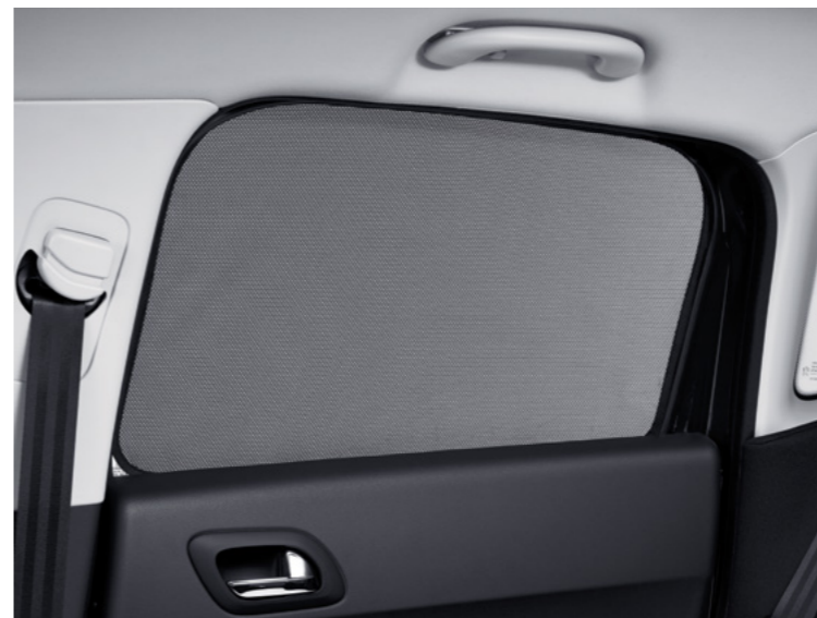
Rear passenger window sunblind - Set of 2 Ref. No.: 9459F4

Your 3008 is a living space. Make it pleasantly comfortable and convenient with these specially designed accessories.