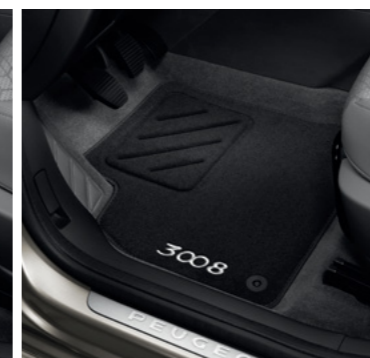
Set of front and rear velour floor mats Ref. No.: 9663E2