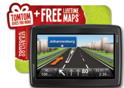
Tom Tom GO LIVE 825 Ref. No.: 99PECITGGO