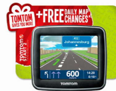
Tom Tom START Classic Ref. No.: 99TMTMSTCL