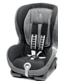
Römer Duo Plus isofix Group 1 Ref. No.: 1608847580