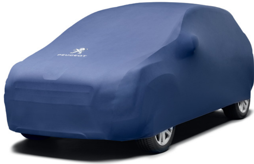
Exterior dust cover Ref. No.: 9623E8

3008 accessories enable you to optimise protection regardless of the weather. Equip your 3008 with this wide range of equipment and benefit from the increased security.