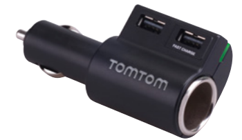
Tom Tom - High speed multi charger Ref. No.: 99HSPMTICH