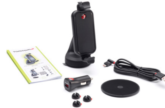
Tom Tom Smartphone charger and windscreen mount Ref. No.: 99WNSCNMT