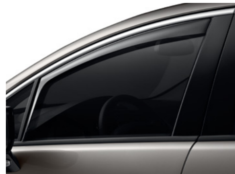
Front door wind deflectors - Set of 2 Ref. No.: 9621H7