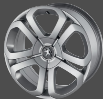
17" Galium alloy wheel Ref. No.: 9607S0