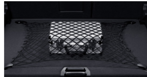
Boot liner net Ref. No.: 7568HN