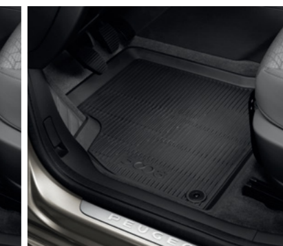
Set of front and rear rubber floor mats Ref. No.: 1609351580