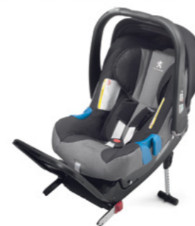
Römer Baby Safe + Group 0+ Ref. No.: 1608847480