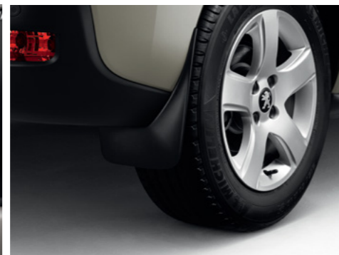
Rear mudflaps - set of 2 Ref. No.: 9603S7