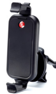
Tom Tom Smartphone airvent mount Ref. No.: 99AIRVNTMT