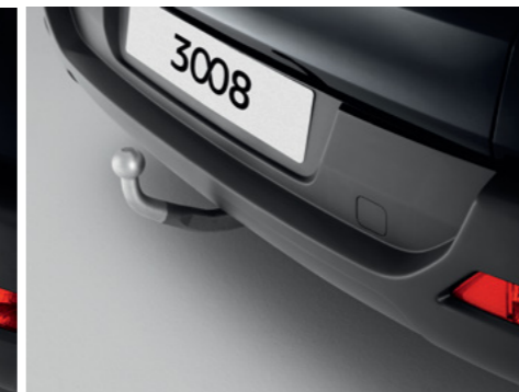
Swan's neck tow bar * Requires tow electrics and adaptor Tow bar - Ref. No.: 9627PJ Wiring loom - Ref. No.: 1608109580