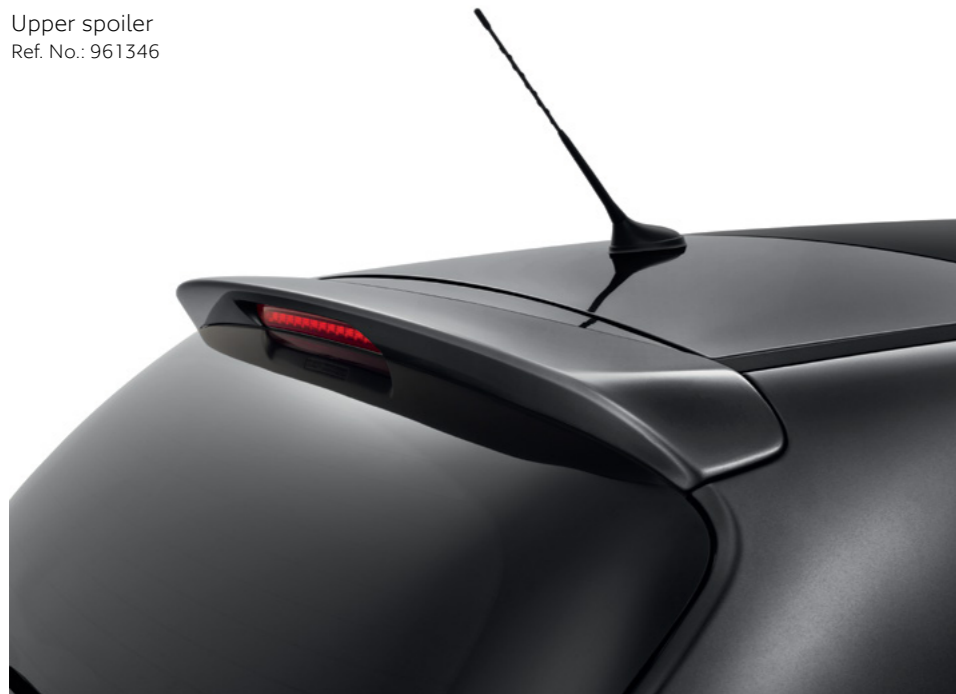
Upper spoiler Ref. No.: 961346

Strengthen the aerodynamics and originality of the PEUGEOT 3008 "crossover" with these innovative accessories that highlight its uniqueness. An elegant yet modern Peugeot style.