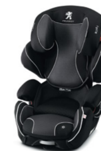
Kiddy Cruiserfix Pro Group 2, 3 Ref. No.: 160823680