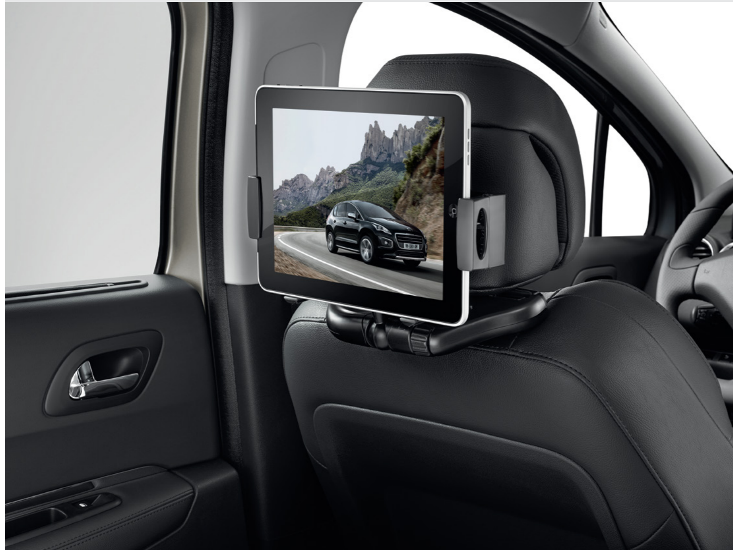
Multimedia device holder Ref. No.: 9473Z1

Transform your journey into moments of pleasure with these high-tech multimedia devices.