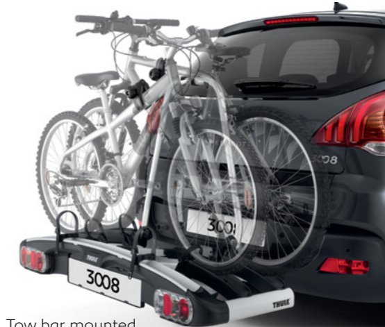
Tow bar mounted bicycle carrier 2 Cycle - Ref. No.: 1607018380 3 Cycle - Ref. No.: 1607798980