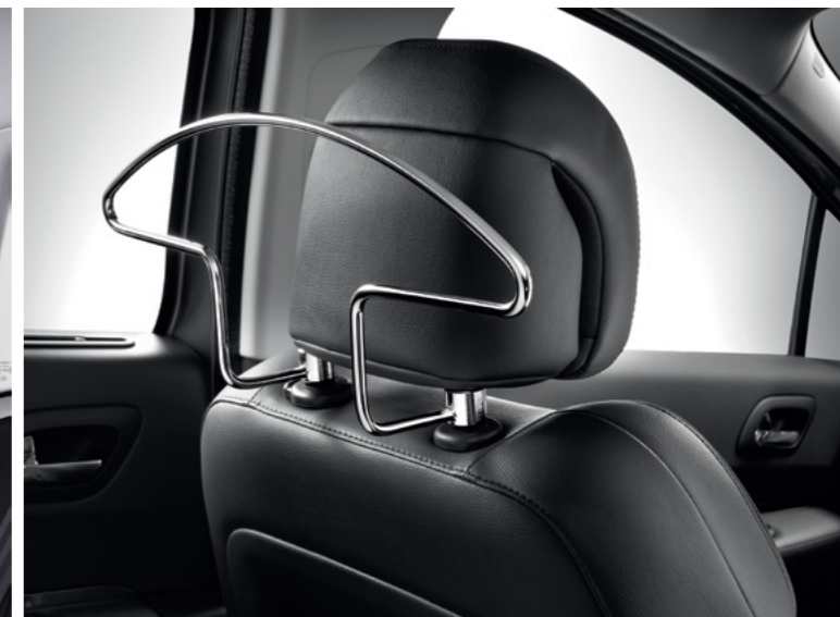
Headrest hanger Ref. No.: 1607938180