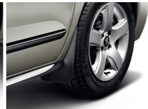
Front mudflaps - set of 2 Ref. No.: 9603S6