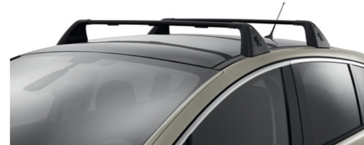
Transverse roof bars - set of 2 Ref. No.: 9616X2

Practical and versatile, PEUGEOT 3008 accessories have been designed to make just about any activity possible.