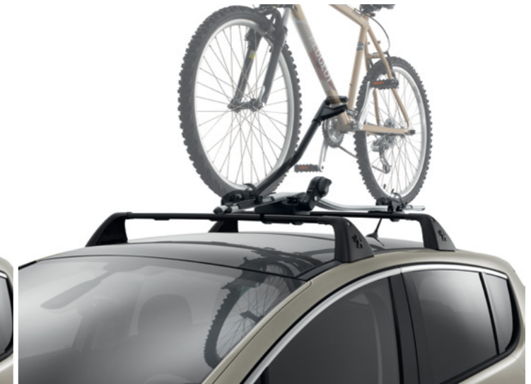
Single bicycle carrier on roof bars Ref. No.: 1607798880