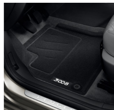
Set of front and rear formed mats Ref. No.: 1609072280