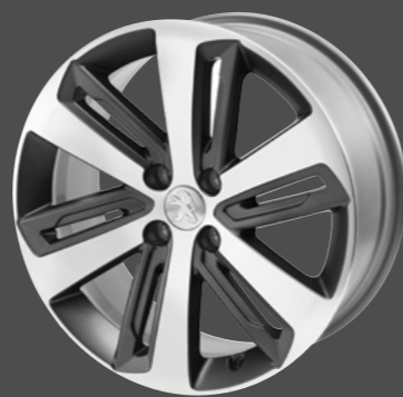
18" Icauna alloy wheel Ref. No.: 98024624ZV