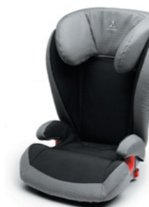
Römer Kidfix isofix Group 2, 3 Ref. No.: 1608847780