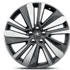
19" WASHINGTON two-tone diamond-cut alloy wheel rims Standard on GT Line