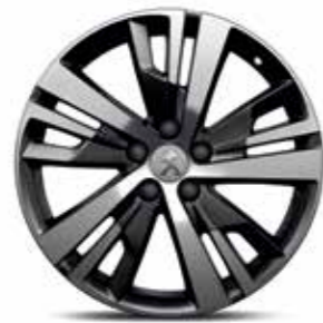
18" DETROIT two-tone diamond-cut alloy wheel rims Standard on Allure