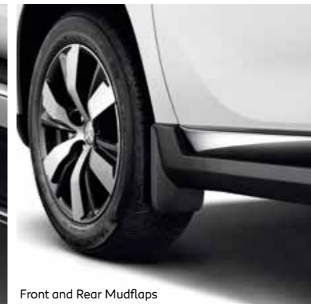
Front and Rear Mudflaps