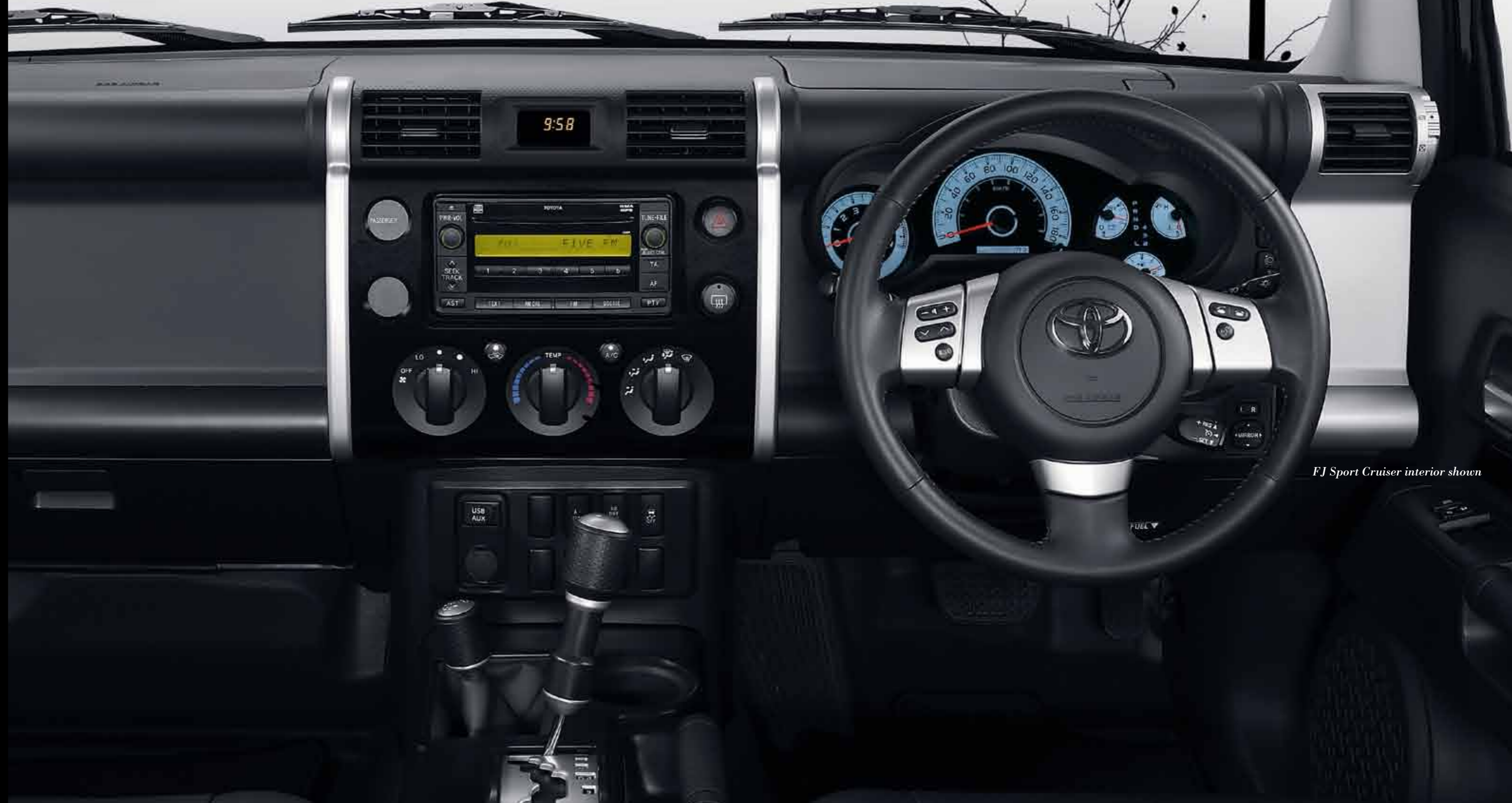
FJ Sport Cruiser interior shown