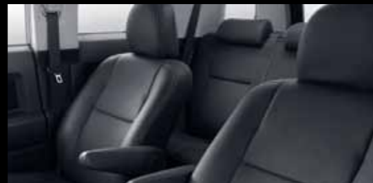
Black leather interior (FJ Sport Cruiser)