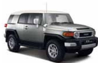
2KB GREY METALLIC