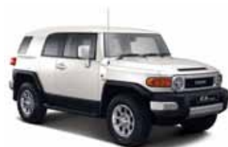
058 IVORY WHITE