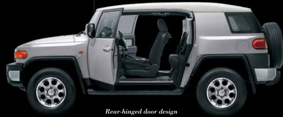
Rear-hinged door design