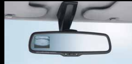
Rear view mirror with built-in reverse monitor