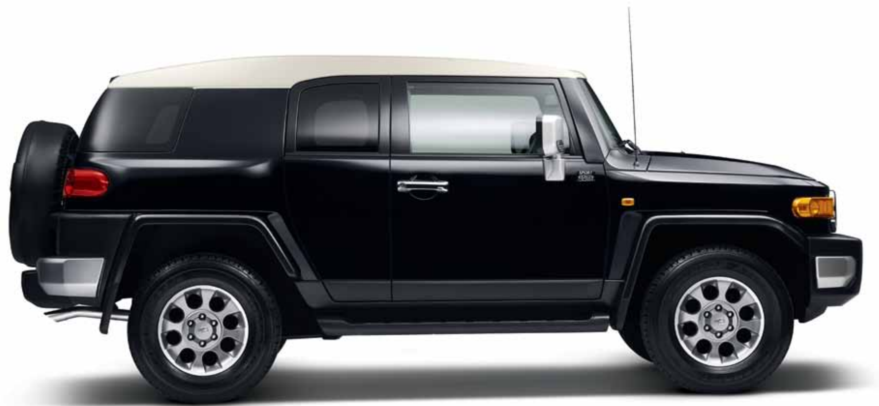
FJ Sport Cruiser shown