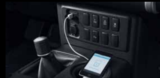
USB and iPod inputs