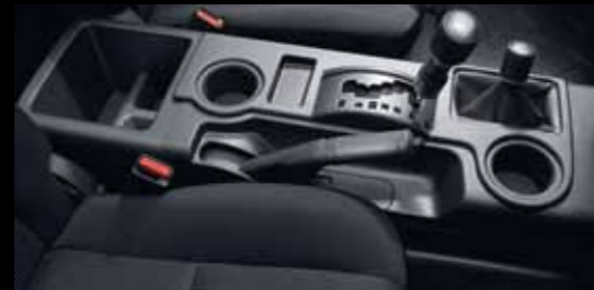
Centre console with convenient storage spaces