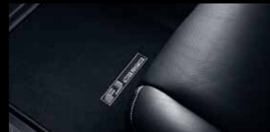
Carpet set (FJ Sport Cruiser)