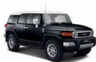
2KC RAVEN BLACK