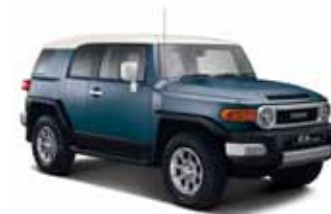
2KQ TIDAL BLUE

The FJ Sport Cruiser is available in 2KC Raven Black only.