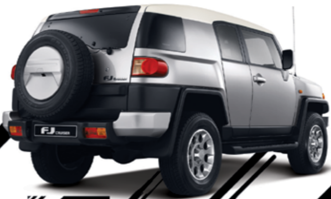
FJ Cruiser shown