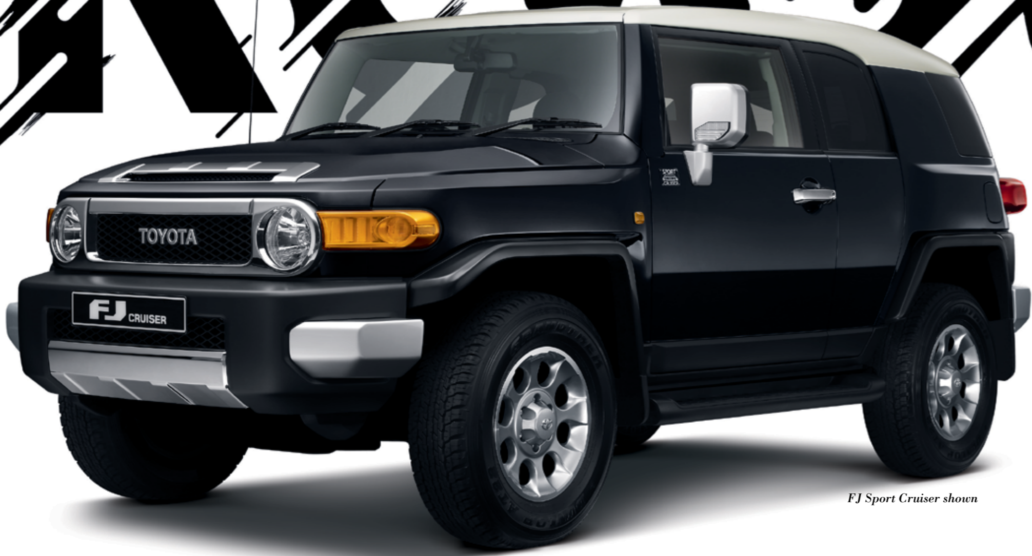
FJ Sport Cruiser shown