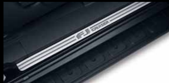
FJ Cruiser scuff plates (FJ Sport Cruiser)

With inner space that's big on technology with Bluetooth and USB and iPod inputs, you'll always be connected. The FJ delivers an exceptional acoustic experience with its 6-speaker audio system, including two ceiling-mounted speakers. And no matter how long or hard the road ahead, cruise control makes for smooth sailing. Add to that power steering and electrically-operated windows to make the trip that much easier. The back monitor that's integrated into the rear view mirror automatically switches on when the vehicle is in reverse – one less thing to stress about. Since the FJ is built for adventure, it is also as practical as it is sophisticated: smart storage spaces are ideal for small items and a rear seat that splits 60:40 with removable cushions make it easy for you to take large items on the road. The seats are water-repellant and the interior is easy to clean. The Sport Cruiser comes standard with black leather seats and a distinctive FJ Cruiser carpet set. And to keep you cool(er) on the road, there's air conditioning, of course.