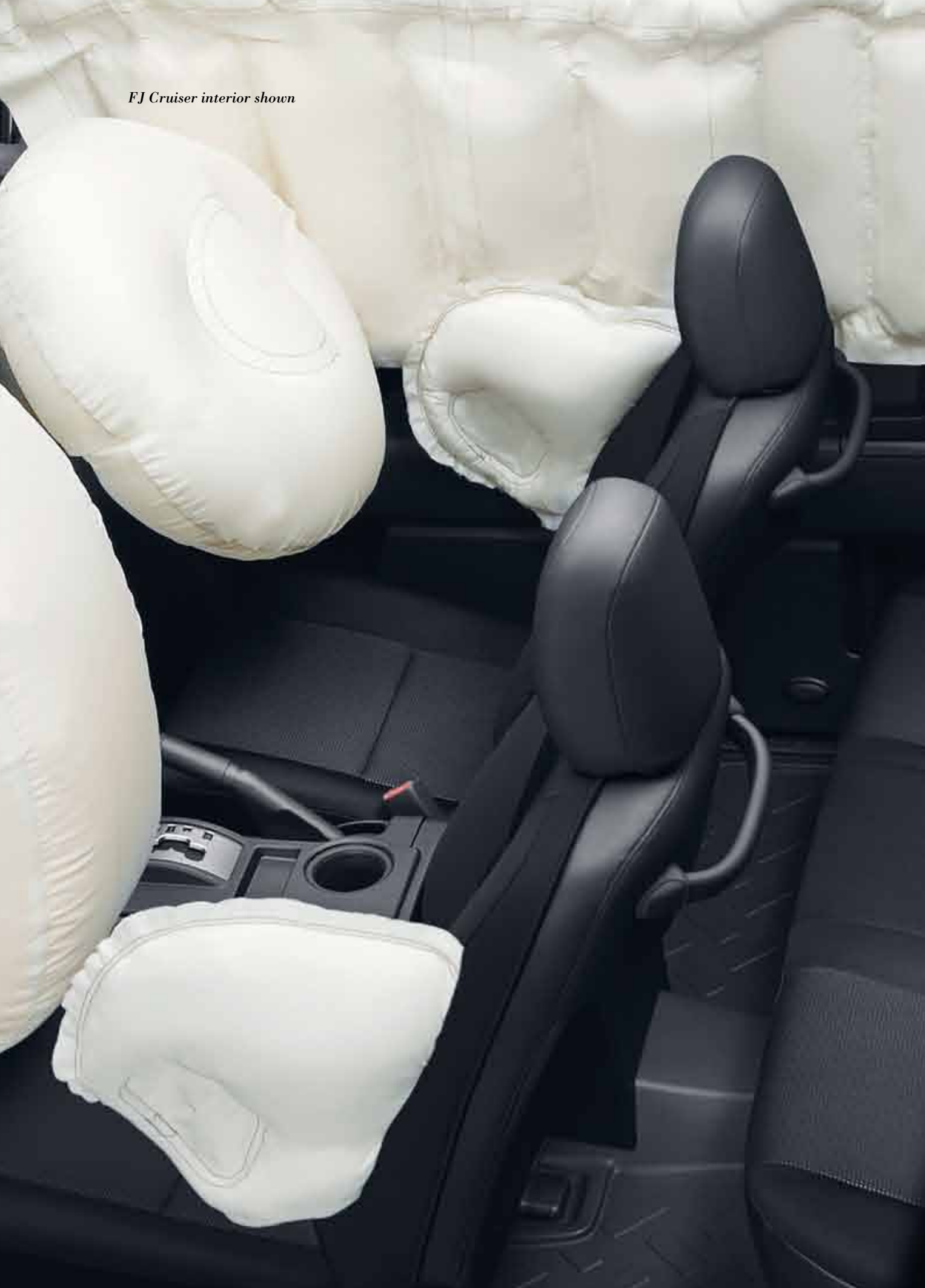
FJ Cruiser interior shown