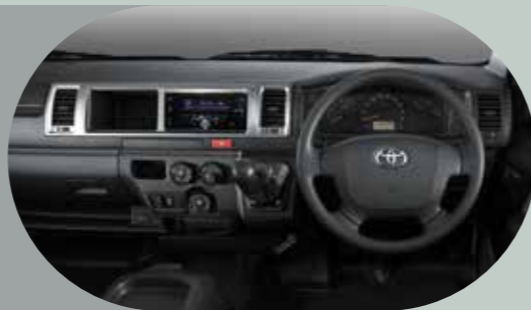
Model Shown Quantum Bus