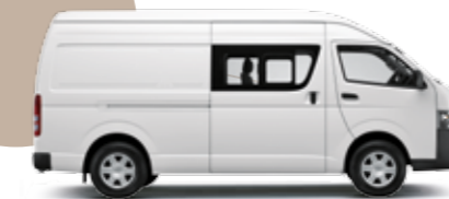
Model Shown Quantum Crew Cab