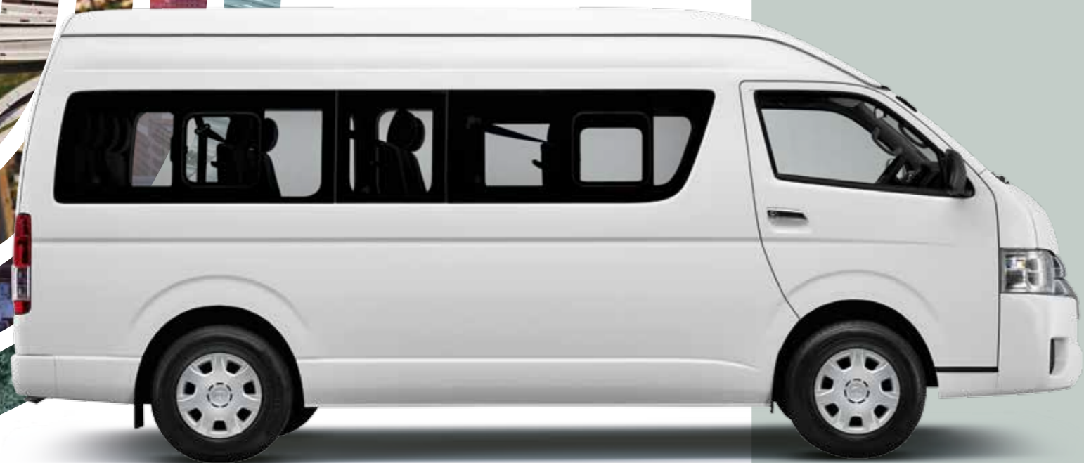
Model Shown Quantum Bus