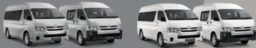
Quicksilver Metallic 1E7