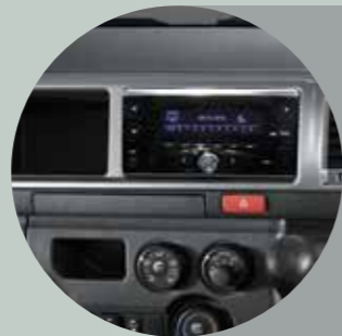
Model Shown Quantum Bus

A front-loading CD player, bluetooth and aux input are available on all bus models. Height adjustable steering wheel, power steering and electrically adjustable front windows all combine to enhance passenger and driver comfort and convenience.