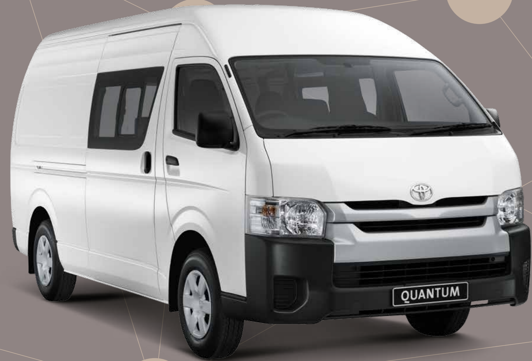
Model Shown Quantum Crew Cab