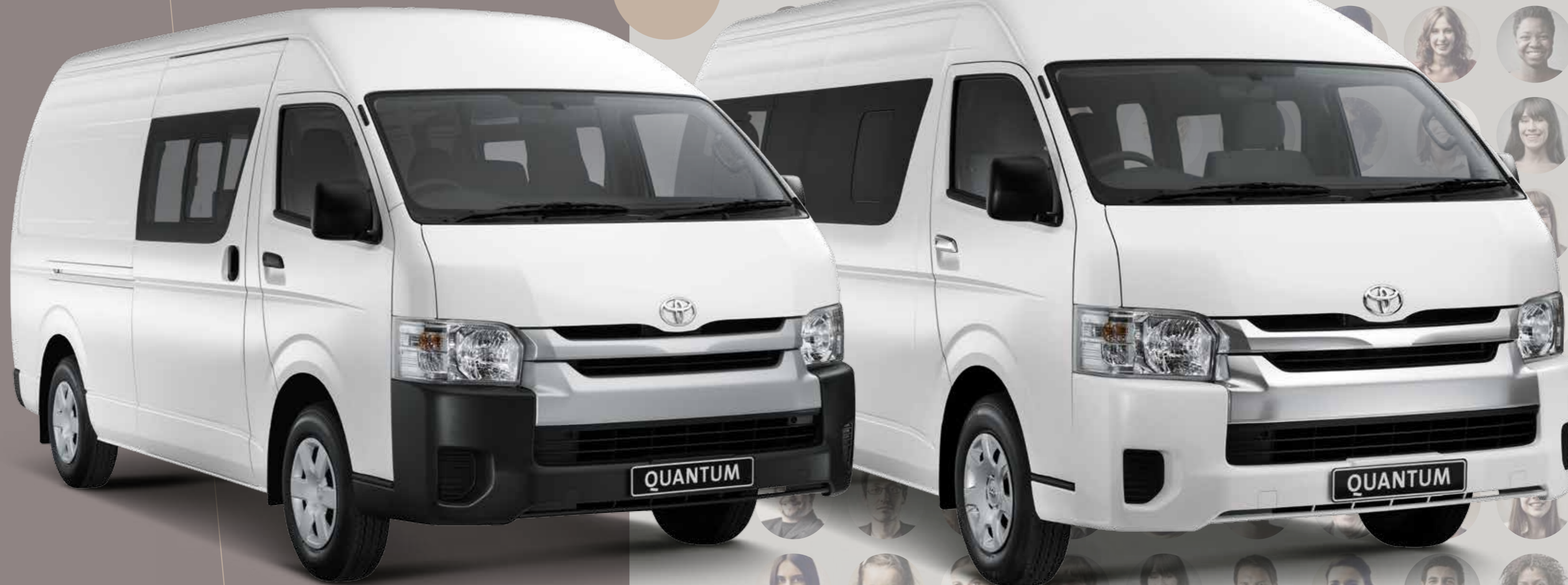
Model Shown Left Quantum Crew Cab Right Quantum Bus