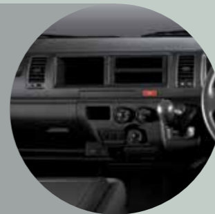
Model Shown Quantum Crew Cab