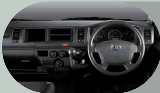
Model Shown Quantum Crew Cab

With power-assisted steering, a high-mounted gear lever and an abundance of storage spaces, the Quantum Panel Van is a pleasure to drive.