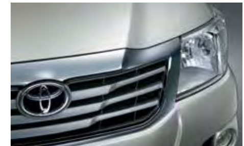
BONNET AND GRILLE