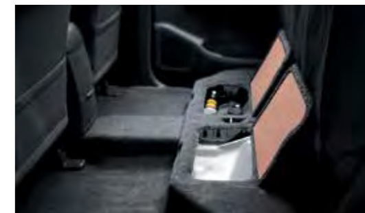
SECURE STORAGE SPACE (XTRA CAB)

*Available on selected models only. See the specification sheet for full details.