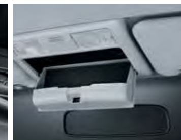
OVERHEAD CONSOLE BOX