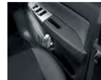
ELECTRICALLY ADJUSTABLE WINDOWS

*Available on selected models only. See the specification sheet for full details.