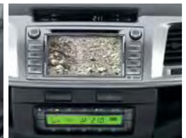
DISPLAY AND AUDIO SYSTEM