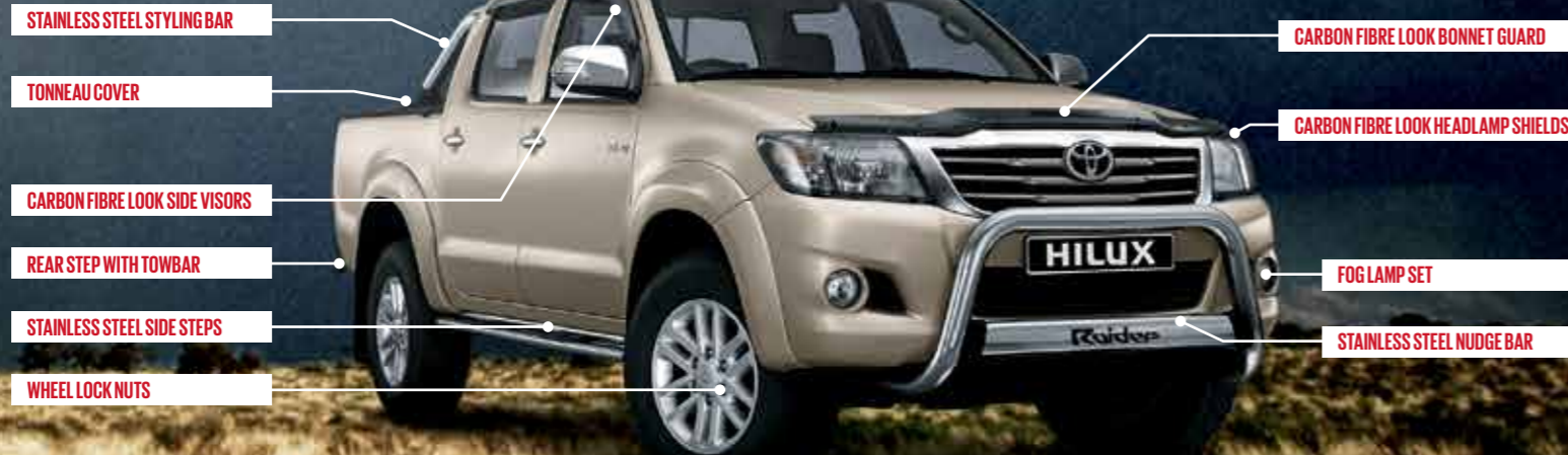
ACCESSORISED 4.0 V6 4x4 RAIDER DOUBLE CAB

ASK YOUR DEALER FOR A FULL LIST OF APPROVED TOYOTA ACCESSORIES.