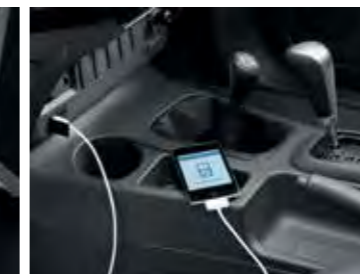
USB AND IPOD INPUTS