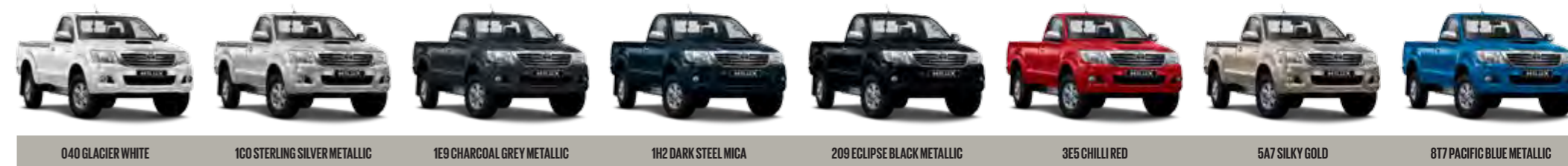
040 GLACIER WHITE