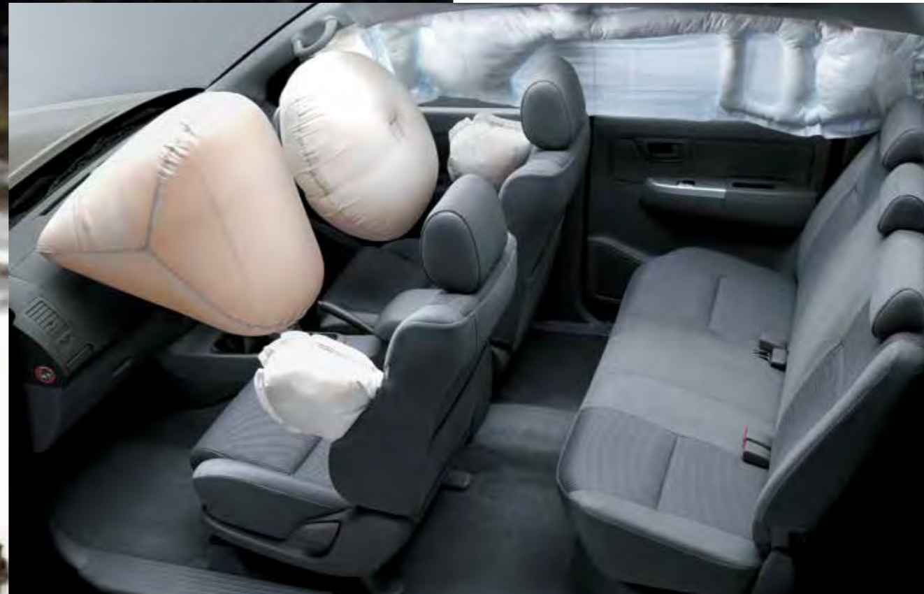
FRONT, SIDE AND CURTAIN SHIELD AIRBAGS*