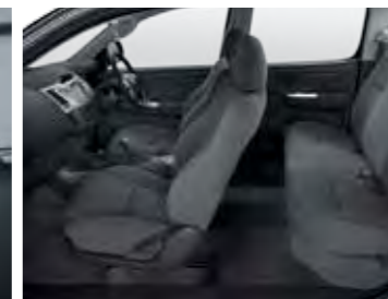
5 PERSON SEATING CAPACITY (DOUBLE CAB)