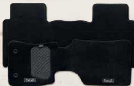
FLOOR MAT WITH DAKAR LOGO EMBROIDERY