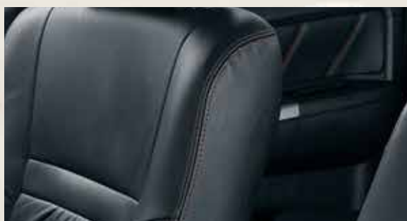
LEATHER SEATS WITH RED REGULAR STITCHING DETAIL