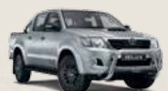
106 CHROMIUM SILVER