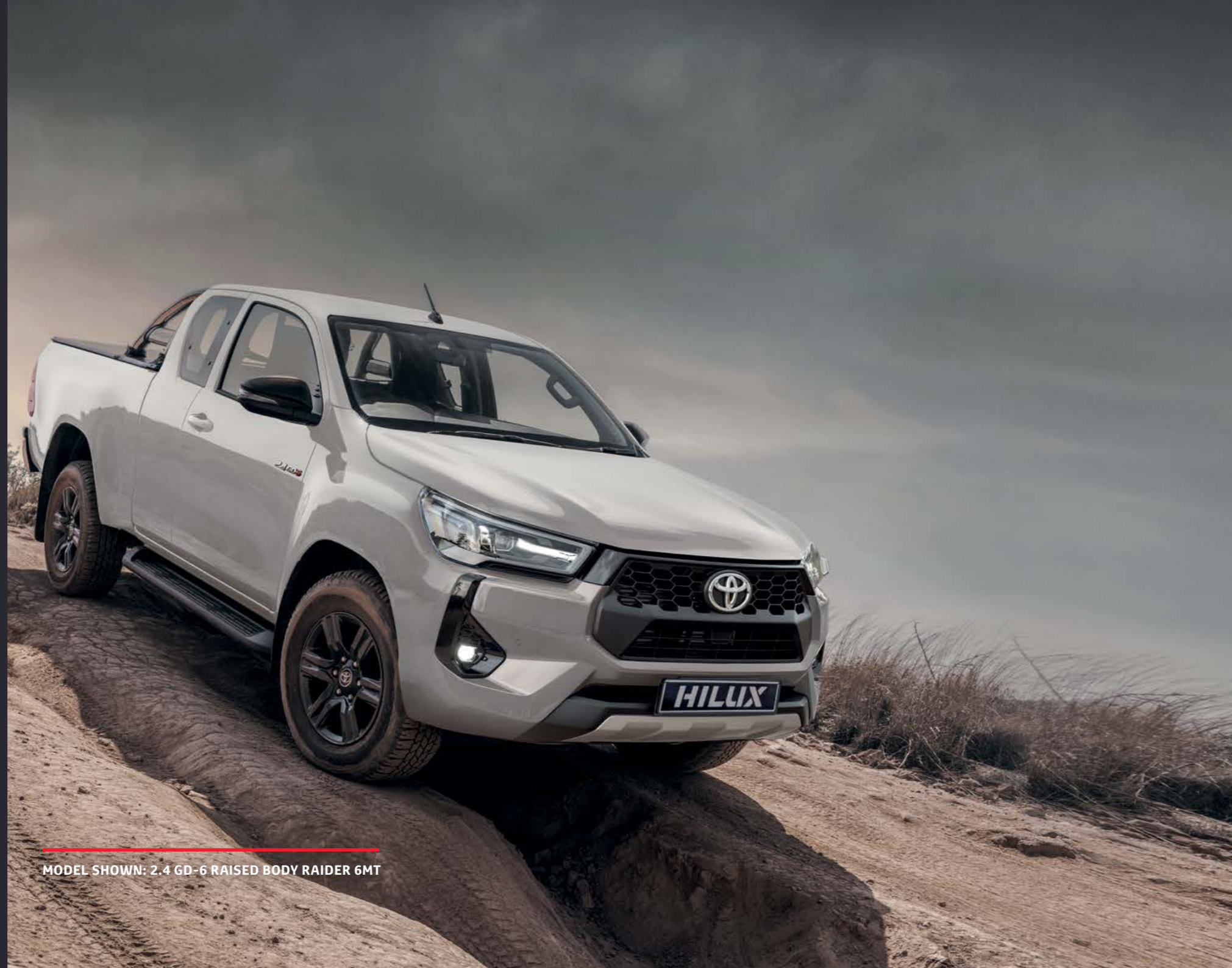
MODEL SHOWN: 2.4 GD-6 RAISED BODY RAIDER 6MT

2.4 GD-6 RAISED BODY RAIDER 6MT 2.4 GD-6 RAISED BODY RAIDER 6AT 2.8 GD-6 RAISED BODY LEGEND 6MT 2.8 GD-6 RAISED BODY LEGEND 6AT 2.8 GD-6 4X4 LEGEND 6MT 2.8 GD-6 4X4 LEGEND 6AT