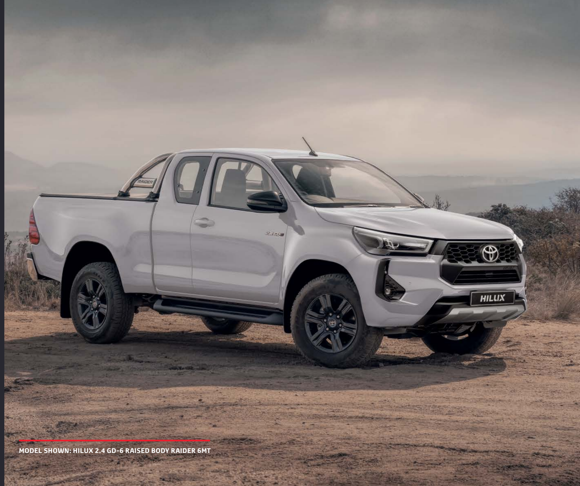
MODEL SHOWN: HILUX 2.4 GD-6 RAISED BODY RAIDER 6MT

NOTHING SHOUTS "BRING IT ON" LIKE A BOLDLY STYLED BAKKIE. BRINGING OUT THE BEST IN THE NEW MODELS – AND YOU – IS AN AGGRESSIVE EXTERIOR PACKAGE THAT CHALLENGES THE STATUS QUO.