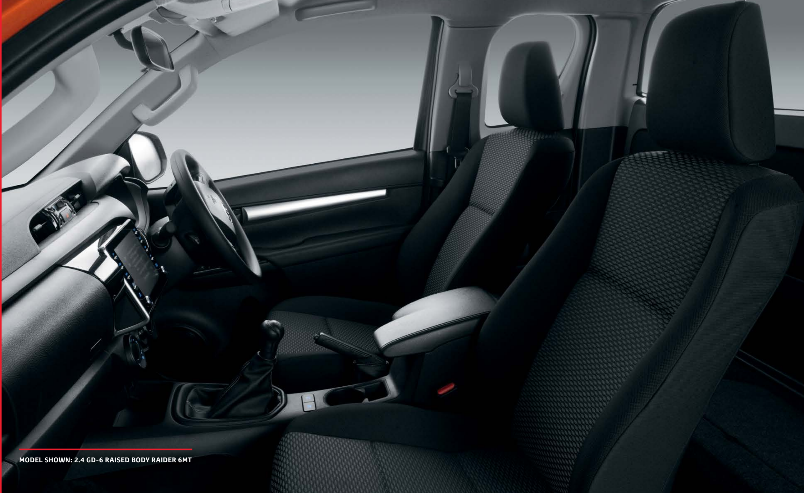
MODEL SHOWN: 2.4 GD-6 RAISED BODY RAIDER 6MT