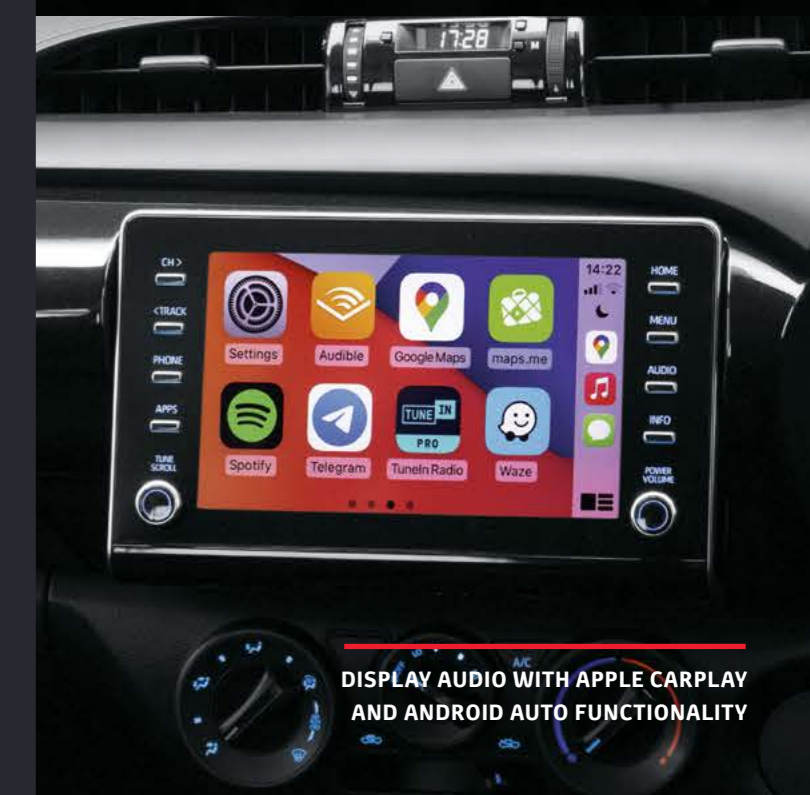
DISPLAY AUDIO WITH APPLE CARPLAY AND ANDROID AUTO FUNCTIONALITY