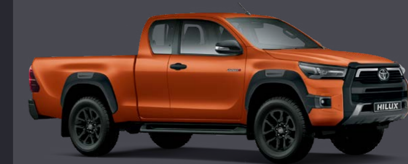
MODEL SHOWN: HILUX 2,8 GD6 4X4 LEGEND 6AT

To enhance the Legend's toughness, an extension to the colour range in Oxide Bronze and Platinum White Pearl has been added.