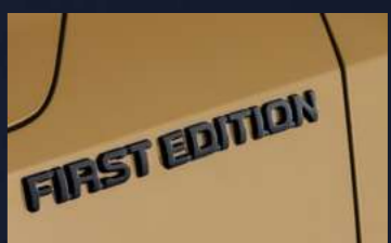
First Edition badging