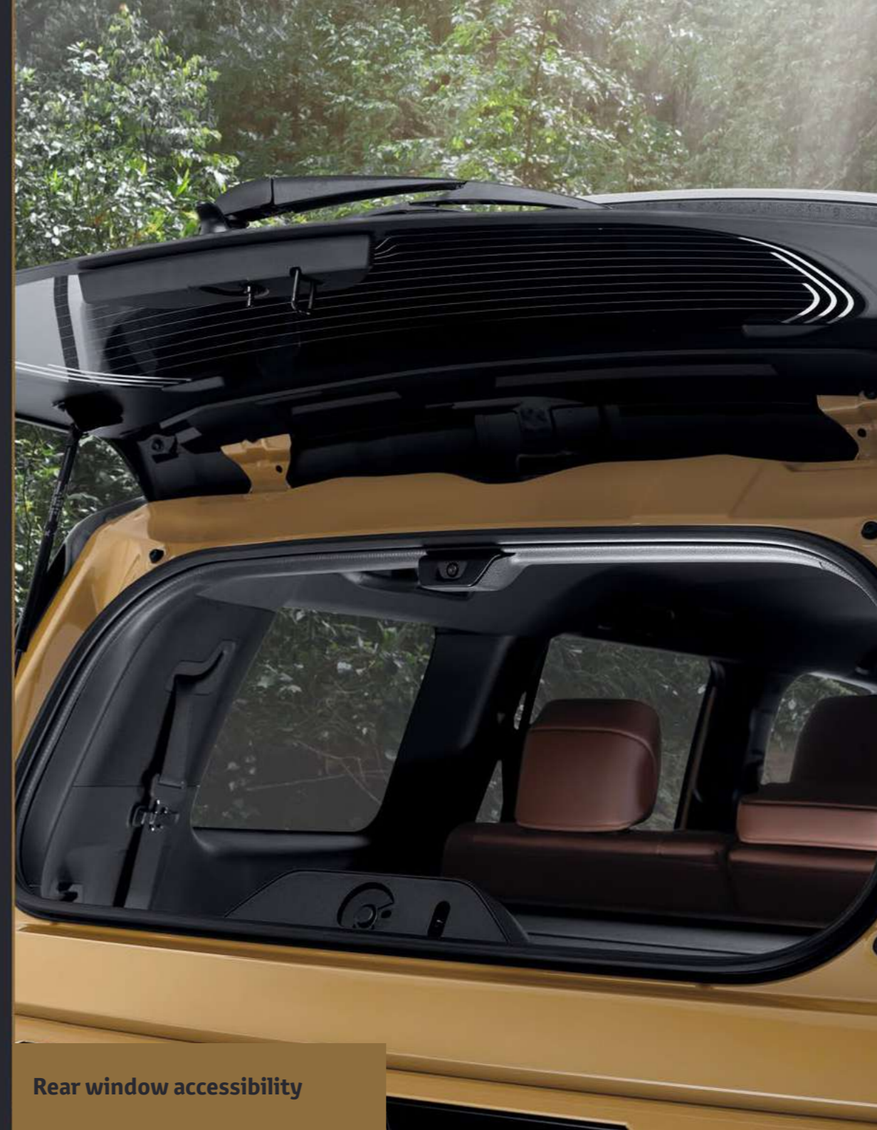
Rear window accessibility

MODEL SHOWN: LAND CRUISER PRADO FIRST EDITION 2.8 VX-R