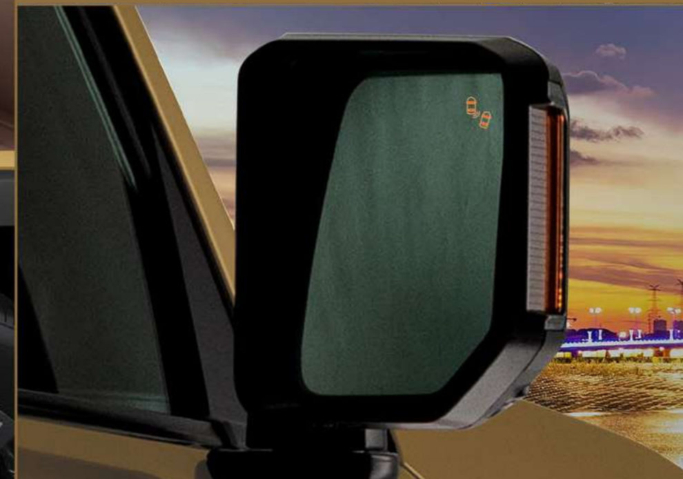
Blind Spot Monitor (BSM)