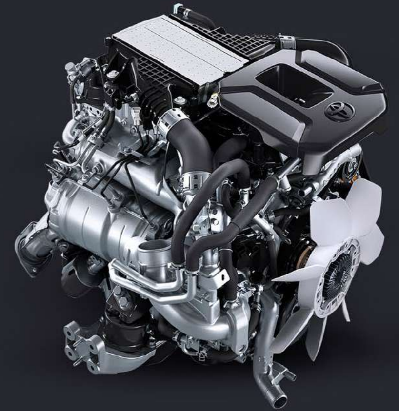
1GD-FTV direct-injection turbo diesel engine

The wild awaits and the Land Cruiser Prado First Edition is equipped with everything you need to take you there.