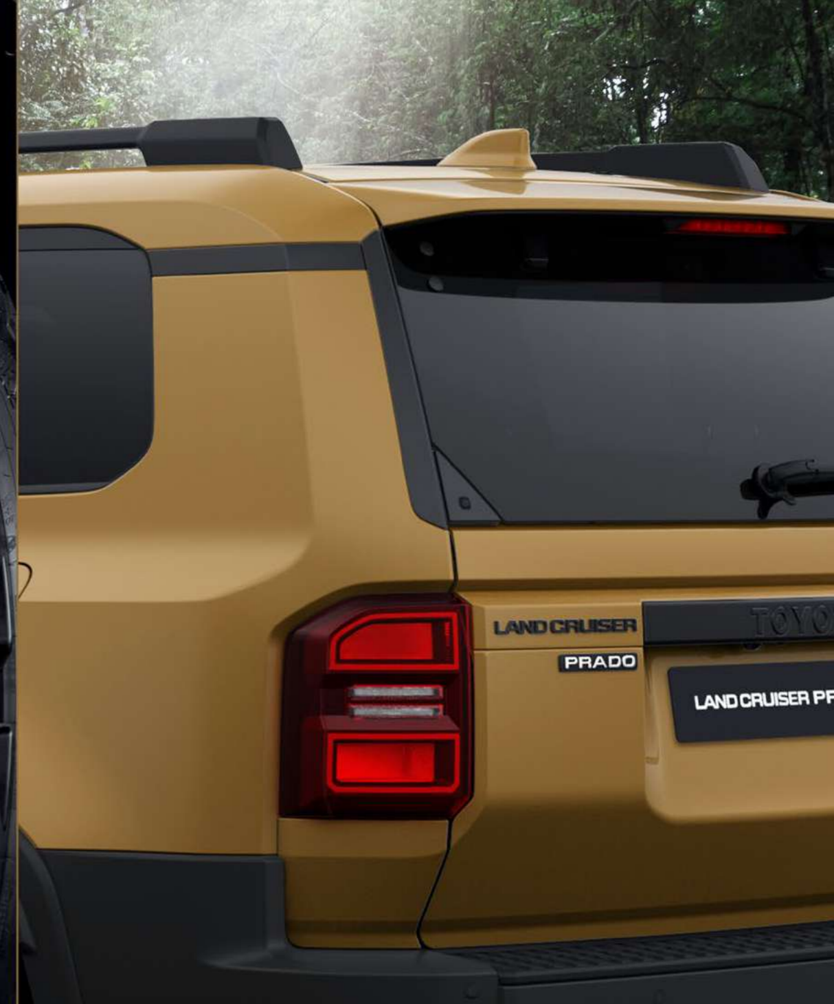
Mud flaps made exclusively for the Land Cruiser Prado First Edition