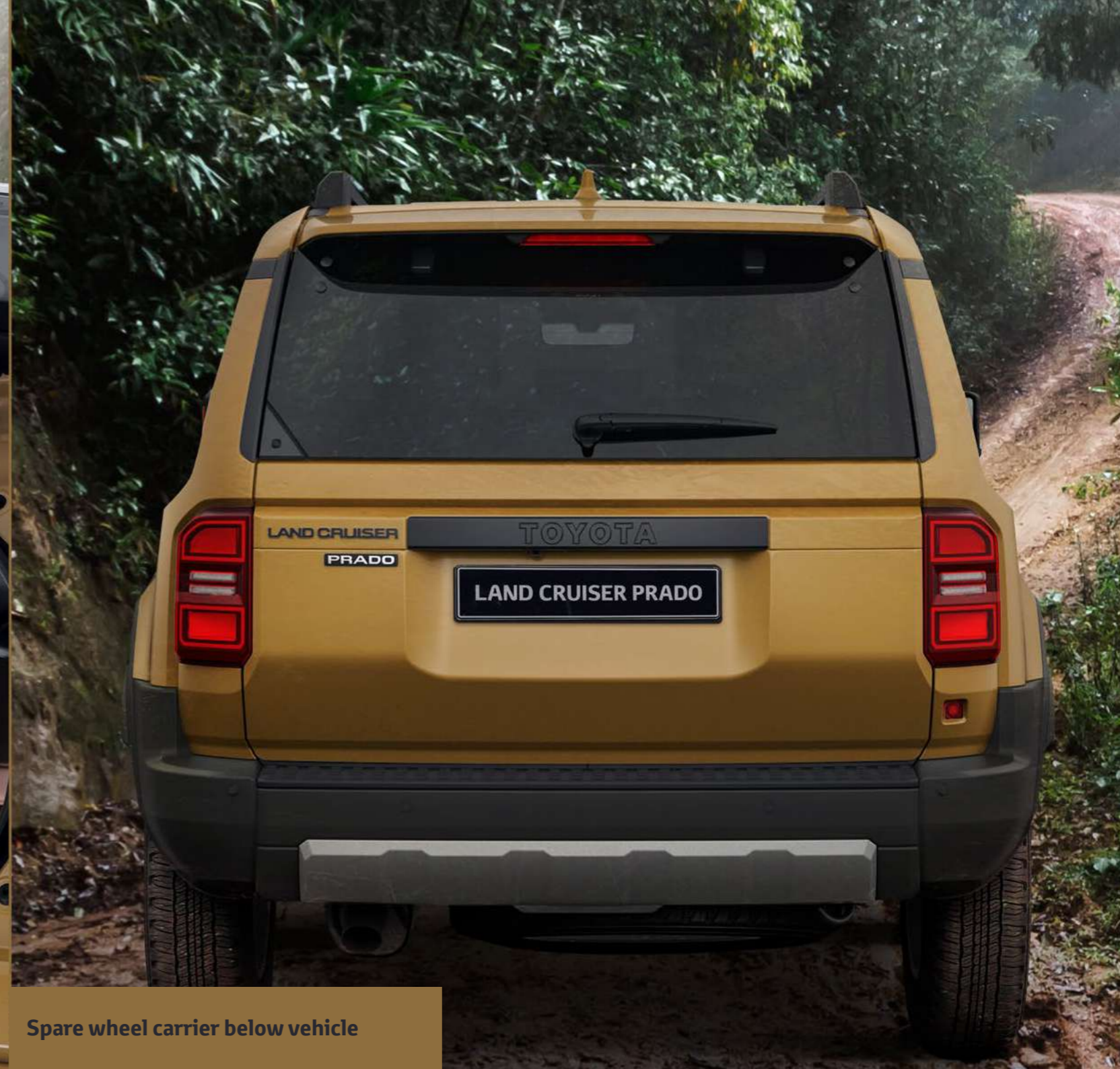
Spare wheel carrier below vehicle