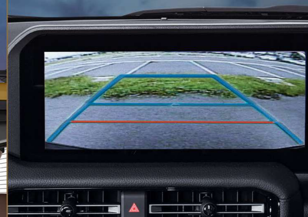
Reverse camera with guidelines