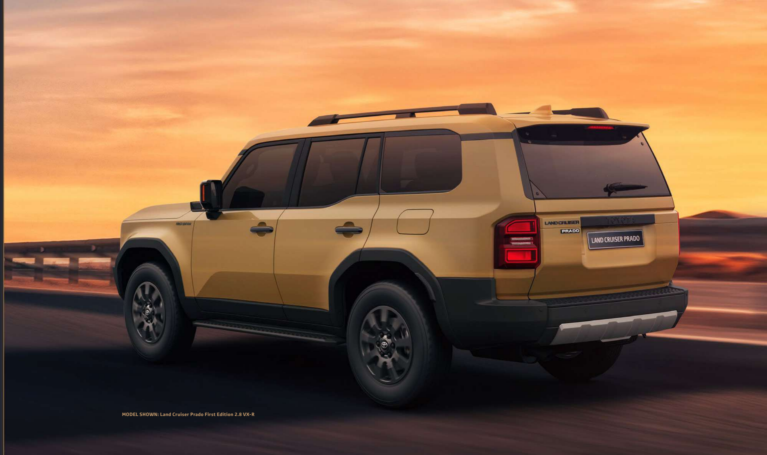
MODEL SHOWN: Land Cruiser Prado First Edition 2.8 VX-R

All-new electric power steering provides a crisper steering feel and enhanced low-speed manoeuvrability on-road, with perfected off-road control, while facilitating compatibility with active safety systems such as Lane Trace Assist (LTA).