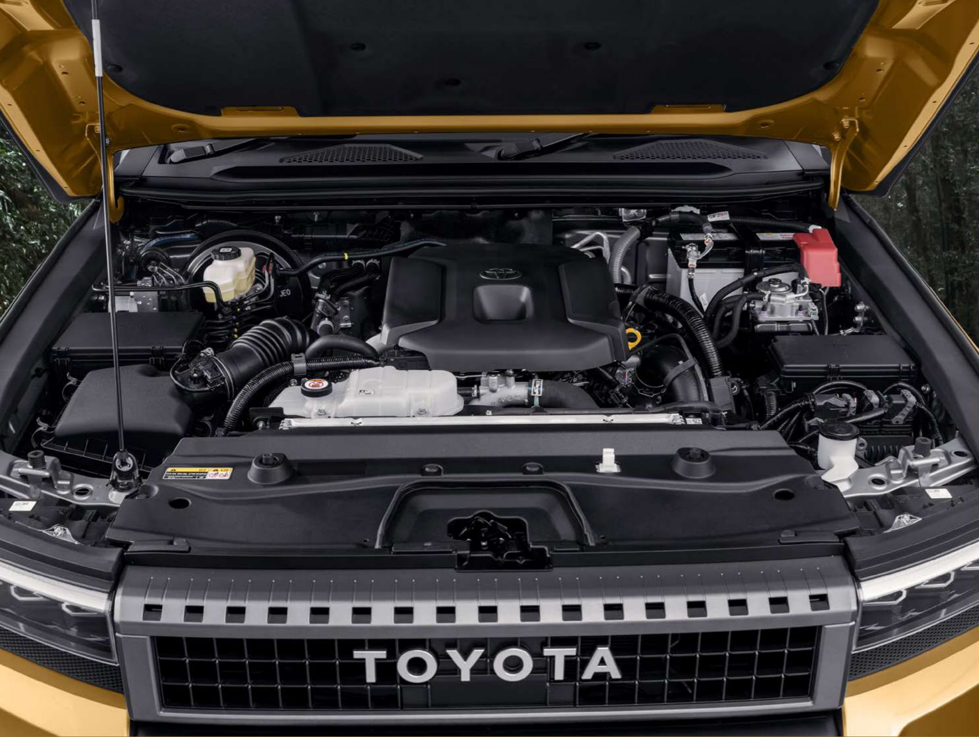
The 2.8ℓ turbo-charged diesel engine powering the Land Cruiser Prado