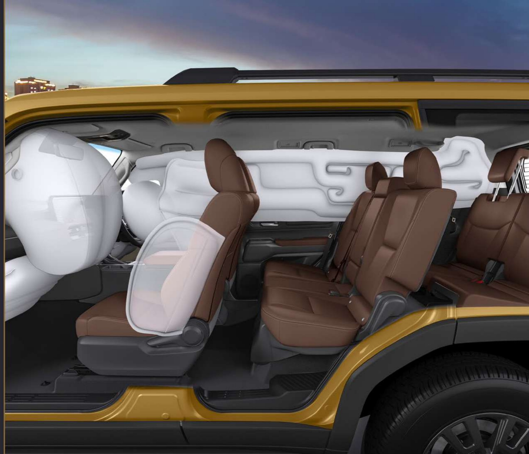
Curtain, driver, passenger, driver and passenger knee, front side and front centre airbags

The only thing to worry about in the Land Cruiser Prado First Edition is where you're heading on your next adventure.