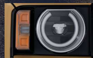
Exclusive round heritage LED headlights