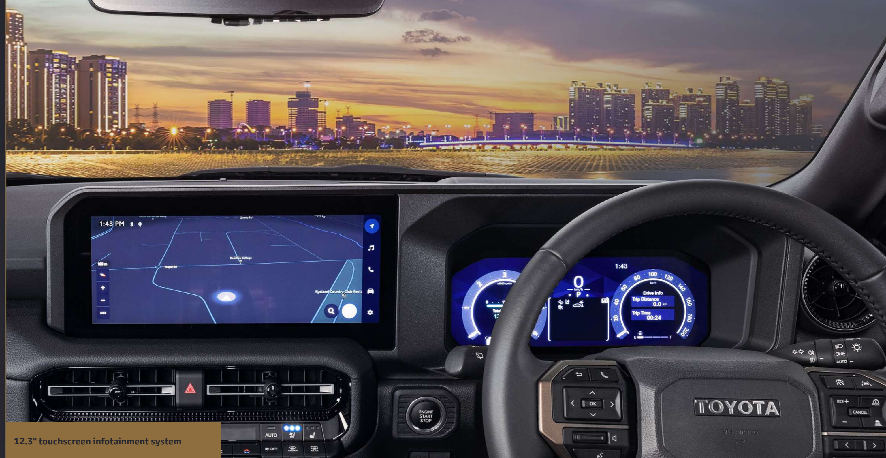
12.3" touchscreen infotainment system

MODEL SHOWN: Land Cruiser Prado First Edition 2.8 VX-R