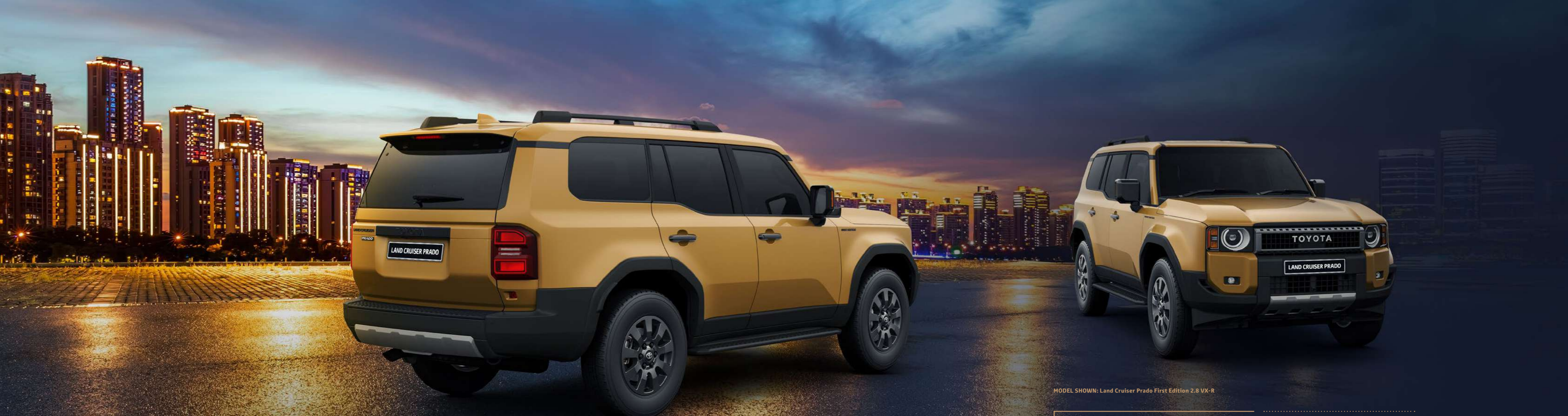
MODEL SHOWN: Land Cruiser Prado First Edition 2.8 VX-R