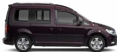
Black Berry Metallic