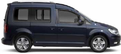
Starlight Blue Metallic