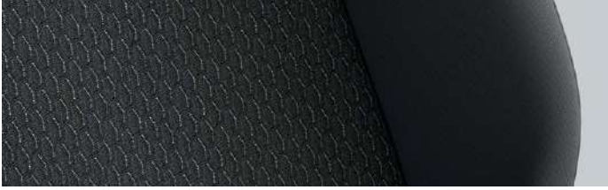
Blue | Titanium Black