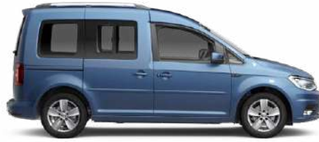
Acapulco Blue Metallic