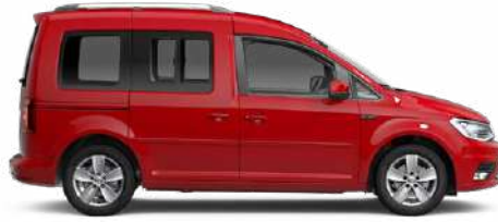
Cherry Red Solid