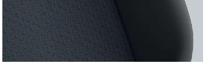
Palladium | Titanium Black