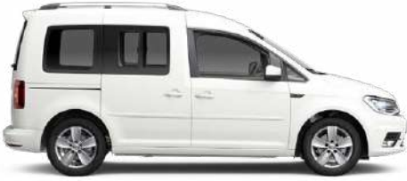
Candy White Solid