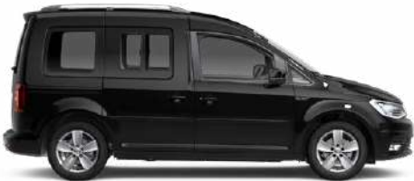
Deep Black Pearl