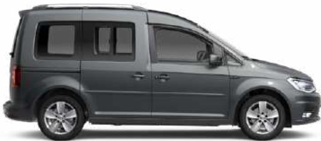
Indium Grey Metallic