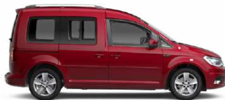
Fortana Red Metallic