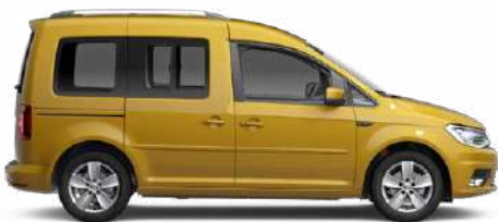
Sandstorm Yellow Metallic