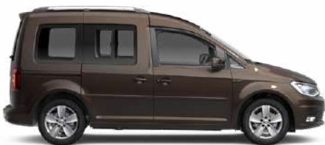
Chestnut Brown Metallic