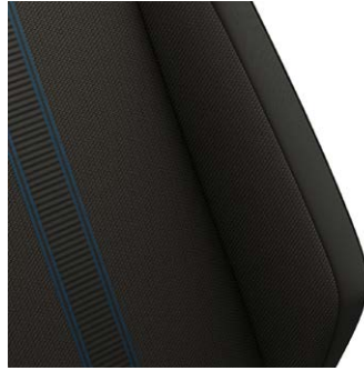
Black – Ravenna Blue – Titanium Black (Optional on Design)