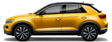
Curcuma Yellow with Black roof Metallic