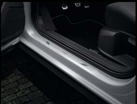
Door strip Front, aluminium, with lettering