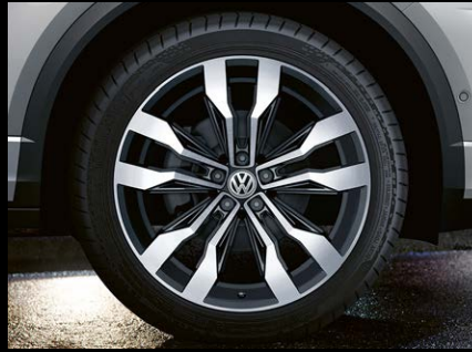
Suzuka 19" alloy wheels (Standard on R-Line model)