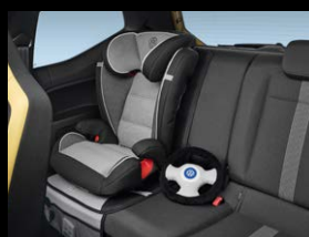
Child seat - 15 to 36 kg G2-3 pro