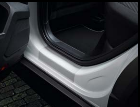
Protective film for the sill rail Rear, transparent