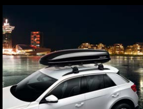
Roof box - 460 litres Comfort, high-gloss black