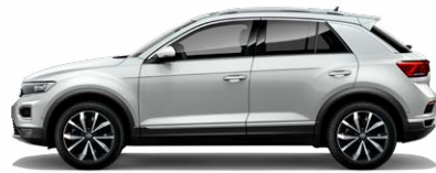
White Silver Metallic