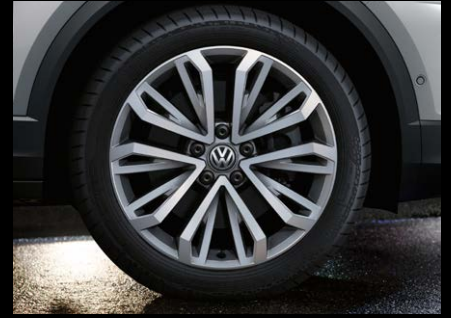
Montego Bay 18" alloy wheels (Optional on Design models)