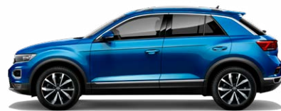
Ravenna Blue Metallic