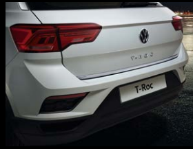
Protective strip for the tailgate Chrome look