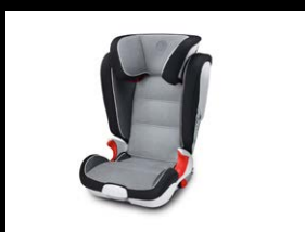
Child seat - 15 to 36 kg G2-3 Isofix backrest removable