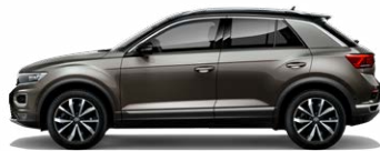
Indium Grey with Black roof Metallic