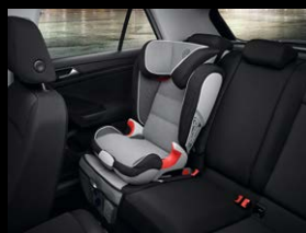
Underlay for child seat system Seat cover