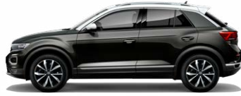
Urano Grey with Pure White roof Non-Metallic