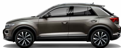
Indium Grey Metallic