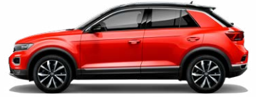
Flash Red with Black roof Non-Metallic