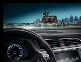
Inside rear-view mirror (Additional) Suction cap mounting