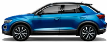
Ravenna Blue with Black roof Metallic