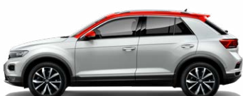
White Silver with Flash Red roof Metallic

International models shown, local specification may differ.