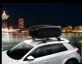
Roof box - 300-500 litres Urban loader, matt black