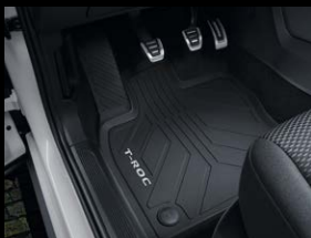
All-weather floor mats Front, Titanium Black, right-hand drive