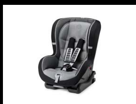
Child seat - 9 to 18 kg G1 Isofix DUO plus top tether