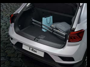
Cargo liner Luggage compartment plug-in module