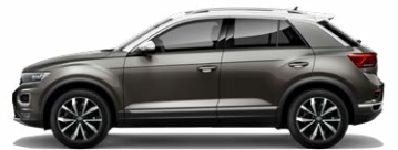
Indium Grey with Pure White roof Metallic