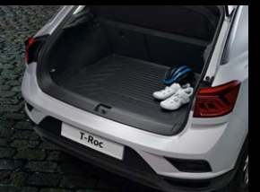
Boot inlay Variable loading surface, top position