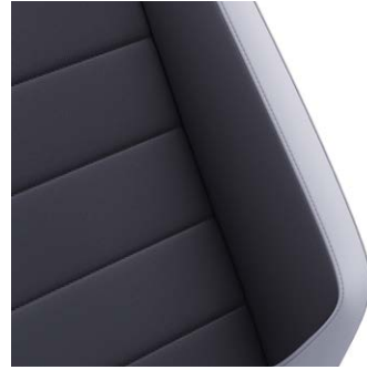
Quartzite – Ceramique – Titanium Black (Standard on R-Line and Optional on Design)