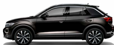
Deep Black Pearl Effect