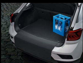
Boot mat Reversible velour/plastic nubs, vehicles with variable loading surface