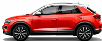
Flash Red with Pure White roof Non-Metallic