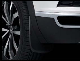
Mud flaps Rear