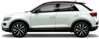
Pure White with Black roof Non-Metallic