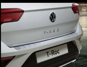
Loading sill protection Plastic, brushed stainless steel look