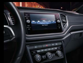
Activation document for AppConnect MirrorLink™, Apple CarPlay™, Android Auto™