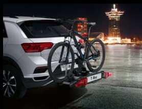
Bicycle carrier for towing hitch 2 bicycles, Premium, folding Load [kg]: 60 Own weight [kg]: 13,0