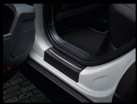
Protective film for the sill rail Rear, black / silver