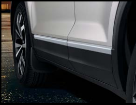
Mud flaps Front