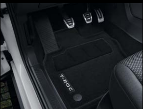
Textile footmat Front and rear, with T-Roc lettering, 1 set = 4 pieces