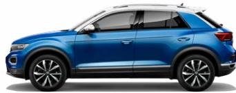
Ravenna Blue with Pure White roof Metallic