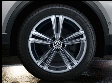
Sebring 18" alloy wheels (Optional on Design models)