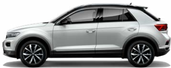
White Silver with Black roof Metallic