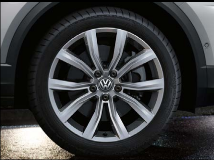
Grange Hill 18" alloy wheels (Optional on Design models)