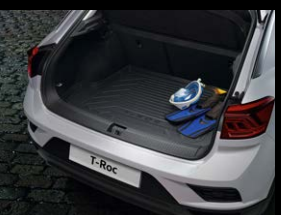
Boot tray Variable loading surface, top position