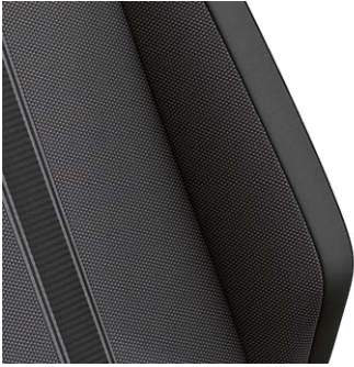
Black Oak – Ceramique – Titanium Black (Optional on Design)