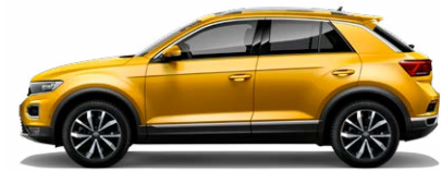
Curcuma Yellow (Only available on Design model) Metallic