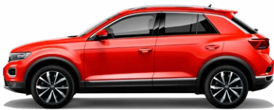
Flash Red Non-Metallic