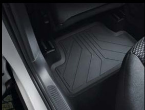
All-weather floor mats Rear, Titanium Black, 1 set = 2 pieces