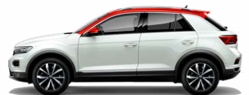
Pure White with Flash Red roof Non-Metallic