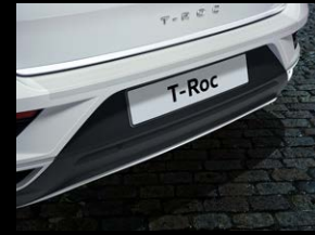
Loading sill protection Transparent