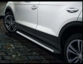
Footboard for the side skirt Transparent