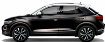
Deep Black with Pure White roof Pearl Effect