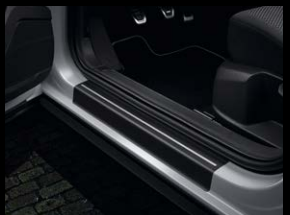
Protective film for the sill rail Front, black / silver